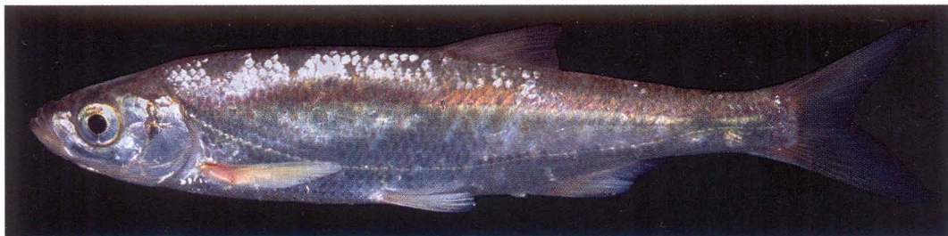
Fig. 1. Alburnus volviticus , same data as FSJF 1665, about 120 mm SL, not preserved; Greece: Lake Volvi at Mikra Volvi.

Dorsal fin with 8\frac{1}{2} branched rays. Caudal fin forked, with 9+8 branched rays. Anal fin with 14\frac{1}{2} (4), 15\frac{1}{2} (6), 16\frac{1}{2} (2) branched rays. Pectoral fin with 16-17 rays. Pelvic fin with 9-10 rays. Axillary pelvic lobe present. Lateral line complete, reaching caudal-fin base, perforating 56-66 scales on body and 4 on caudal-fin base. 9\frac{1}{2} scale rows between dorsal-fin origin and lateral line, 18 circumpeduncular scales, 3 scale rows between pelvic-fin origin and lateral line.