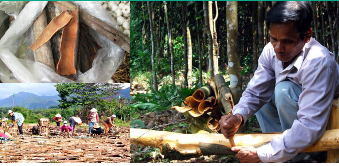
01 | BARK HARVESTING

In addition to knowing the economic value of Philippine cinnamon, it is also important to understand the proper methods of harvesting it. The lack of documented methods and low awareness among forest communities on the sustainable harvesting, utilization and processing of cinnamon is one of the key threats for this important, lesser-known forest resource.