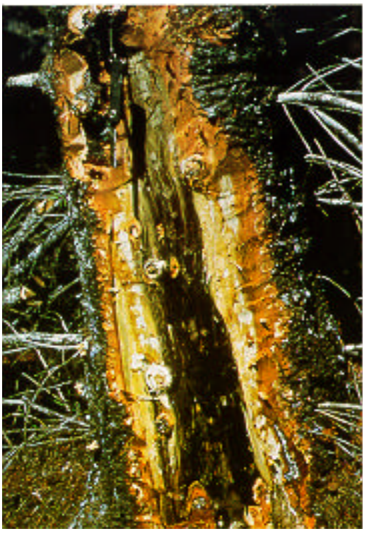
Figure 3 — Typical dark sapwood stain associated with black stain root disease.

Trees infected by the black stain fungus usually exhibit symptoms of gradual decline before they die (figures 1 and 2). In early stages of decline, terminal growth is reduced and older needles become chlorotic. As the disease progresses, older needles are shed prematurely, new needles are somewhat stunted and yellow, and reduced internodal growth is evident on lateral branches. In advanced stages, new growth is compact and chlorotic, with a tufted appearance, and tree crowns exhibit very sparse foliage. They also bear "distress" cone crops. Very small trees, or those affected by other significant stress factors, may succumb quickly without exhibit-