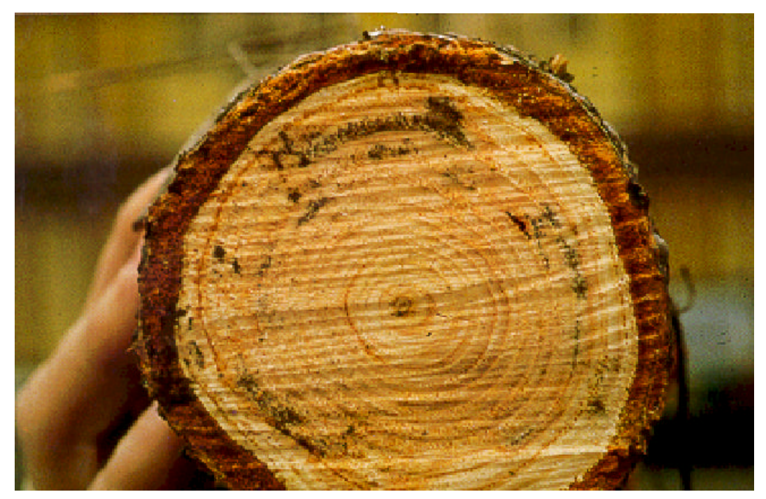
Figure 4 — Cross section through affected root showing arc-shaped pattern of black stain.