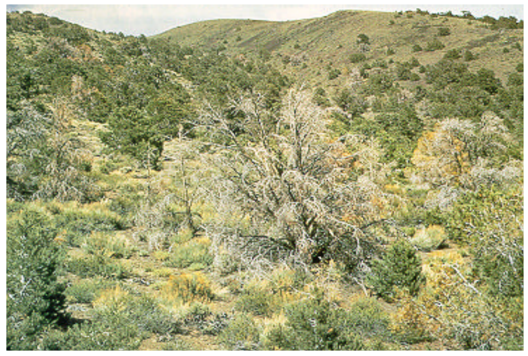
Figure 7 — Black stain root disease center in singleleaf pinyon.