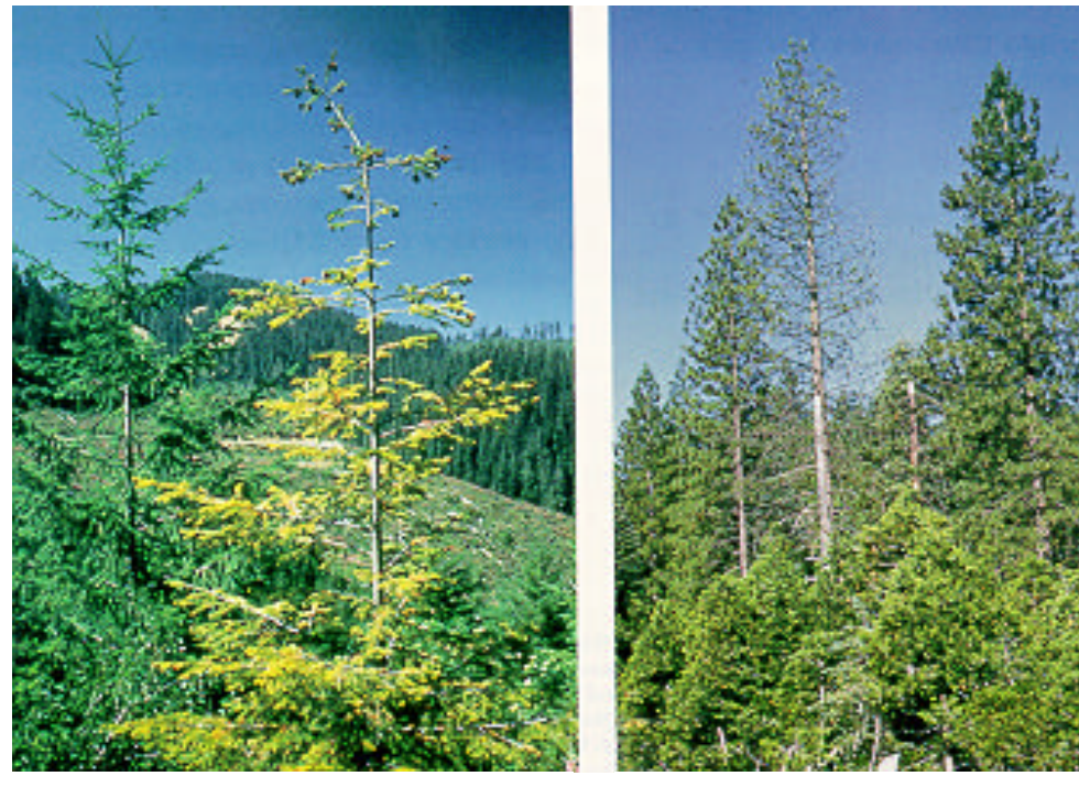
Figure 1 — Crown symptoms of black stain root on young Douglas-fir.

Black stain root disease occurs over a wide range of environmental conditions, from the hot and semi-arid Southwest to cool Pacific coastal areas. Soil type does not appear to be a major factor in the distribution of the disease. Soil moisture and temperature, however, may influence disease distribution significantly. Cool, moist soil conditions in spring and early summer are ideal for infection,