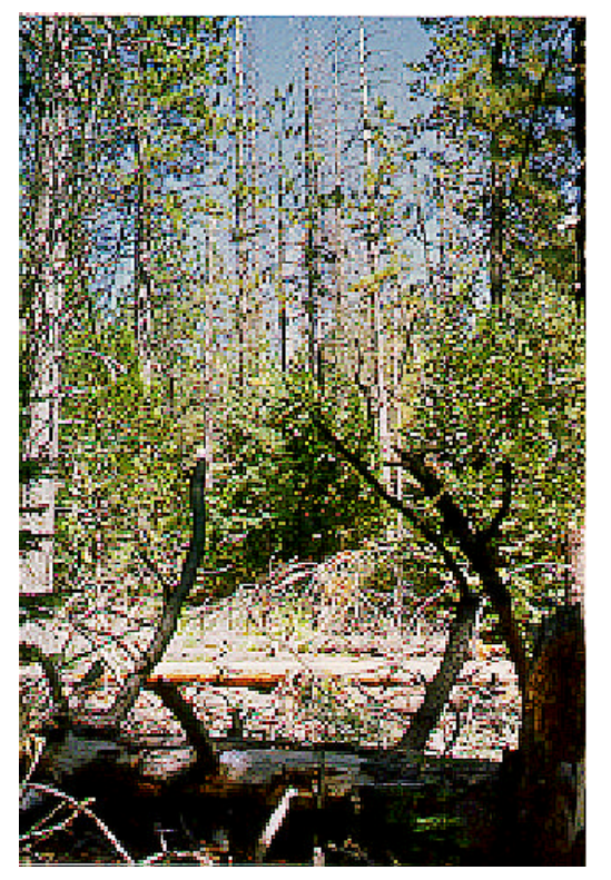
Figure 5 — Black stain root disease center in a second-growth ponderosa pine plantation.

hibiting gradual decline symptoms; foliage may change rapidly from green to yellow or reddish brown.