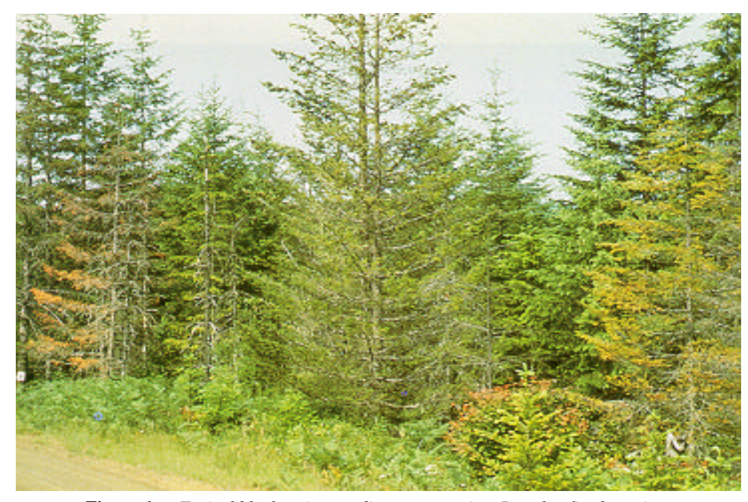
Figure 6 — Typical black stain root disease center in a Douglas-fir plantation.

Black stain root disease affects groups of trees in distinct infection centers (figures 5-7). Typical infection centers have trees in various stages of decline near the perimeter and dead trees in the interior nearer the origin of initial infection. Infection centers usually occur in well-stocked stands where a preferred host predominates or occurs in unmixed clumps. In stands where species composition is well mixed,