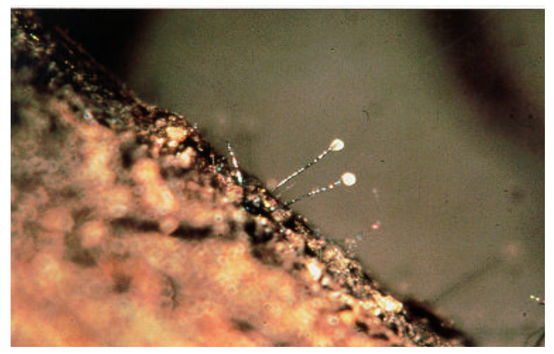
Figure 9 — Enlargement (25x) of fruiting bodies of the black stain root disease fungus in an insect gallery, showing sticky spore masses.

Leptographium wageneri sporulates readily inside insect galleries in infected roots and root collars. Stalked, microscopic fruiting bodies (conidiophores) form on gallery walls, each bearing a sticky spore droplet that protrudes into the gallery. These sticky spore droplets are well suited to insect dispersal (figure 9). During emergence, some young adult beetles are contaminated with spores as they brush against spore droplets in galleries or pupal chambers. Contami-