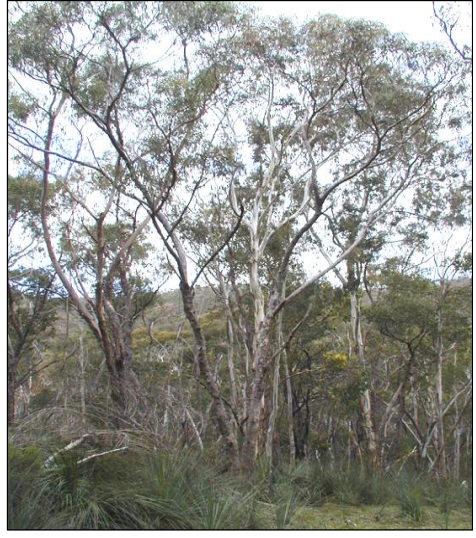
Plate 3- Tall open forest

The drainage lines are often permanently moist and support remnants of tall open E. leucoxylon, E. viminalis ssp. cygnetensis and E. obliqua forest (Plate 3), over an understorey of Xanthorrhoea semiplana, Acacia paradoxa, A. pycnantha, Dodonea viscosa and Hibbertia exutiacies. Pteridium esculentum and introduced grasses can be found on the higher slopes. Many of these trees are mature and contain nesting hollows for fauna, unlike the overstorey on the more accessible slopes, which is multi-stemmed coppice regeneration as a result of past timber cutting.