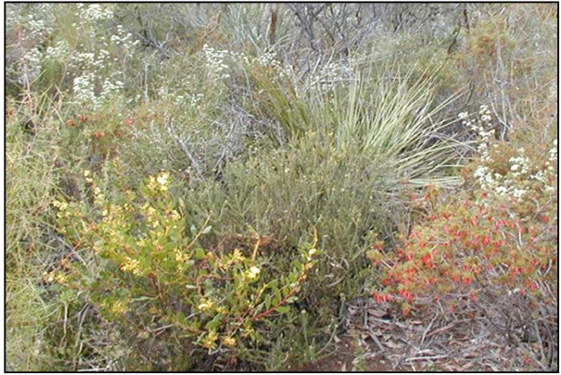
Plate 1 – Eucalyptus goniocalyx/ E. fasciculosa Plate 2 – Diverse shrub and ground flora. Low Woodland.

E. obliqua/E. goniocalyx/E fasciculosa Low Open Forest Eucalyptus obliqua, E. goniocalyx and E. fasciculosa occur primarily on the lower slopes and gullies. They occur over an understorey of predominantly Xanthorrhoea semiplana, Acacia paradoxa and A. pycnantha.