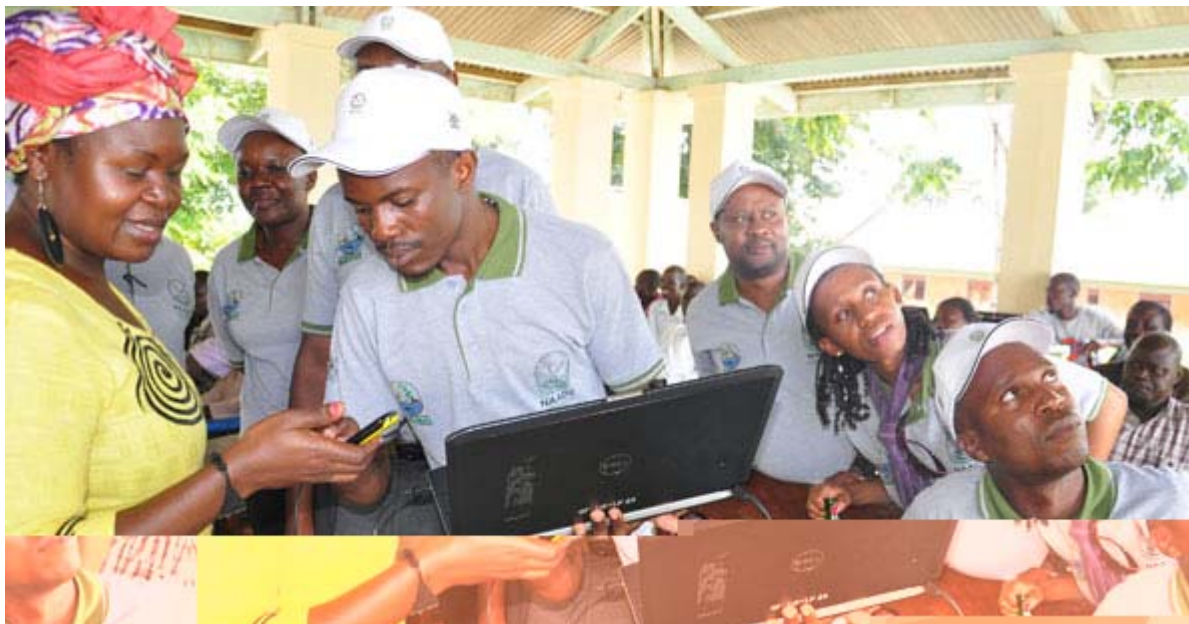
Figure 5: SMEs could obtain exponential growth of their businesses as they move online

E-commerce can be a very rewarding venture, but not overnight. The findings of a group of African Business Forum staff and other financial experts in 2013 on Cameroon show that 28.6% of SMEs is in the graduation state while 1.6% is in the expert state.