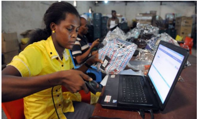
Figure 8: E-commerce handles product authenticity issues

For securing channels, financial institutions, EXCO meeting rooms and medical or insurance companies that handle sensitive information need to be protected against information leaks. The system should allow them to restrict applications on phones in areas where information discussed or handled is confidential. Government