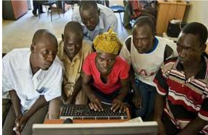
Figure 3: An Agricultural SME making use of internet services for business.

E-commerce is still growing in Cameroon, but there have been some success stories that show the country is ready for it. According to the International Telecommunications Union reports in 2013, voice expenditure in the country has dropped from 73% of mobile budget to 55%, while data has increased from 12% to 36%. At the beginning of 2014, voice stood at 53% and data at 48%. SMS expenditure remains steady at 20%. Older citizens (46-55) are clinging to former business methods and are reluctant to accept new e-commerce trends. E-commerce solutions should therefore be made to suit the youthful populations more. According to Globex Cameroon, an e-commerce giant in the country, there are more than 100 additional hard and soft skills that are also expected from the next generation leaders. It is therefore vital for business operators to have the right mindset and facts to consider when creating an E-commerce solution for business: