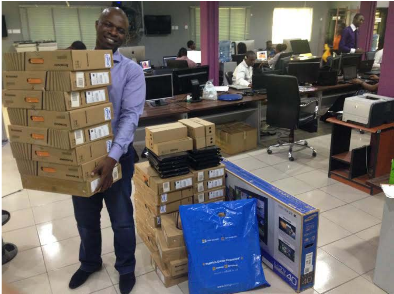
Figure 7: As in other African countries, Cameroon could benefit a lot from delivery services for purchases made online.

Improved Quality of Internet Connection Infrastructure: This is seen to be an essential component for any internet-based application. Since the internet is considered as the most prominent e-transaction distribution channel, good internet connection ensures the completion of electronic processes.