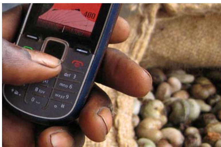
Figure 6: Switching rural populations from telephony applications to Internet services is just a matter of time, but very possible.

Research by the International Telecommunications Union shows that as many as 32% of Small and Medium Sized Enterprises globally rely on more than one Internet device during the average working day to conduct their duties and half of the world's Chief Information Officers (CIOs) view Wi-Fi as an essential part of operations. Rural Cameroon therefore cannot be left out.