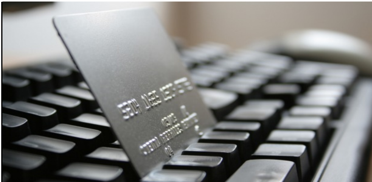
Figure 4: Electronic Banking; a major facilitator of E-Commerce

provide opportunity for consumers in and out of Cameroon to pay for services on web points bearing electronic card logos.