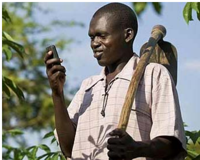
Figure 2: Customized Technology would yield more benefits for users