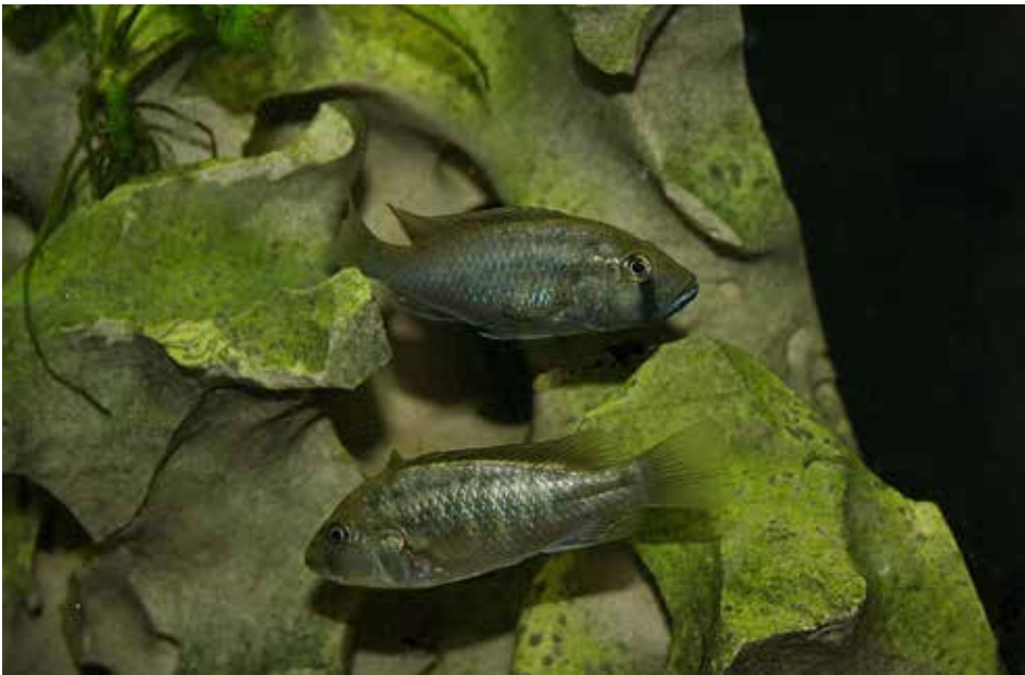
Astatotilapia flavijosephi pair.

August of 2009, with a large smile, Anton presented me with five A. flavijosephi of slightly over 1 cm in size. Once they settled in to their prepared aquaria, growth was rapid and the biggest, a male, began to color. These fish are a basic tan-silver coloration with twelve faint vertical bars crossing the flanks. Fins are transparent. Dominant male coloration is spectacular! The entire underside is jet-black as are the pelvic fins. Two or three large orange egg spots adorn the anal fin. These ocelli cross the fin rays. The bottom lip is bright blue. A black bar begins at the top of the eye socket and continues downward past the corner of the mouth and merging with the black of the throat. The base coloration of the head is tan while the body is a similar coloration with a slight reddish tinge. Beginning around the pectoral socket and continuing rearward towards the caudal peduncle is an orange splotched area. This coloration is restricted to the abdomen. Dark blotching along the flanks occurs in both sexes when stressed. The male overall is a much darker