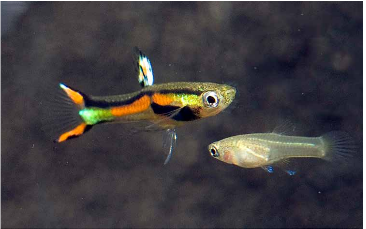
Pure wild strain Endler's.