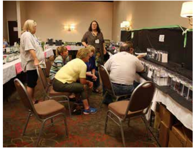
Narrowing down the competition to the Best and Reserve Best of Shows.