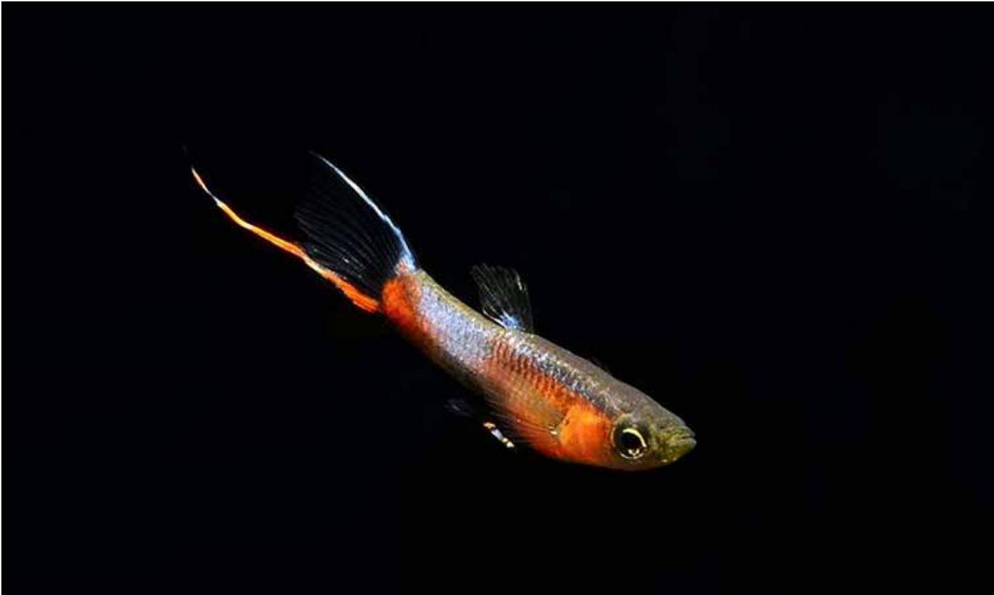
Bottom: A typical Guppy x Endler Hybrid.