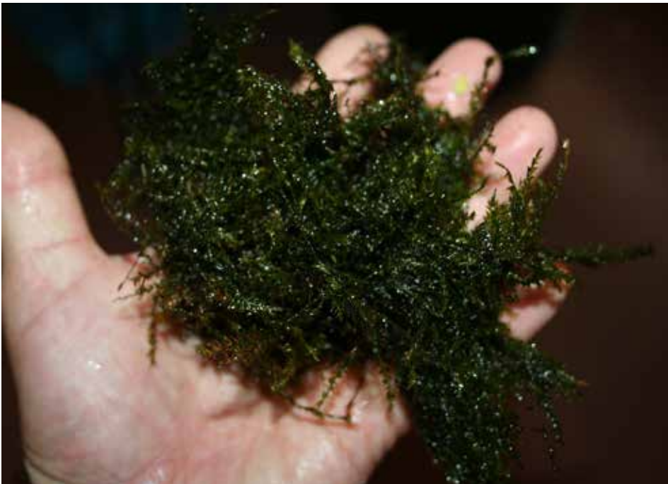
Willow Moss is increasing in popularity as it is more widely available now.

Amazon sword plants of the genus Echinodorus are another good choice. I really like the Oselot sword with its spotted leaves. The first stem plant I will mention is Water Wisteria, Hygrophila polysperma . Unlike most stem plants Water Wisteria has big oak shaped leaves. This will contrast well with other plants.