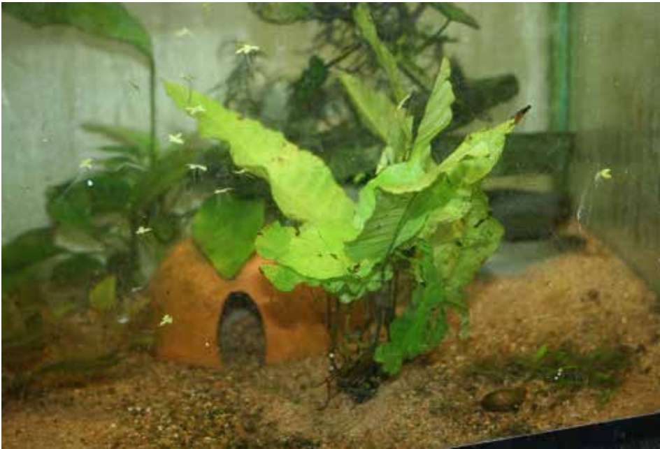
African bolbitis is a more recent introduction that aquarists are beginning to favor.

Several species of Fissidens go by the name of Phoenix moss. Fissidens fontanus is a US native.