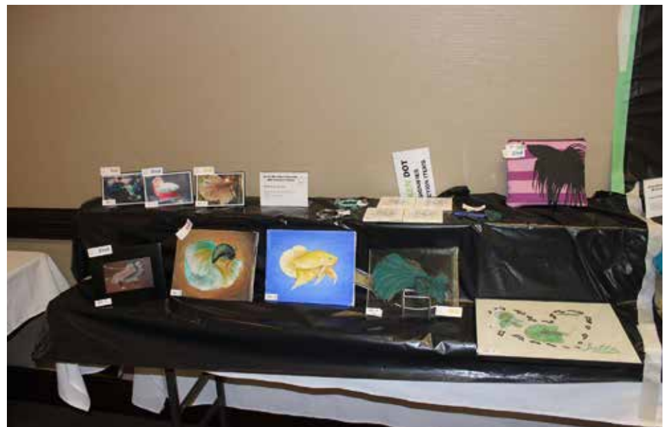
The art entries for the show. There was quite a variety at this show.