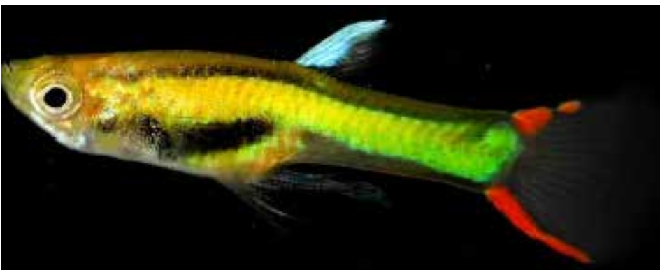
A more wild looking bottom sword Endler.

Overall, the Endler's Livebearer is an extremely easy fish to keep! In fact, it's easier than keeping a Guppy! There are many beautiful strains to choose from too! It's small, beautiful, easy to keep, and extremely active! Once you lay eyes on them, you'll quickly see why they are my favorite fish species. Did I mention they are fairly cheap? Well, quit reading this article and go get some Endler's! If you have any questions feel to contact me!