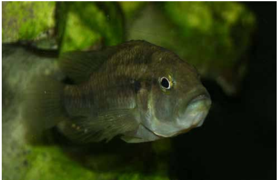
A male Astatotilapia flavijosephi hanging out in front of the rockwork.

Fully adult males reach a size of 13cm while the females stay slightly smaller. A unique feature of this species is that pharyngeal dentition differs between the sexes. “The median teeth are molariform in males, slender and blade-like in females and juveniles” – Paul Loiselle. It is generally found in shallow waters among vegetated growth. Males feed mainly on snails whist females