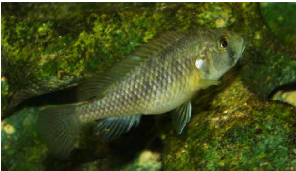
A young male Astatotilapia flavijosephi cruising the rockwork.

adaptable to our artificial environments. Astatotilapia flavijosephi has quickly become one of my favorite cichlid species. I hope to someday acquire a different population for comparison reasons but in the meantime, with a little bit of luck, young from my small group will be distributed to other hobbyists in an attempt to establish healthy groups of this rare cichlid in our aquariums.