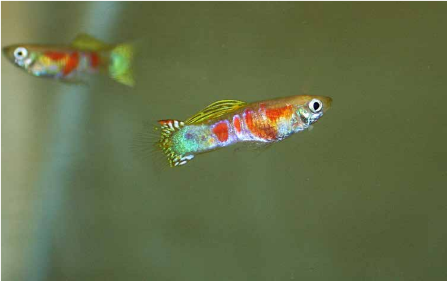
Top: Blonde Endler males.