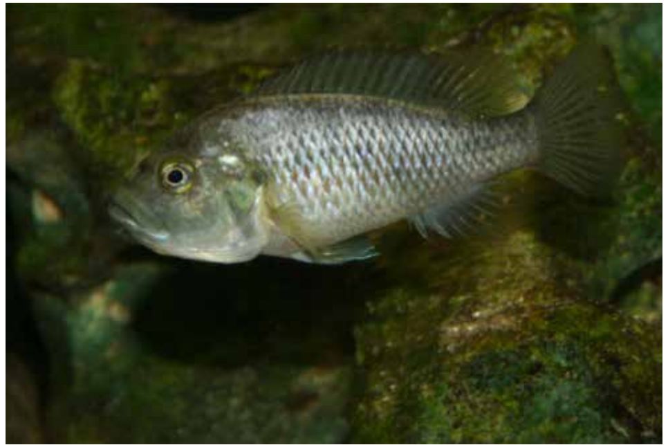
A female Astatotilapia flavijosephi holding fry.

What a shame it has been for the cichlid hobby that this fish has yet to find a home in our tanks. It is highly attractive species and easily