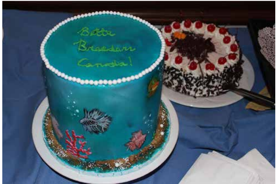
The BBC Cake was a work of art on its own. We had a hard time when it actually came to cutting the cake.