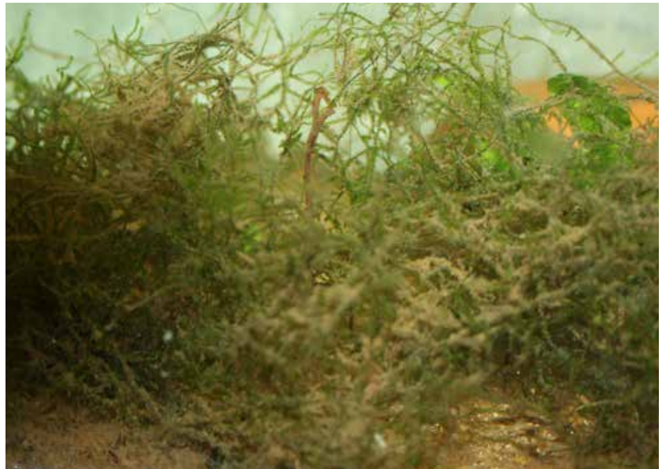
Java Moss has been a mainstay for Aquarists for many years.

Aponogeton is a genus of plants that grove from bulbs. Some go thru a dormant stage during the cold months. Aponogeton undulatus is a species that can grow in low to medium light. Back in the day you could get big Mystery bulbs for $0.50. They would grow to the top of the aquarium and bloom.