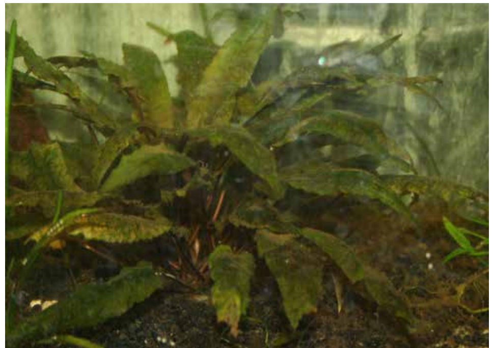
Cryptocornes are gaining in popularity as a medium light plant that is easy to keep.

The second technique is to attach the plant with something that will