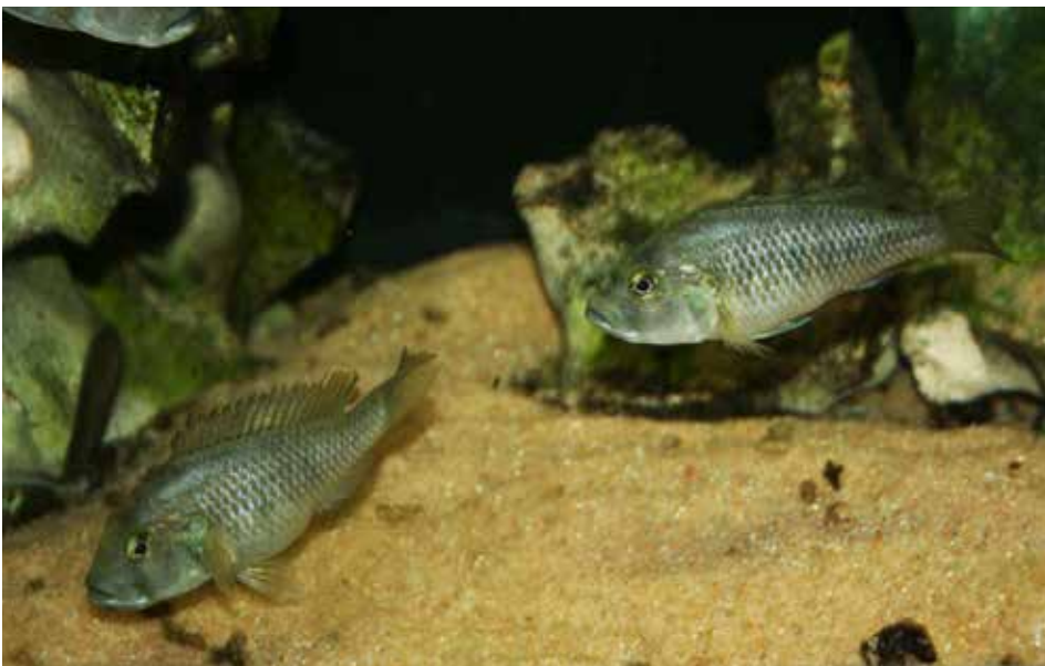
A pair of Astatotilapia flavijosephi starring the spawning dance.

The population I am working with originated at a location known today as the Hakibbutzim Stream Nature Reserve in Israel. This is a heavily vegetated stream. It has since become a highly protected area and, as such, hopefully a stronghold for this amazing cichlid for years to come.