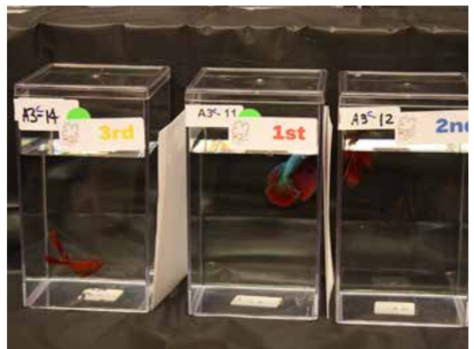
Some of the show winners.