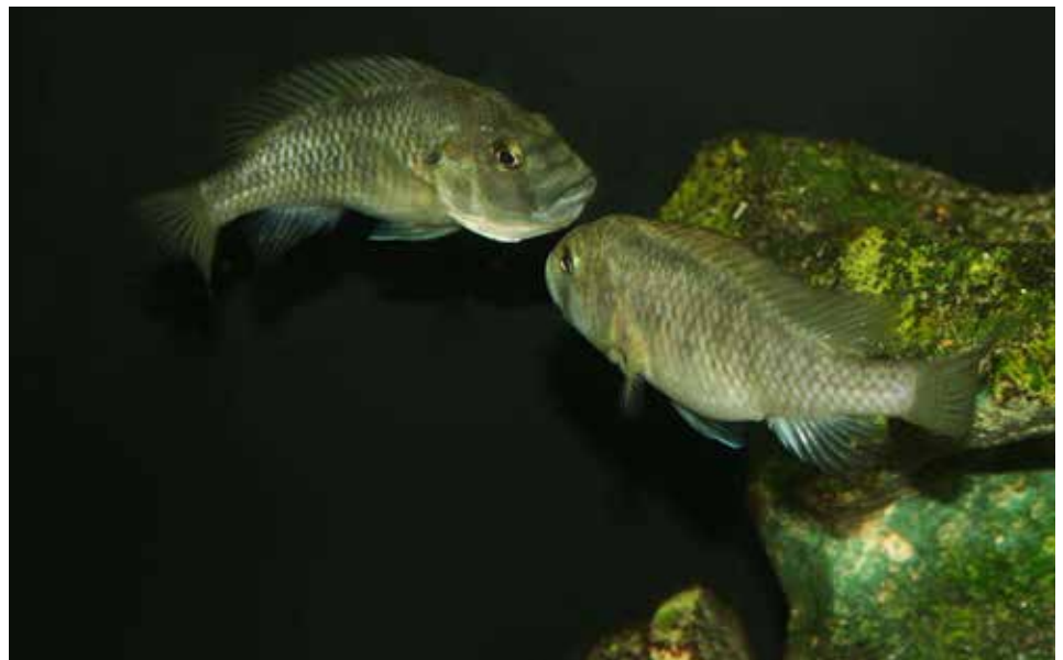
A male Astatotilapia flavijosephi displaying to a female.

As with all haplochromines (with the possible exception of evolving biparental brooding) A. flavijosephi is a maternal mouth brooder with the female gestating her developing young for 17 days at 82° F. The courting male excavates a pit at the base of a rock and it is here that the act of spawning occurs. He entices a ripe female with a series of "shimmies" and eventually, the circling spawning procedure takes place. After spawning, the male has nothing else to do with the female and she is on her own. The female will try to find a calm spot