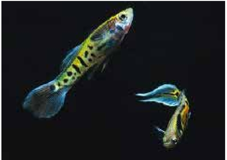
A Tiger Endler which is gaining in popularity with the livebearing community.

with males getting around 1.5 inches long, maybe more. Females get around 2 to 2.5 inches long. You can keep a good sized colony (four males and six females) in a ten gallon. They are a beautiful and active species, so they are always entertaining to see. While they aren't picky when it comes to tank setups, they will look best in a planted setup. However they will be fine in any setup. They aren't too picky when it comes to water flow, as long as it isn't too strong. Be careful when it comes to filtration, since they can be small enough to get sucked up into the intake, depending on the filter. They can, and will jump into hang-on back filter, so be careful when using one. Mine usually jump right out on their own. As I have just said, they are jumpers, so make sure the tank is covered, and be sure to leave no openings! They aren't too picky when it comes to water quality, as long as the water isn't too soft and acidic. They are pretty adaptable overall. They will eat anything given to them, from flakes and dried foods, to live and frozen foods. Even wild caught Endler's (if you can get them), will immediately eat what's given to them. This species isn't picky at all!