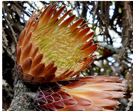
King Dryandra August/ September

The one kilometre Breakaway Walk (Grade 3, 45 minutes) leads to the western side of the mesa, and winds through ironstone pavement around the edge of the breakaway, before a moderately steep descent into a cool shady gully in rock sheoak/wandoo woodland, with abundant winter ferns, rushes, cowslip orchids and everlastings. The track goes past the old dam, follows an old fenceline, and across a rock where you may find Lemon scented sun orchids. The loop then heads back to the picnic site