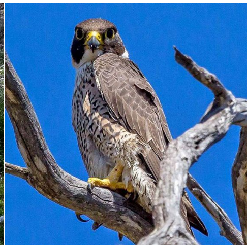
Peregrine falcon