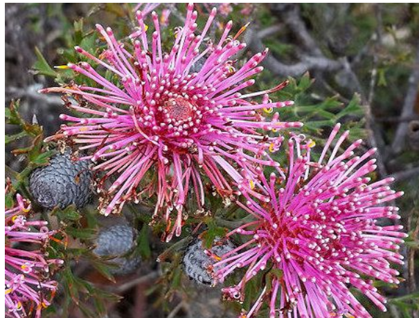
Isopogon crithmifolius September, October

The dense ironstone soil here has similar sparse proteaceae vegetation including the stunning spring-flowering pink Isopogon crithmifolius , and the secretive King Dryandra ( Banksia proteoides ) that hides flowers inside the bush. Keep your eyes and ears open for bird life. There is also a geocache hidden around here!