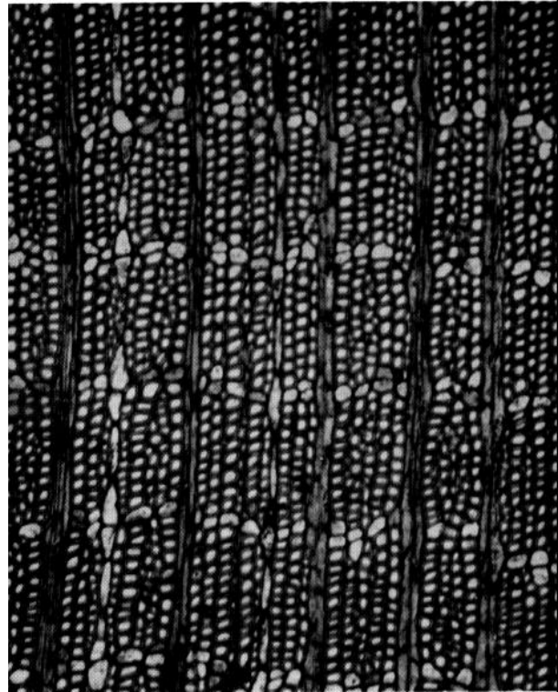
Figure 2.--Same as figure 1, showing parenchyma detail X 110 (N. T. Silva 4752).