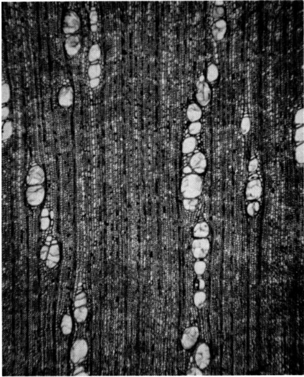
Figure 1.- Englerella speciosa , topography of transverse section X 30 (Museu Goeldi tree No. 727).