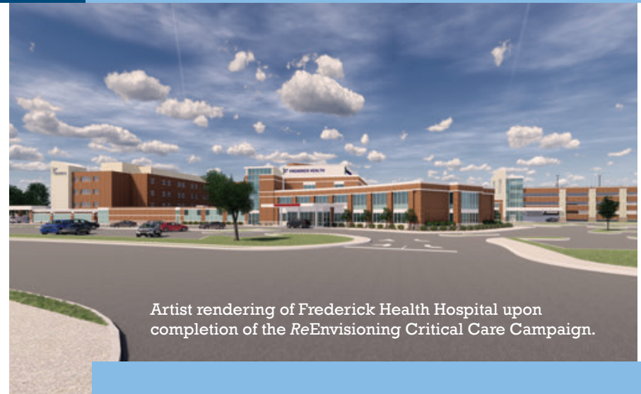
Artist rendering of Frederick Health Hospital upon completion of the ReEnvisioning Critical Care Campaign .

All three components of the project share a common goal: to make the environment at Frederick Health Hospital even more comfortable, convenient, and patient-centered for you and your loved ones. Most importantly, these enhancements will ensure that when you or a loved one is experiencing a medical emergency, the critical care services you need are available right here, close to home.