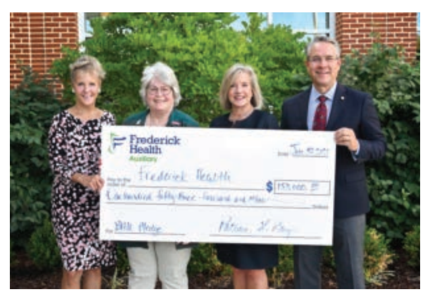
Frederick Health Auxiliary presents a check for $153,000 to support Frederick Health's Behavioral Health Unit.

Thanks to the support of Volunteer Services staff members, the hospital Gift Shop was able to operate with limited hours during the pandemic and is now back to normal operations. In addition, the Auxiliary's Select Seconds Thrift Shop in Downtown Frederick has fully reopened and may soon be expanding its hours. Despite a challenging fundraising environment, proceeds from the Gift Shop, Select Seconds, and other operations enabled the Auxiliary to honor its financial commitment to Frederick Health in support of the recent renovation of the Behavioral Health Unit.