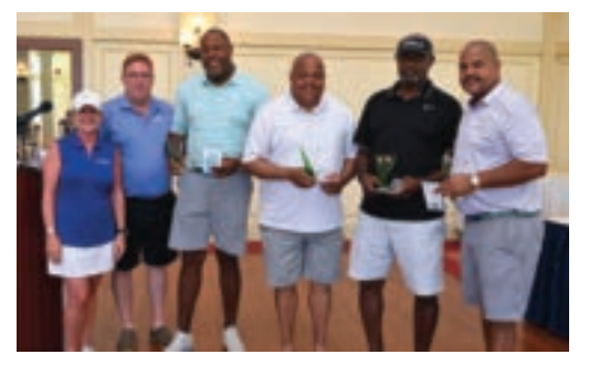
Congratulations to this year's tournament winners, Lee Building Maintenance!