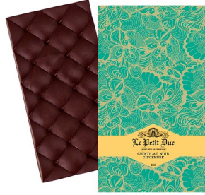
Dark chocolate bar w/ ginger, bio · 70g (2.5 oz) · Pack 10 · DUBAGI