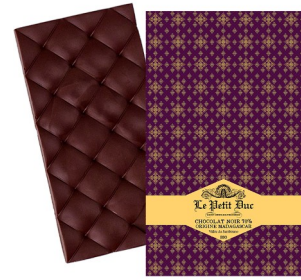
Dark chocolate bar 70%, bio, Madagascar Sambirano · 70g (2.5 oz) Pack 10 · DUBAMA