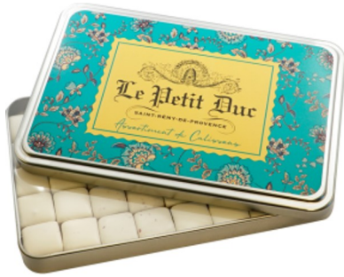
Calissons, assorted (Saint-Rémy, pistachio, extra orange, & rose of Damas), tin · 200g (7 oz) · Pack 10 · DUCAAST