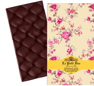
Dark choc bar w/ almonds & hazelnuts, bio · 70g (2.5 oz) · Pack 10 · DUBAAL