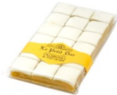
Calissons, pistachio, tablet · 100g (3.5 oz) · Pack 10 · DUCAPI