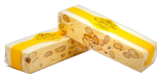
Nougat, Cévennes · 100g (3.5 oz) · Pack 12 · DUNOCE