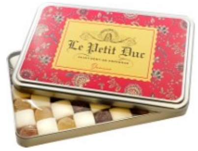
Checkerboard of calissons & pâtes de fruits, tin · 255g · Pack 10 · DUCAPAT2