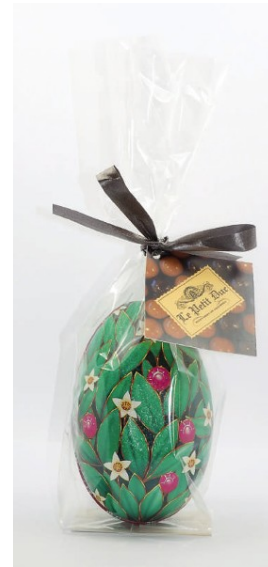
Box of 24 Fabergé eggs filled w/ crispy chocolate balls, 2 x 12 designs · 24 x 100g (3.6 oz) · DUFA