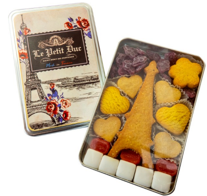
“Made in France” tin · 265g (9.275 oz) · Pack 10 · DUBIFRT