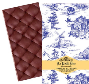
Milk choc bar 48%, bio, Ecuador Esmerelda · 70g (2.5 oz) · Pack 10 DUBAEQ