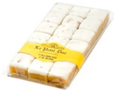
Calissons, rose de Damas, tablet · 100g (3.5 oz) · Pack 10 · DUCARO