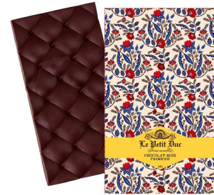
Dark chocolate bar w/ raspberry, bio · 70g (2.5 oz) · Pack 10 · DUBARA