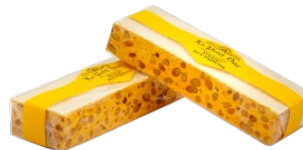
Nougat, pistachios · 100g (3.5 oz) · Pack 12 · DUNOPI