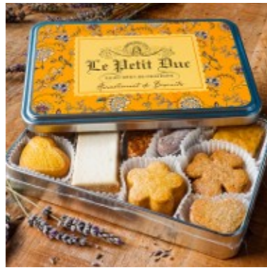
Assorted biscuits, tin · 210g (7.35 oz) · Pack 10 · DUBIAST