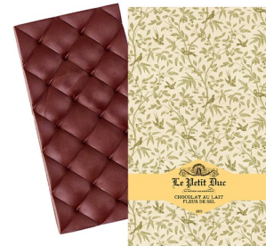
Milk chocolate bar w/ fleur de sel, bio · 70g (2.5 oz) · Pack 10 · DUBIFL