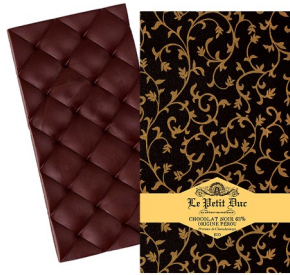
Dark chocolate bar 63%, bio, Peru Chanchamayo · 70g (2.5 oz) · Pack 10 · DUBAPE