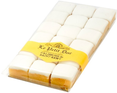
Calissons from Saint-Rémy, tablet · 100g (3.5 oz) · Pack 10 · DUCA

A true finder of forgotten recipes, the Petit Duc in Saint-Rémy de Provence has breathed new life into many specialties while developing its own original creations. Le Petit Duc relies on traditional methods to produce its famous square calissons, illustrious cookies, exceptional nougats and single-origin chocolates.