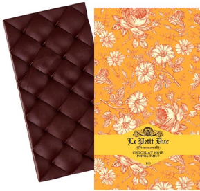
Dark chocolate bar w/ Timut pepper, bio · 70g (2.5 oz) · Pack 10 · DUBATI