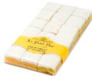
Calissons, assorted (Saint-Rémy, pistachio, extra orange, & rose of Damas), tablet · 100g (3.5 oz) · Pack 10 · DUCAAS