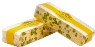
Nougat, Saint-Rémy · 100g (3.5 oz) · Pack 12 · DUNO