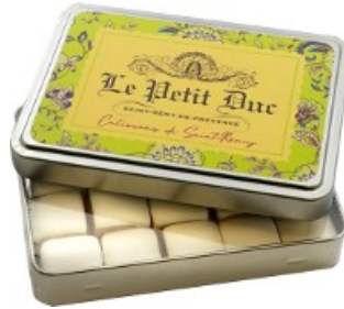
Calissons from Saint-Rémy, tin · 115g (4 oz) · Pack 10 · DUCAT1