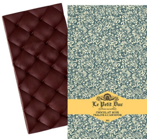
Dark chocolate bar w/ hazelnut praline, bio · 70g (2.5 oz) · Pack 10 · DUBAPR