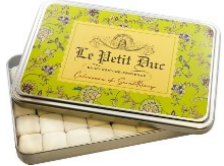
Calissons from Saint-Rémy, tin · 230g (8 oz) · Pack 10 · DUCAT2