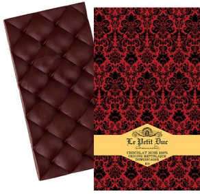
Dark chocolate bar 100%, bio, Dominican Republic · 70g (2.5 oz) · Pack 10 · DUBADR