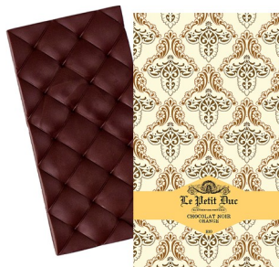
Dark chocolate bar w/ orange, bio · 70g (2.5 oz) · Pack 10 · DUBAOR