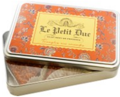
Triangles w/ almonds, tin · 200g (7 oz) · Pack 10 · DUBITIT