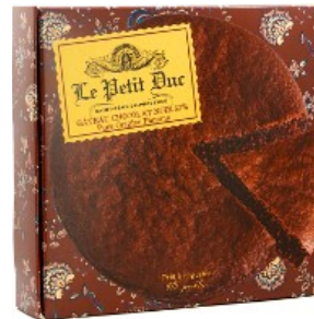
Chocolate cake, gluten-free (chocolate 65% pure origin Panama) · 225g (7.9 oz) · Pack 10 DUGACO