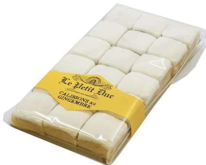
Calissons, ginger, tablet · 100g (3.5 oz) · Pack 10 · DUCAGI