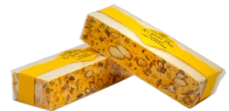
Nougat, pine nuts · 100g (3.5 oz) · Pack 12 · DUNOPIN