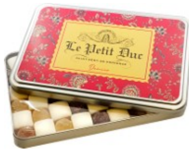
Checkerboard of calissons & pâtes de fruits, tin · 110g · Pack 10 · DUCAPAT1