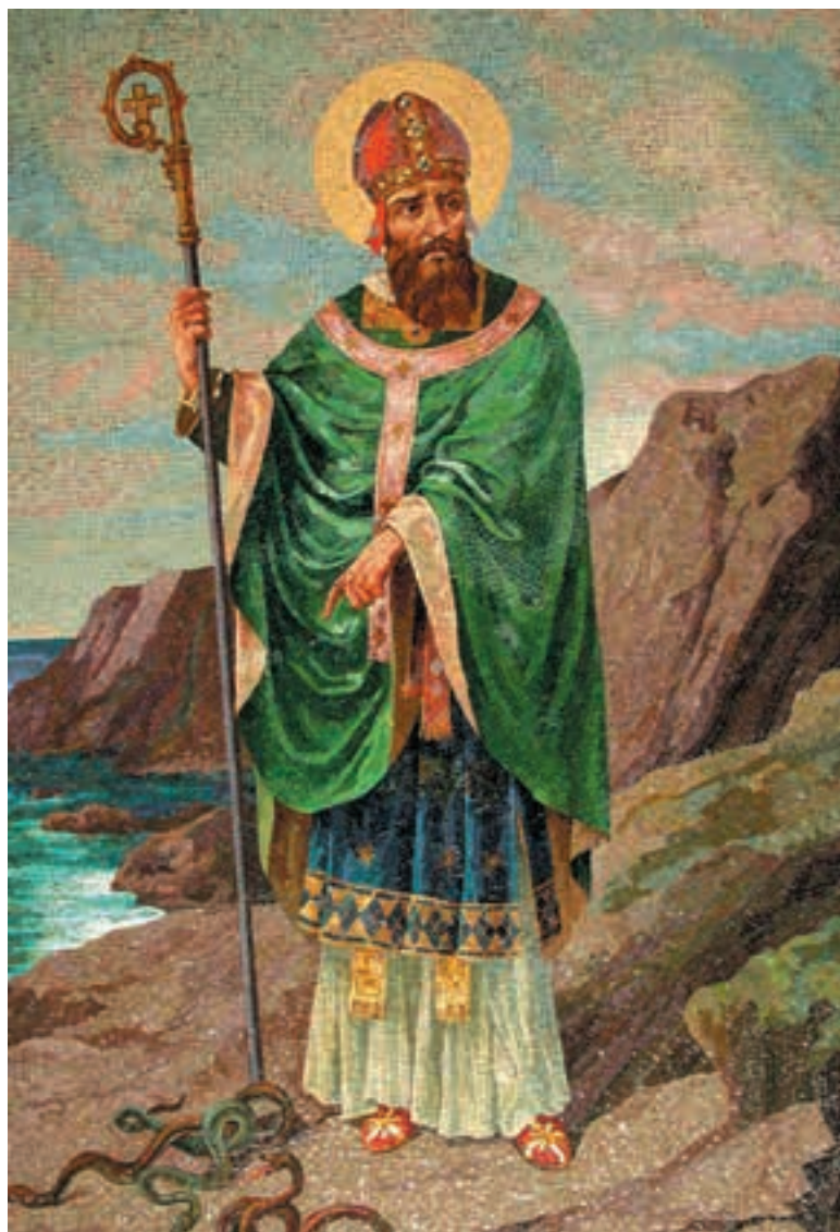
MOSAIC OF ST. PATRICK ATHENAEUM OF OHIO ~ CINCINNATI