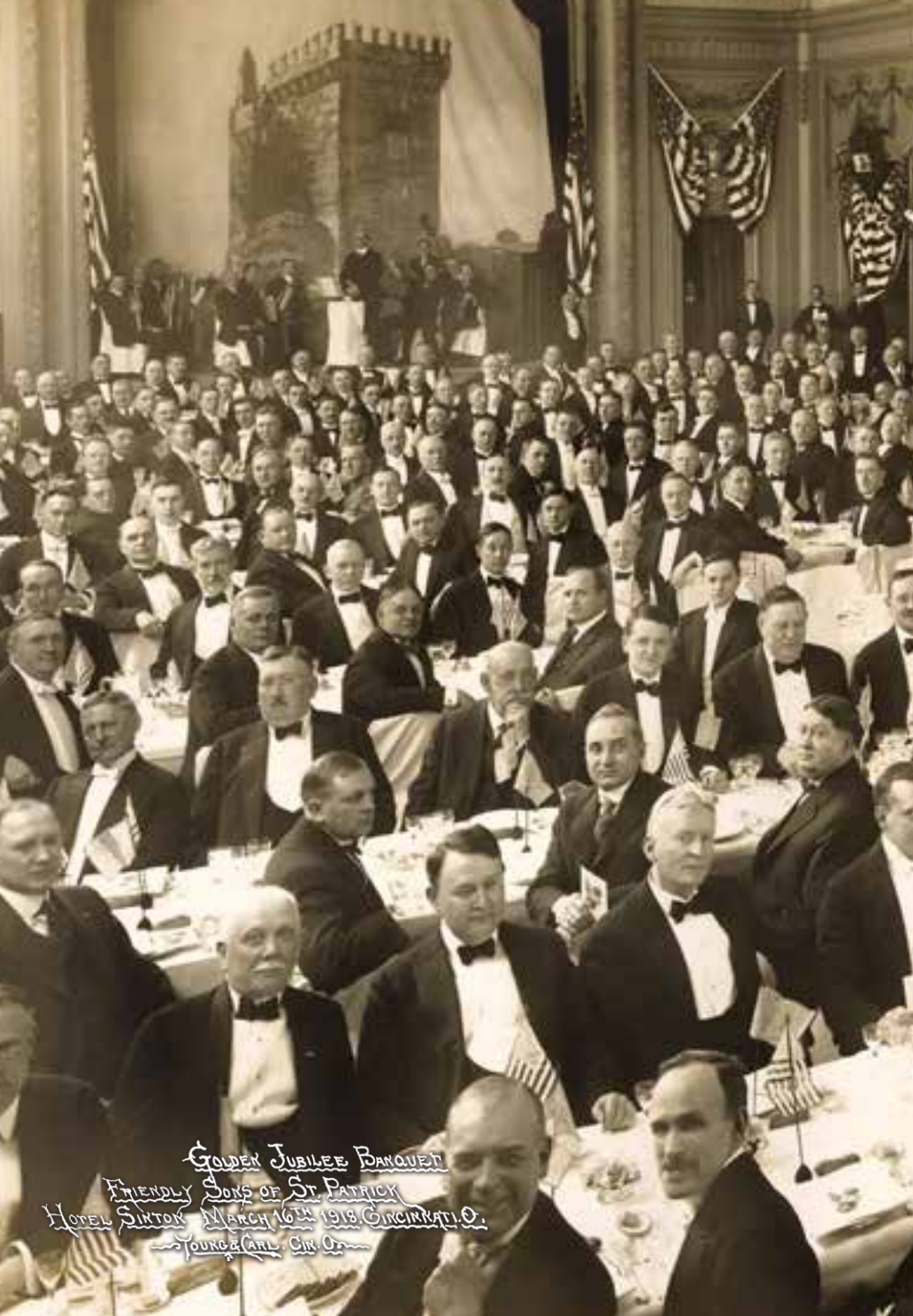
GOLDEN JUBILEE BANQUET FRIENDLY SONS OF ST. PATRICK HOTEL SEXTON MARCH 16 TH 1918 CINCINNATI, O. YOUNG & CO. INC. O.