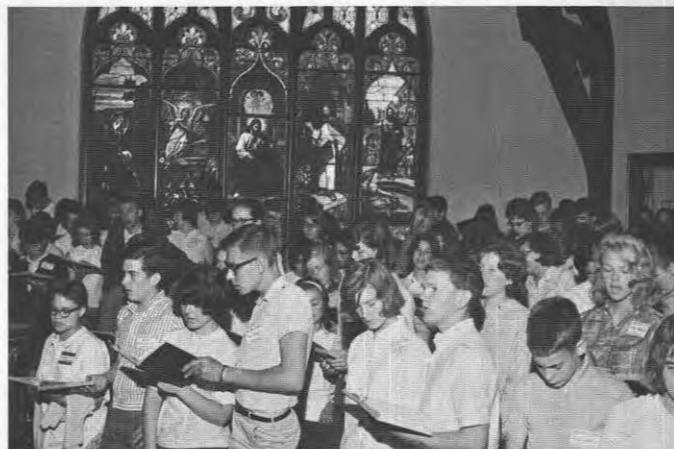
High-school-age Friends singing during their morning program, held at First Presbyterian Church.