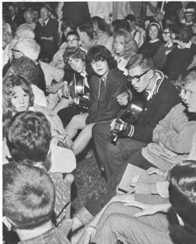
Young Friends holding impromptu folk-sing prior to an evening lecture.

The first Annual Sand Castle Contest was typical of the refreshingly imaginative recreational activity of the