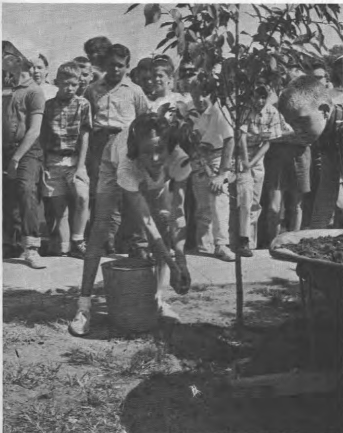
Junior Conference members planting Japanese cherry tree in park at Cape May.

delphia Yearly Meeting, was coordinator of this group.