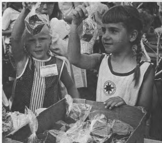
Children selling handmade gifts in support of AFSC tree-planting program in Algeria.