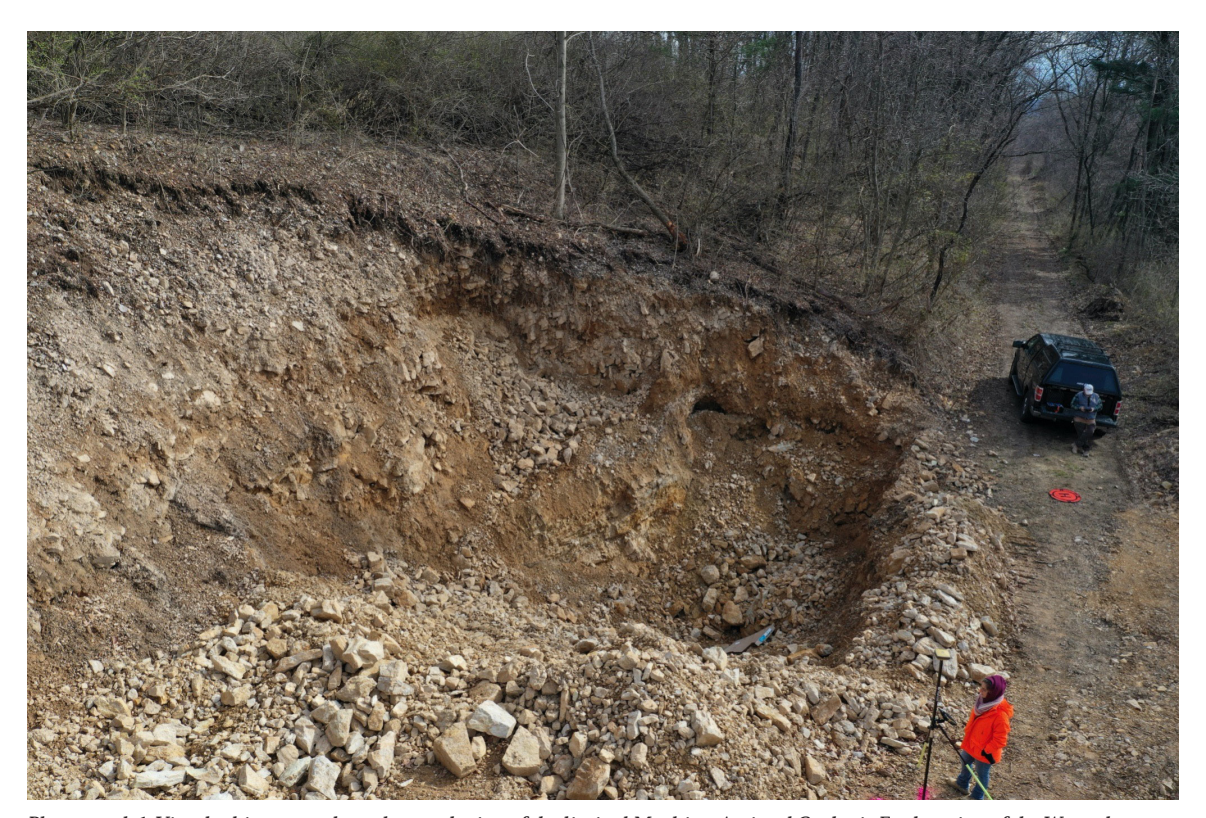
Photograph 1: View looking easterly at the conclusion of the limited Machine-Assisted Geologic Exploration of the Westerly (Upper) Wavellite Adit/Pit. Previously existing spoils were used to build up and berm the road. New spoils that do contain specimens of wavellite overlooked during the exploration. The active workings extend below the cardboard box easterly into the wall. The westerly side of the pit contains no wavellite. Wavellite extends from the lower left (westerly, exposed) shoulder of the excavation to 3 feet off the southerly wall (road), down about 16 feet, and easterly toward the easterly pit.