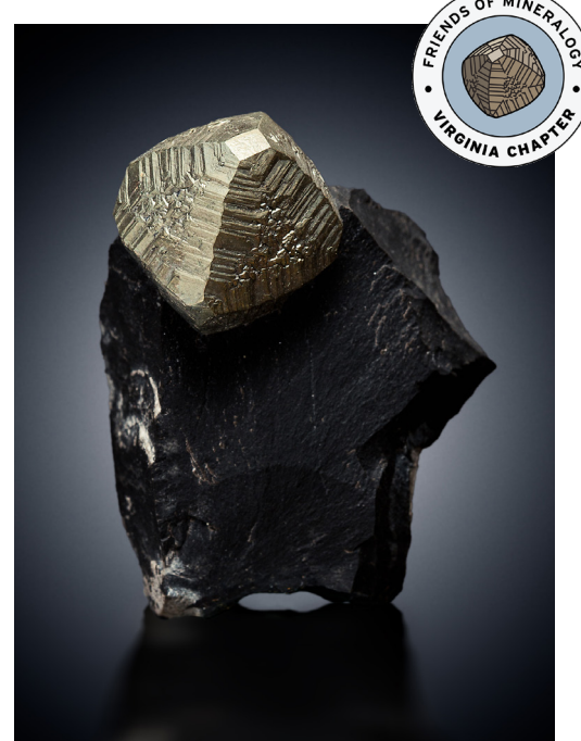
Pyrite on limestone matrix • Bargers Quarry, Rockbridge Co., Virginia, USA • 2.5 cm crystal • August Dietz collection, ex. Buck Keller