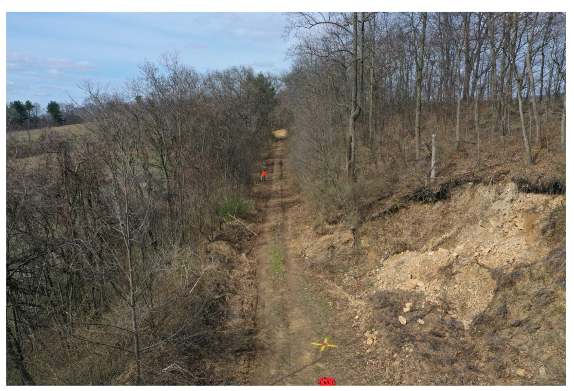
Photograph 4: View looking westerly from the easterly (Lower) Wavellite Adit up the road toward the westerly pit.