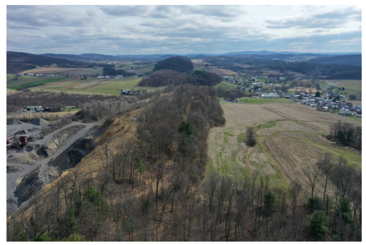
Photograph\ 3: View\ looking\ easterly\ along\ Lime\ Ridge\ showing\ the\ color\ change\ between\ the\ ridge-forming\ Old\ Port\ Formation\ (tan)\ and\ the\ Keyser\ \&\ Tonoloway\ Formations\ (gray)\ currently\ being\ mined.