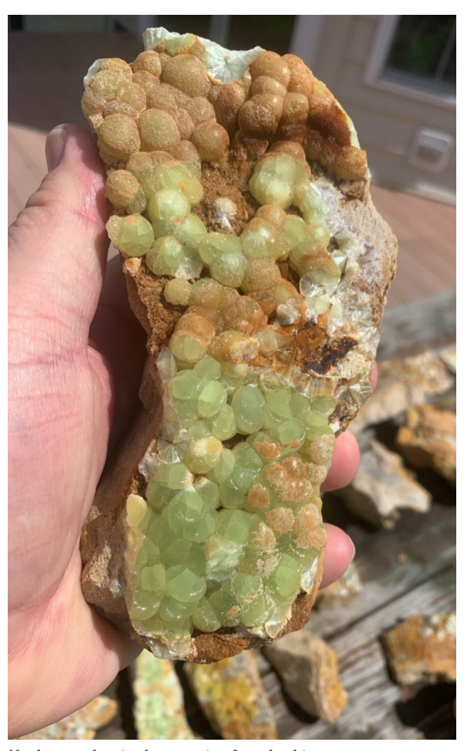
Needs some cleaning but greening. Love the shimmer.

Wavellite and associated species identified at the site including planerite are phosphates, largely of mineralogical interest, though non-specimen grade wavellite had been mined around the turn of the 20th century at another site in PA for matches. It blew up and that was that (Stefanic, Michael, Master's Thesis). The type and classic locality for specimen quality wavellite in the US is in Arkansas, and pretty much any mineralogy/mineral book you pick up that has