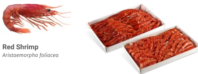
Red Shrimp Aristaemorpha foliacea