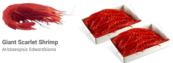
Giant Scarlet Shrimp Aristaeopsis Edwardsiana