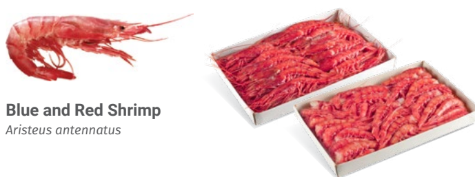
Blue and Red Shrimp Aristeus antennatus