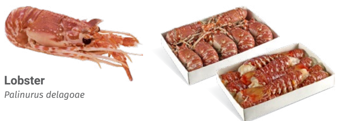
Lobster Palinurus delagoae