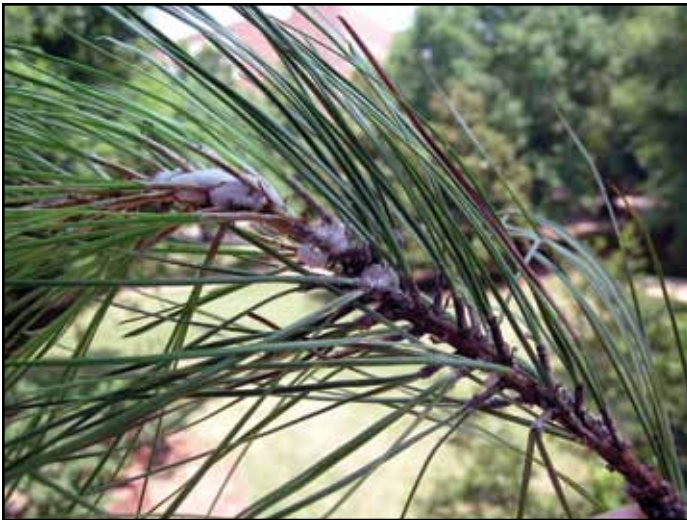
Figure 1. First generation females on a pine shoot.

instar males crawl directly down the shoot and settle near the base of the previous year's needles. Woolly pine scale infestations are easily recognizable during the second generation, as the males on the old needles secrete copious amounts of woolly wax (Figure 4), giving the tree a flocculent