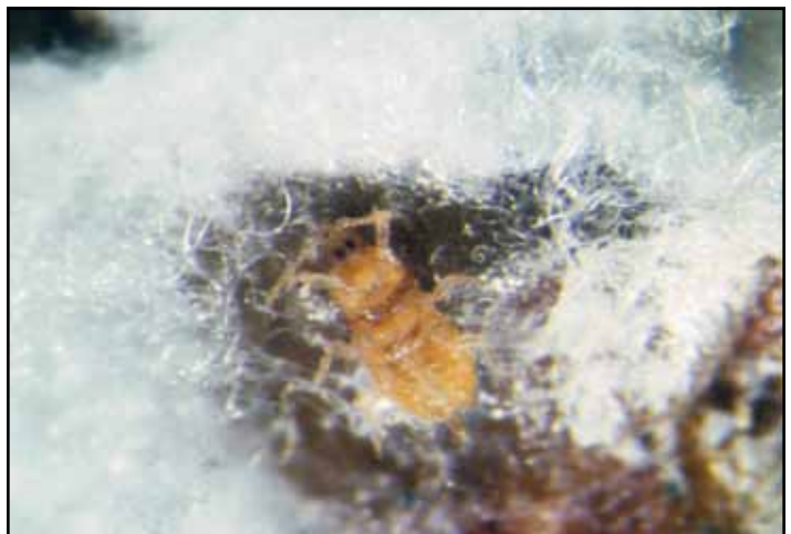
Figure 3. Wingless, first generation male.

The woolly pine scale shares natural enemies with other soft scales of