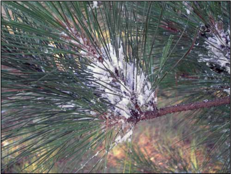
Figure 4. Second generation males on older needles beneath first generation females on new growth.

southern pines, including the striped pine scale and the pine tortoise scale. Predators of the woolly pine scale include green lacewings, Chrysopa spp., and a pyralid larva, Laetilia coccidivora (Comstock). The identified parasitoids are an aphelinid, Coccophagus lycimnia Walker, and an encyrtid, Metaphycus sp.