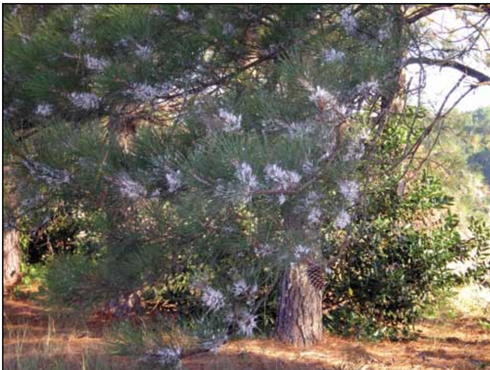
Figure 5. Pine infested by woolly pine scale.

Woolly pine scale outbreaks often appear as delayed problems, occurring one or two years after the initiation of insecticide treatments. This apparent delay may be due to the fact that there are only two generations per year, therefore population numbers take time to increase. Other secondary pests in southern pines may have 4-5