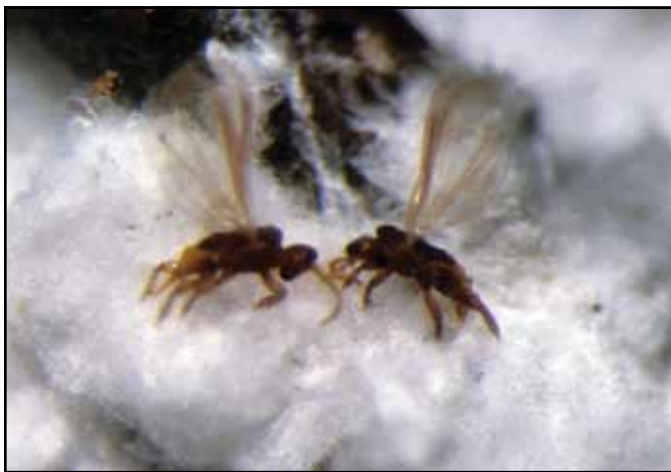
Figure 6 Second generation males.

Fertilization, irrigation, and even insecticide application have been shown to increase egg production of scale insects, but their effects on woolly pine scale fecundity are unknown. Climatic conditions that