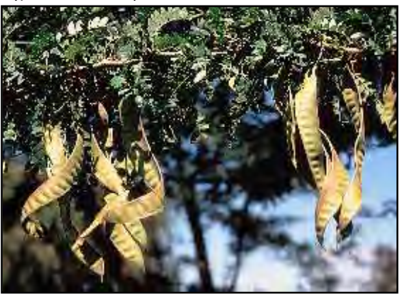
Figure 31. Caesalpiniaceae.

Honey locust, Gleditsia triacanthos-Perkins (homestead site). Introduced. Rare, plantings. Tree.