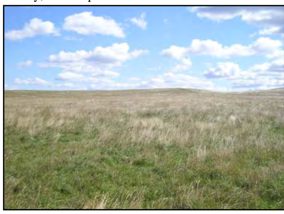
Figure 5. Cedar River National Grassland, Sioux County, ND. September 2007.

Figure 6. Corson County portion of the Grand River National Grassland. September 2007.