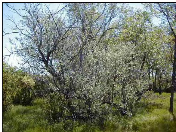
Figure 37. Elaeagnaceae.

important for food and cover for birds and other wildlife.