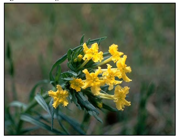
Figure 28. Boraginaceae.