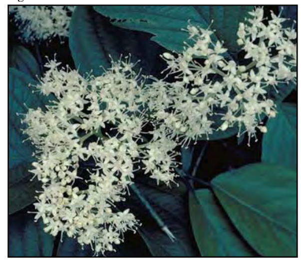
Figure 36. Cornaceae.

Red osier dogwood is a distinctive shrub with red stems and showy clusters of white flowers. Many species in this family, including red osier dogwood, are used as ornamentals.