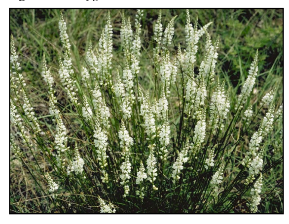
Figure 48. Polygalaceae.