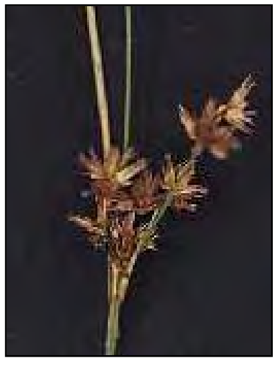
Figure 41. Juncaceae.