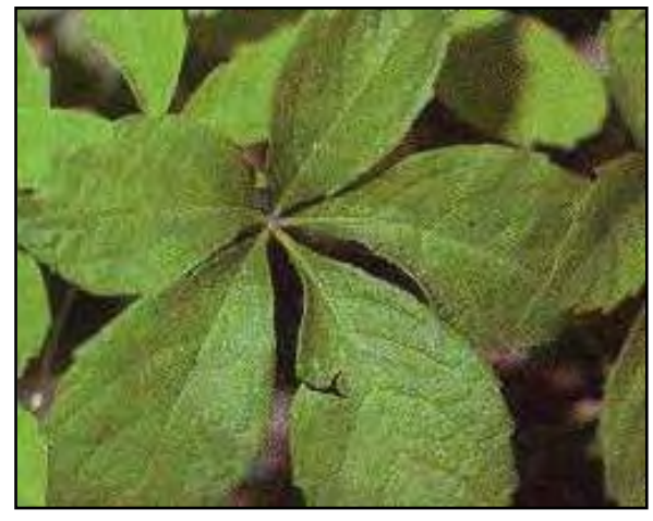
Figure 57. Vitaceae.