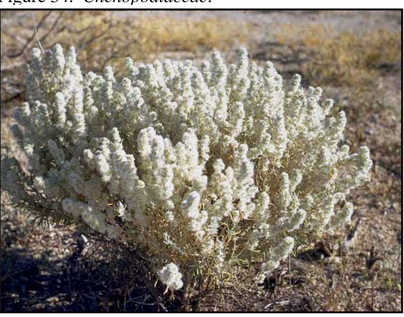
Figure 34. Chenopodiaceae.