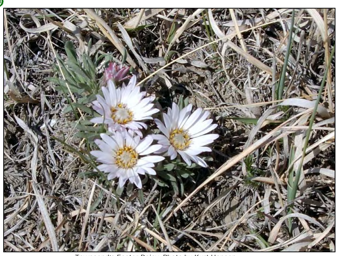
Townsend's Easter Daisy