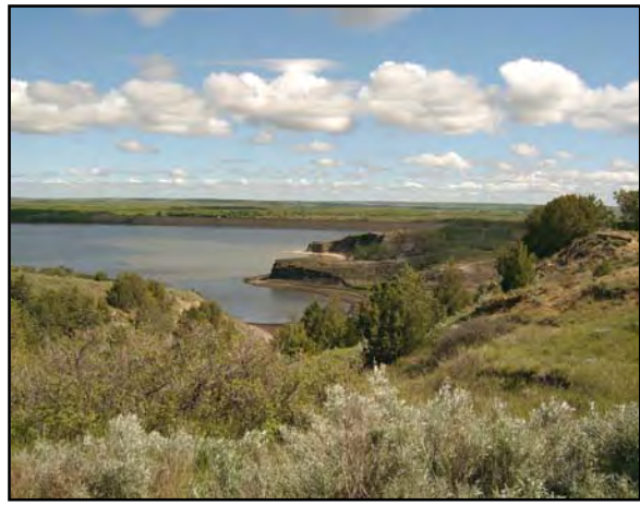
Figure 7. Shadehill Reservoir.

Shadehill Reservoir (Figure 1) lies in the midst of the Grand River National Grassland, approximately 20 miles south of Lemmon, South Dakota. Besides the reservoir itself (Figure 7), this area has a variety of habitats including mixed-grass prairie, badlands, woody draws, saline seeps, claypans, and prairie dog towns. The Blacktail Trail (Figure 8) is located here, and provides easy access to a diversity of interesting features. To reach the trailhead, follow South Dakota Highway 73 south from Lemmon for 16 miles, then turn left (east) onto graveled Forest Service Road #5626. After 0.5 mile, turn left (north) onto Forest Service Road #5740. You will reach the Pasture 9 Wildlife Area Day Use Area, and trailhead, in another 0.5 mile.