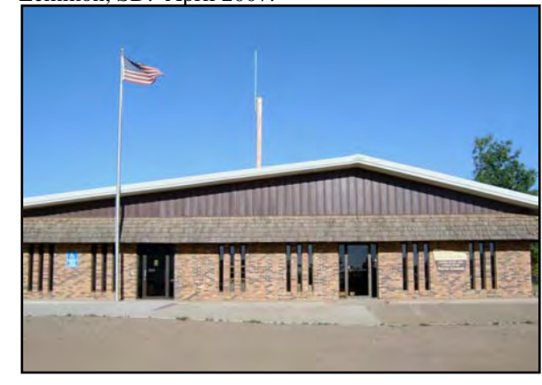
Figure 4. Grand River Ranger District office, Lemmon, SD. April 2007.

If you are visiting in July, August, and September, please check the local fire danger ratings with the National Weather Service office in Rapid City for Fire Zone 261. Check also with the Grand River Ranger District Office as fire restrictions may be in effect, which might affect campfires, vehicle travel, and smoking.