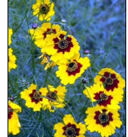
Figure 25. Asteraceae.