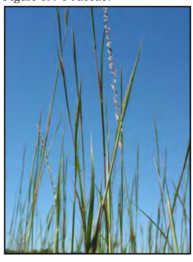
Figure 19. Poaceae.