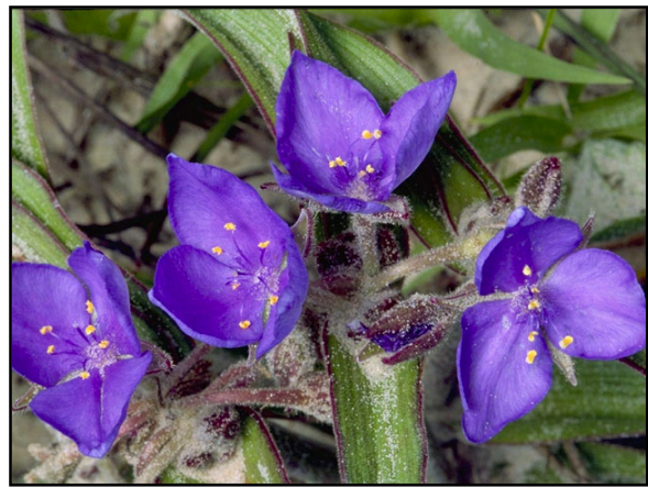
Figure 35. Commelinaceae.

<u>Convolvulaceae</u> - the Morning Glory Family (Jones Jr. and Luchsinger, 1986) The bindweeds are herbaceous weedy, perennials. Some species of morning glory are grown as ornamentals. Field bindweed was introduced from Europe. Sweet potato is