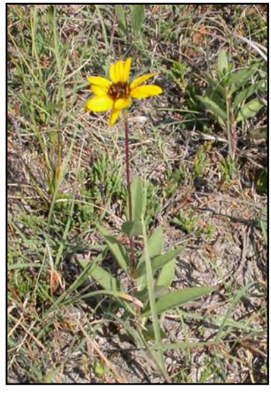
Figure 26. Asteraceae.