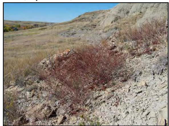
Figure 9. Visher's (a.k.a. "Dakota") buckwheat. Grand River National Grassland, Corson County, South Dakota, September 26, 2005.

previous names. The premise, however, has always been that scientific names change very little over time. An example of where further analysis has changed plant names is with the bulrushes. For our area, the five species of bulrush were all formerly in the genus Scirpus . However, they are now split into Bolboschoenus , Schoenoplectus , and Scirpus .