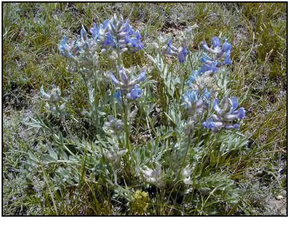
Figure 38. Fabaceae.