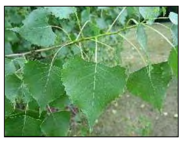
Figure 53. Salicaceae.

thus the family name. Lanceleaf cottonwood is known from only one location east of Shadehill reservoir. Only one parent of this hybrid is present on the Grand River Ranger District and it is not known if it was planted or not. Quaking aspen is known from only two locations on the Grand River Ranger District.