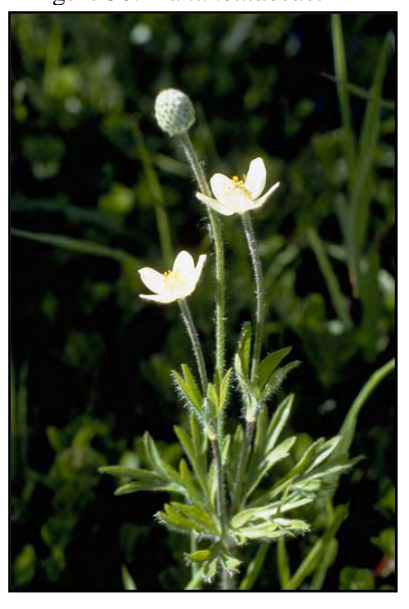
Figure 50. Ranunculaceae.