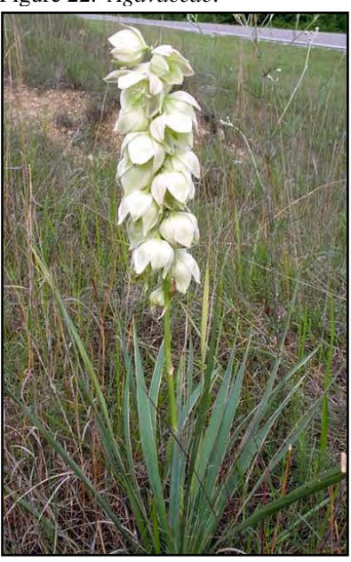
Figure 22. Agavaceae.