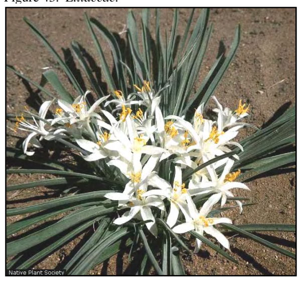
Figure 43. Liliaceae.