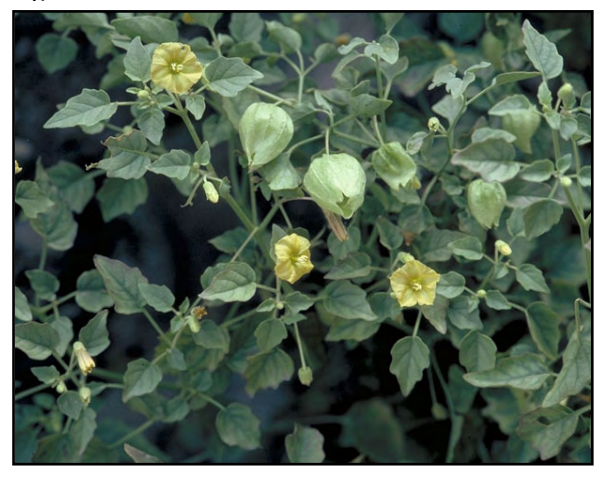
Figure 55. Solanaceae.

This family contains many species that are either edible or poisonous. Buffalo-bur and nightshade are poisonous. The ground cherry is not poisonous. This family contains many species that produce foods and drugs. Tomatoes, peppers, chili peppers, potatoes, tobacco and eggplant are all members of this family. The drug atropine is derived from one member of this family. Matrimony vine is the only shrub in this family found on the grassland. It was found at one homestead site.