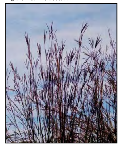
Figure 18. Poaceae.