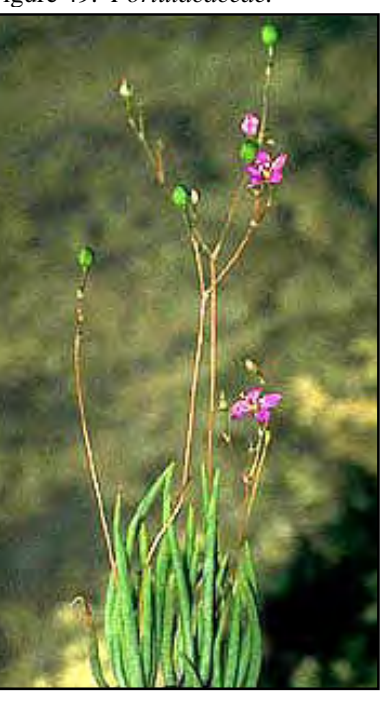
Figure 49. Portulacaceae.

• Western rock jasmine, Androsace occidentalis - Perkins, Corson, Sioux. Common, prairie.