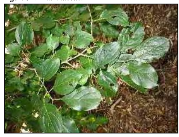
Figure 51. Rhamnaceae.

Common buckthorn, Rhamnus cathartica-Perkins, Corson. Uncommon, draws and drainages. Introduced. Shrub.