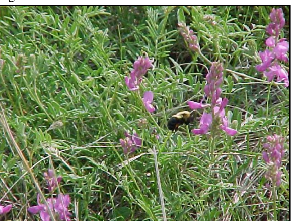
Figure 39. Fabaceae.