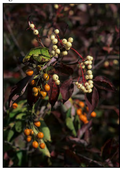
Figure 33. Celastraceae.

American bittersweet, Celastrus scandens- Perkins. Occasional, woody draws and drainages. Vine.