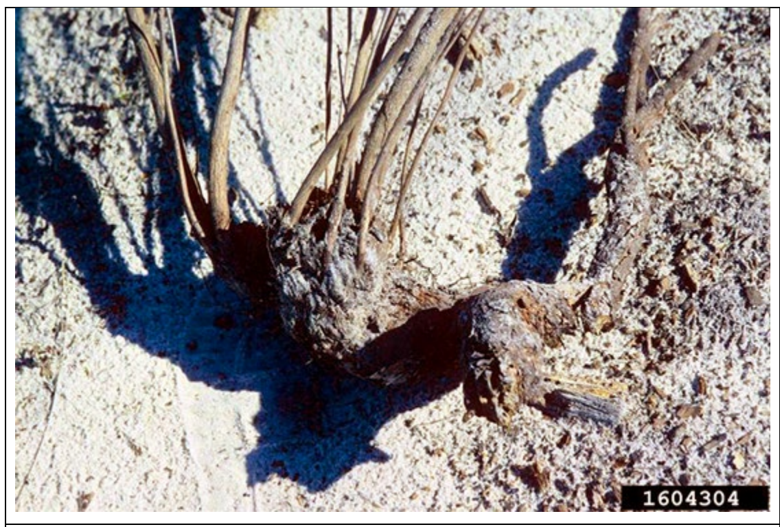
Figure 5—Georgia plume root crowns and roots.