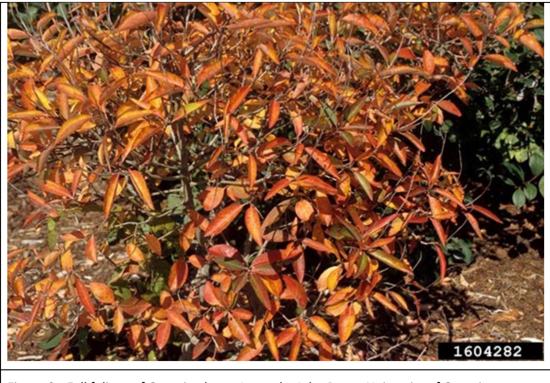
Figure 6—Fall foliage of Georgia plume.