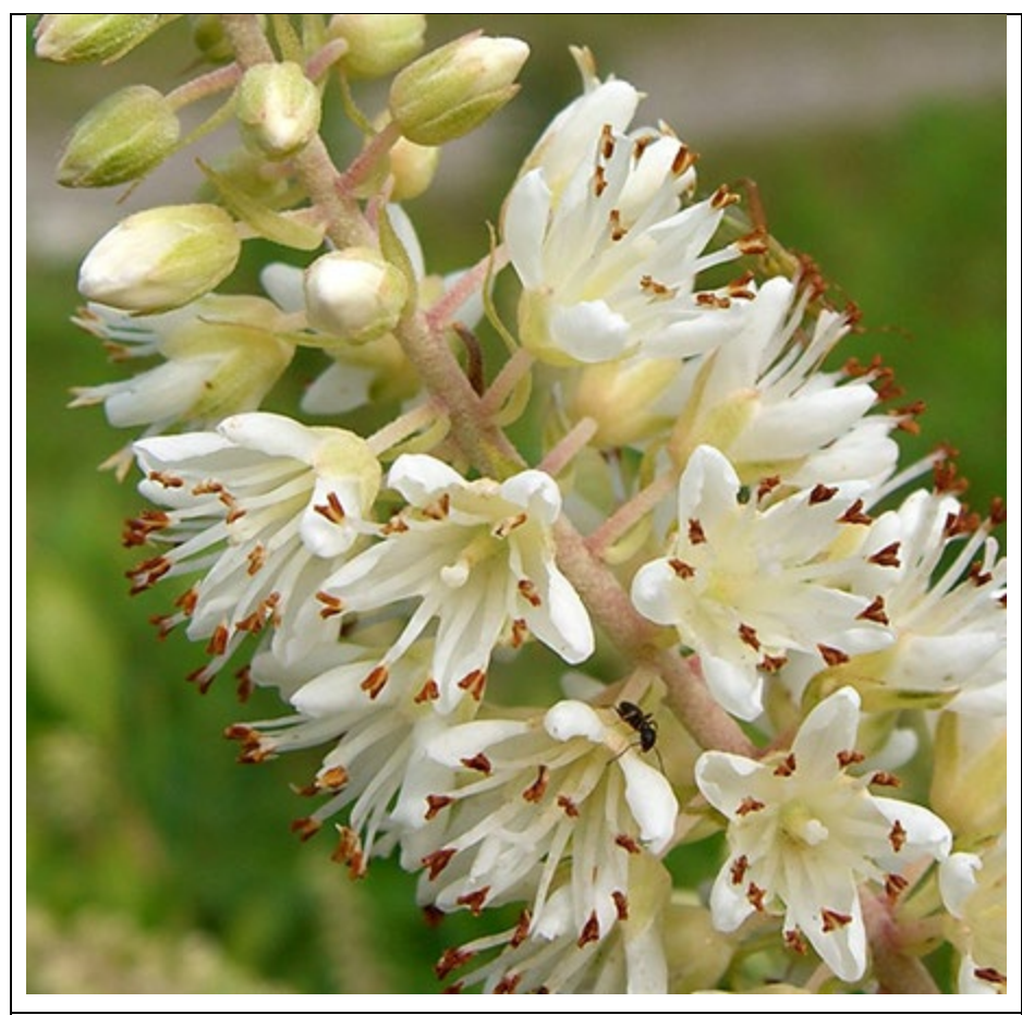
Figure 4—A Georgia plume raceme.