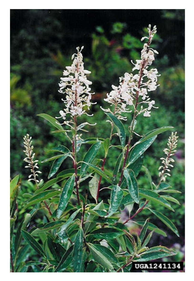
Figure 1—Georgia plume in flower.