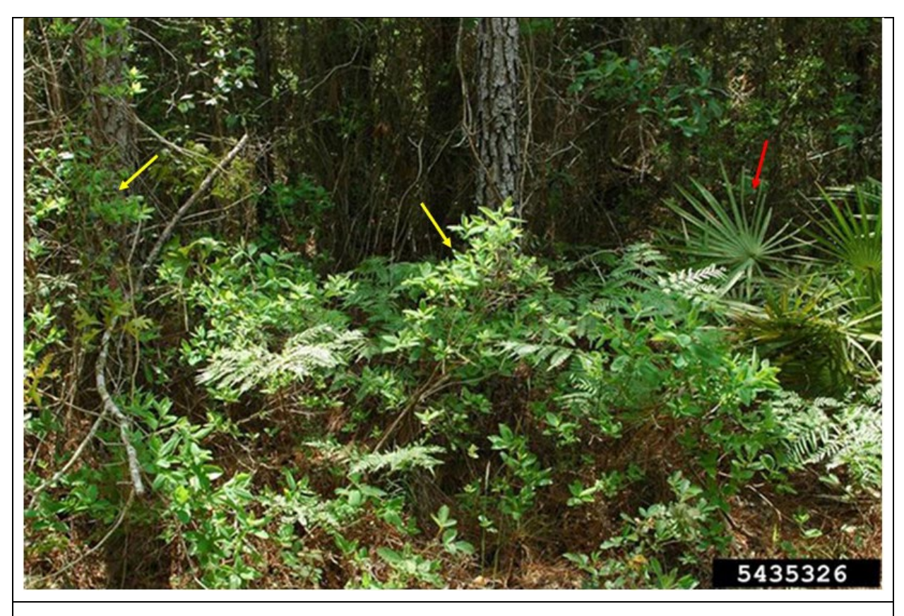
Figure 3—A mixed bottomland coastal plain forest. The yellow arrows point to Georgia plume, the red arrow to cabbage palmetto.