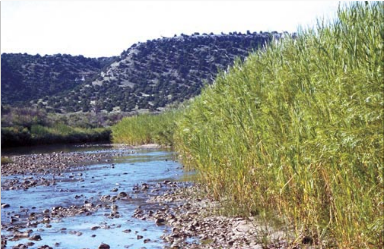
Figure 2 —The Purgatoire River with tall Phragmites australis (carrizo, common reed grass) along the bank. In the 1700s, before trappers, this view of the river would include beaver dams. This canyon was a lush river oasis.

The checklist has three possible entries for each of four designated areas: the number 1, the number 0, or a blank space. The number 1 indicates a plant species that is present in this area of the grassland. To receive the number 1, there must be an herbarium voucher specimen or definitive field identification. The number 0 indicates a plant species that is either present in a nearby region or that is likely to be found in an area. For example, because only parts of Baca and Otero counties are on public land, plant species that occur somewhere in these counties but not seen on the Comanche National Grassland, have the number 0 in their respective columns. In the western Las Animas County column, a 0 usually represents a species reported by Shaw and others (1989) from Piñon Canyon. In the eastern Las Animas