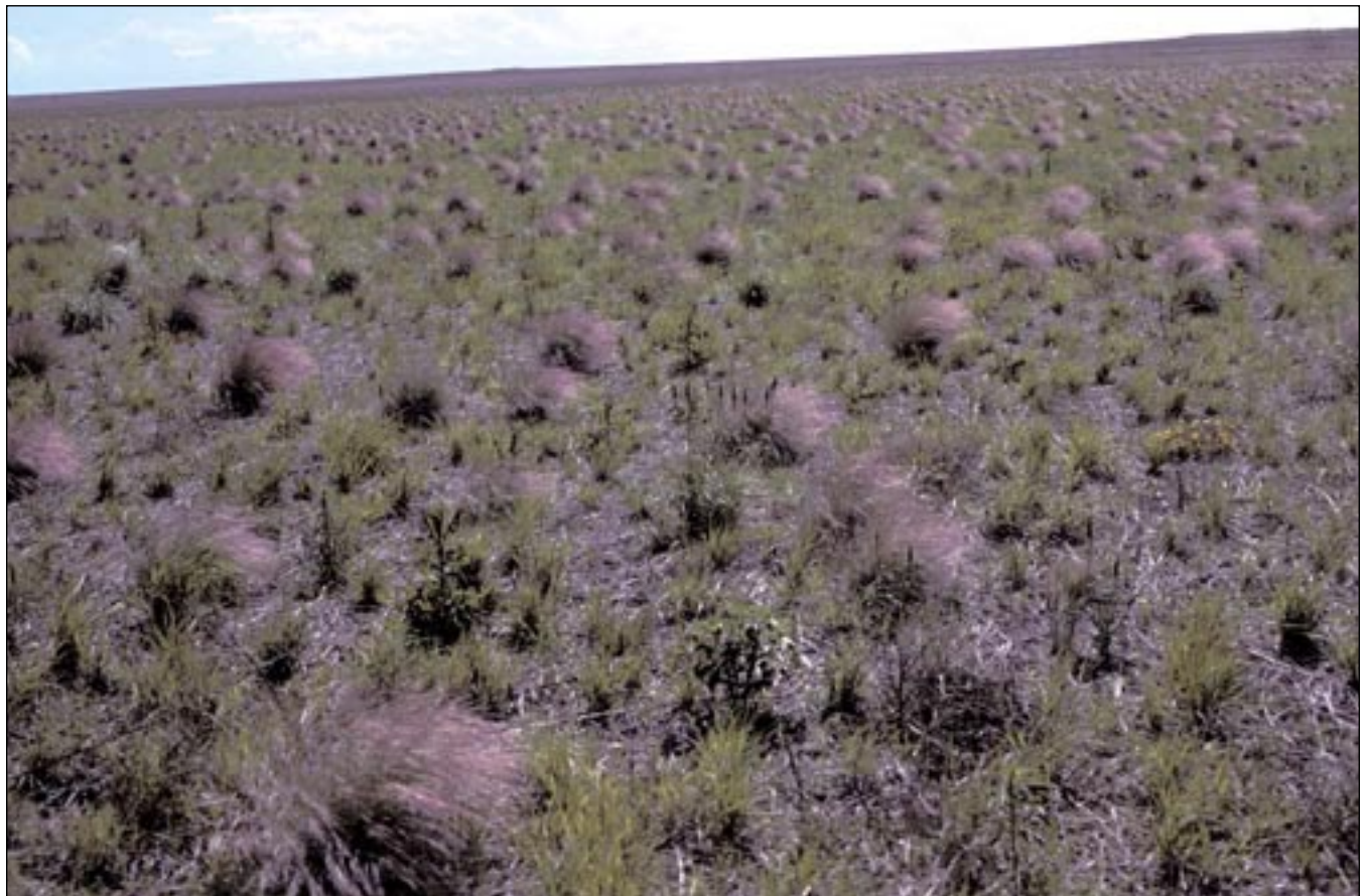
Figure 3 —A shortgrass steppe area near Springfield, CO, that was once plowed. It has regenerated with regular-spaced patches of purple three-awn or no-eatum ( Aristida longiseta ), western salsify ( Tragopogon dubius ), and sand dropseed ( Sporobolus cryptanthus ).

The eight Comanche National Grassland habitat categories were selected because it was clear that many species occur only in one of these habitats. These habitats are based on major soil types, land-use, and topography: they are independent of species-based habitats. These habitat categories are established to provide an initial understanding of the locations where Comanche National Grassland plant species can be found. The difficulty of assigning plant species to only one category is reflected in the occasional use of two categories per species. In such cases, the first habitat listed is the primary habitat. Whenever a species occurs in all habitat types, one is selected as the “primary” habitat. For example, blue grama is present to some extent in all habitat types,