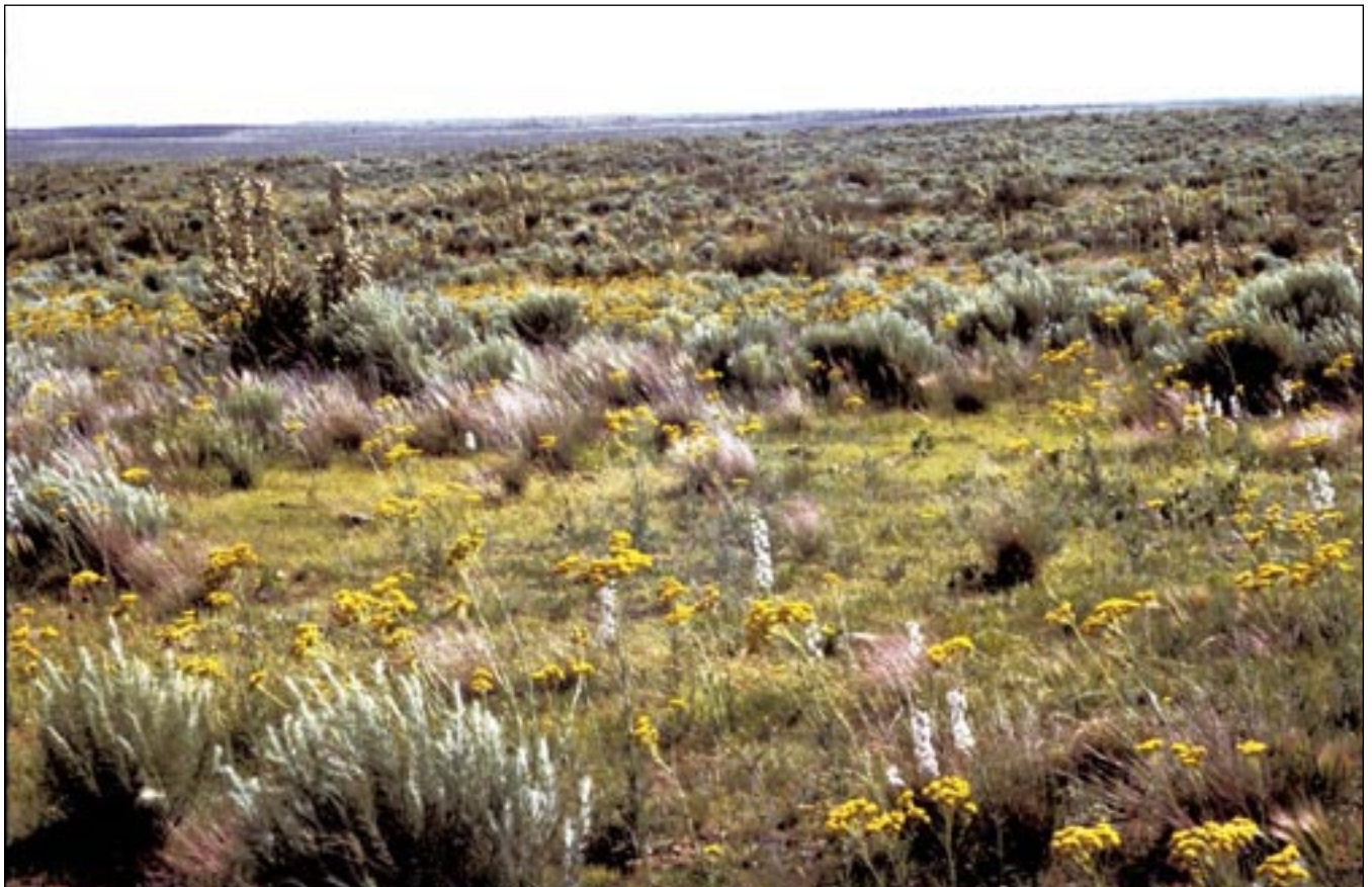
Figure 5 —A sandy pasture with soapweed ( Yucca glauca ), sand sagebrush ( Artemisia filifolia ), and purple three-awn grass ( Aristida purpurea ). The common yellow flowers are yellow wooly-whites ( Hymenopappus flavescens ) and the occasional white racemes are plains larkspurs ( Delphinium virescens ).

Disturbed Soil (D). These are disturbed areas by roads, pens, buildings, loading chutes, etc. The crowned county roads allow more water to accumulate in roadside ditches and create a mesic habitat for plants. Among the abundant roadside exotic plants are Bromus inermis (smooth brome), Bromus tectorum (cheatgrass), Tribulus terrestris (tackbur), yellow sweet clover ( Melilotus officinale ), Virginia ground