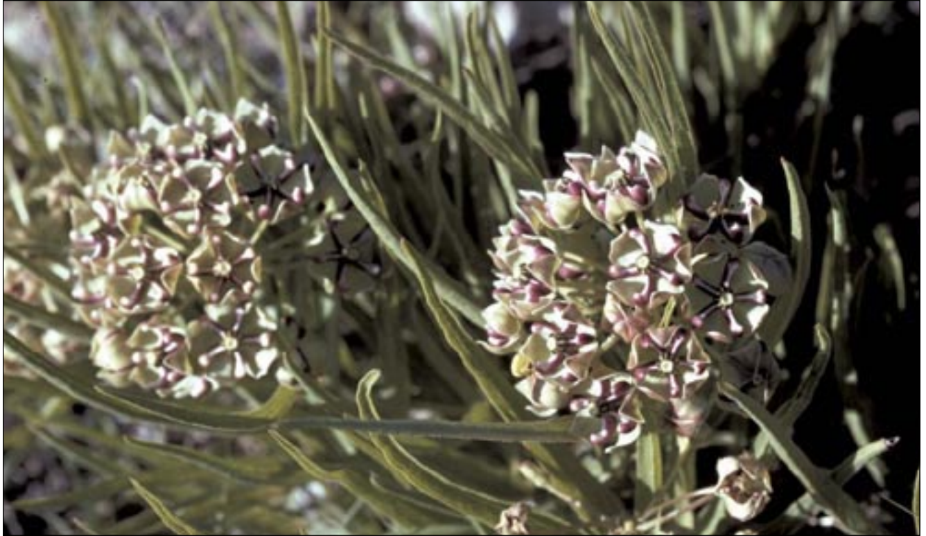
Figure 6 — Asclepias asperula (antelope horns) has the common name “ inmortal ” in Spanish. The powdered root of this milkweed is used in Hispanic medicine as a remedy for a variety of pains and as a cardiac stimulant. Naturally occurring populations of this species may be over-collected for these uses.

a plant with the recycled European common name of scarlet globemallow. A noteworthy feature of S. coccinea is its showy, orange flowers. This unusual flower color for a Great Plains plant did not go unnoticed when someone (a cowpoke?) renamed this plant “cowboy’s delight.” This delightful folk name helps balance the fright incurred by an encounter with Tidestromia laguginosa (cowboy’s fright). The diversity of folk names for Sphaeralcea coccinea does not end here. This same plant is yerba de la negrita (herb of the lady with a dark complexion). This is one of the oldest known Spanish names for any native Colorado plant. In New Mexico a bottled yerba de la negrita shampoo is commercially available.