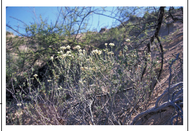
FIGURE 3. Eriogonum terrenatum at type locality near Fairbank, Cochise County, Arizona.