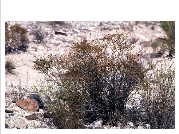
FIGURE 2. Eriogonum apachense type locality near Bylas, Graham County, Arizona.