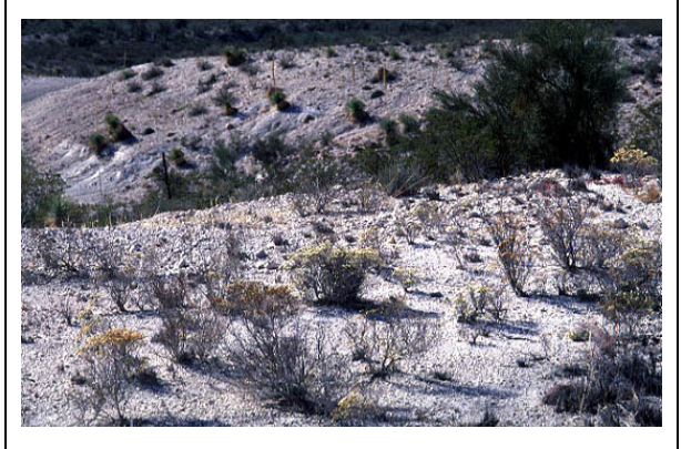
FIGURE 4. Eriogonum apachense on late Tertiary lacustrine habitat in the San Carlos Basin.