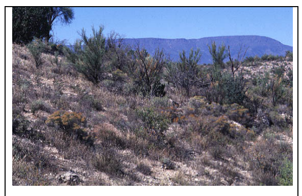
FIGURE 6. Eriogonum heermannii var. argense habitat on Verde Formation in White Hills, Verde Valley, Yavapai County, Arizona.