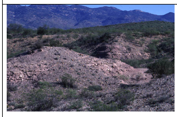
FIGURE 7. Eriogonum terrenatum habitat on Pantano Formation near Vail, Pima County, Arizona.