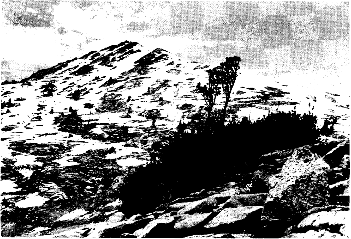
Figure 5 —Krummholz whitebark pine at 10,600-ft (3,230-m) Granite Pass, Sequoia-Kings Canyon National Park in the California Sierra Nevada. The krummholz 'cushion' is protected by winter snowpack; the wind-battered upper branches are called 'flags.'

Whitebark pine cannot become a climax forest dominant in moist, wind-sheltered sites where its tolerant associates are capable of forming a closed stand. But it can become a long-lived seral dominant on these sites as a result of stand replacement by fire, snow avalanche, and other major disturbances .