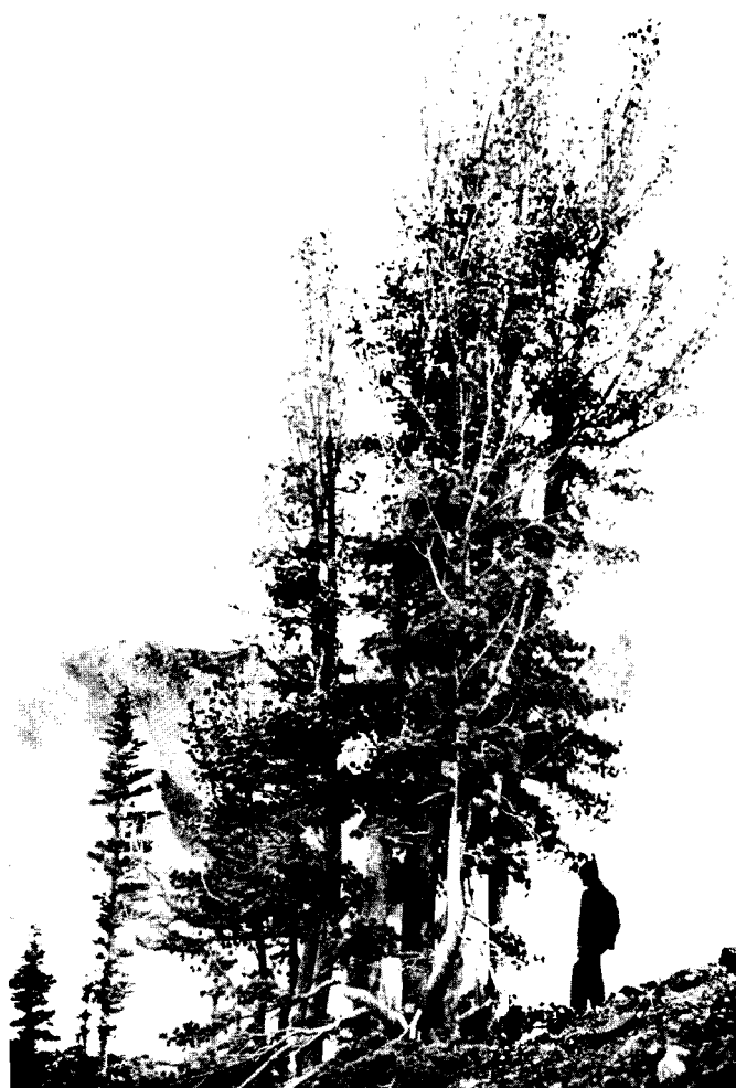
Figure 4 —Multistemmed growth form of whitebark pine at tree line in the northeastern part of the Olympic Mountains, WA.

more. The oldest individuals in some cold, dry sites probably attain 1,000 years. The ancient trees often have a broad crown composed of large ascending branch-trunks (fig. 3). The largest recorded whitebark pine , growing in central Idaho's Sawtooth Range, is 105 inches (267 cm) in d.b.h. and 69 ft (21 m) tall (AFA 1986). Upwards through the timberline zone, whitebark pine becomes progressively shorter and assumes multistemmed growth forms (fig. 4) evidently arising from the germination of nut-cracker seed caches (Furnier and others 1987; Linhart and Tomback 1985).