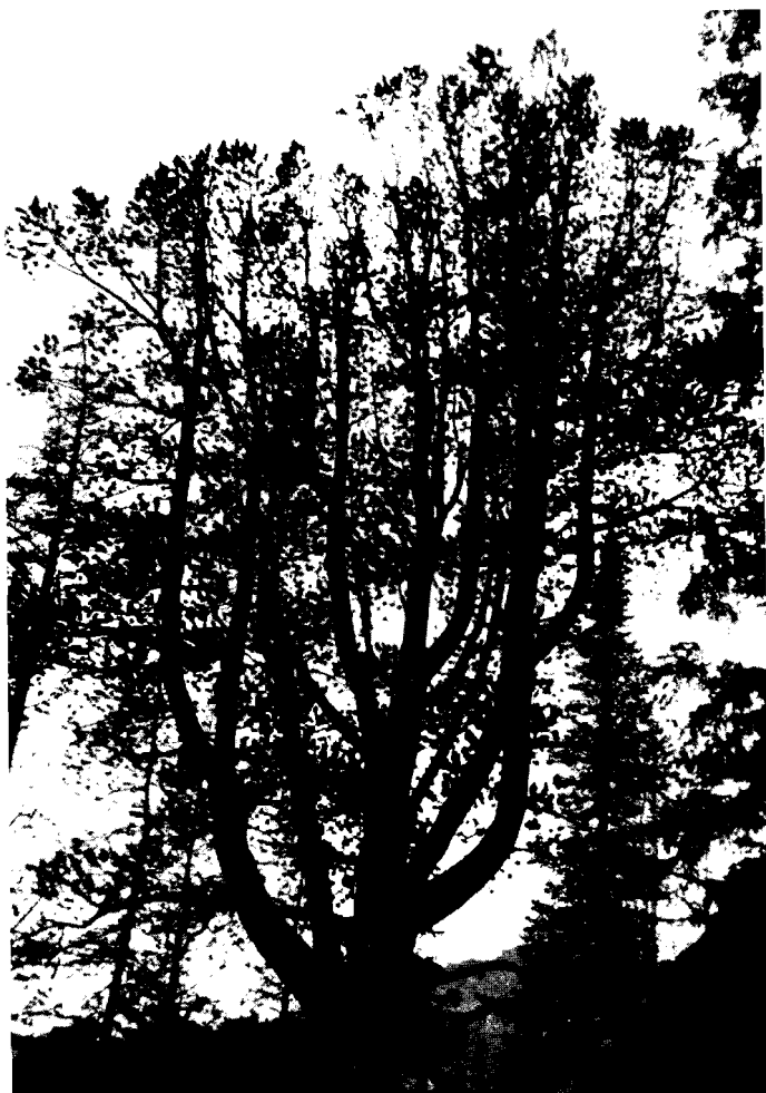
Figure 3 —Upswept branch-trunks of an ancient whitebark pine in the timberline zone.