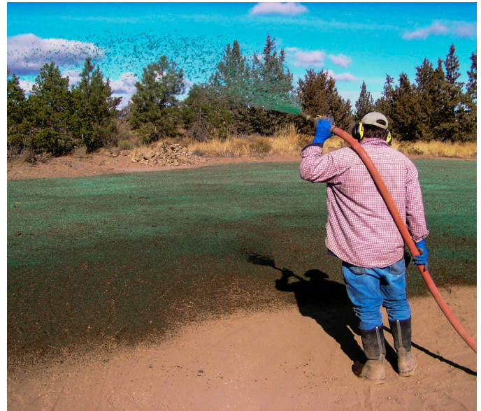
Figure 15. Hydroseeding a native plant mix including sulphur-flower buckwheat at the Deschutes National Forest Ranger District Office in Bend, OR. The broadcast hydromulch and seed was applied in fall 2011 using sulphur-flower buckwheat and other native plant seed collected about 10 miles south. The site was irrigated.

seeding year (Stevens et al. 1996). Given the high variability of the species, it is important to match the habitat and variety of the plant material to the revegetation or restoration site (LBJWC 2019). See Seed Sourcing section.