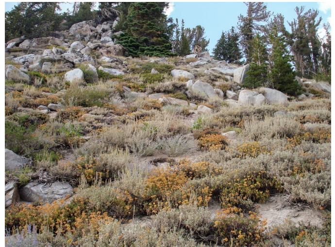
Figure 3. Sulphur-flower buckwheat growing in a subalpine environment in Nevada.

Sulphur-flower buckwheat is considered a dominant species in subalpine and alpine habitats. The Payson's sedge ( Carex paysonis )-sulphur-flower buckwheat community occurs above treeline on the south side of Mt Hood in Oregon (Titus and Tsuyuzaki 1999). On the east slope of the Sierra Nevada in California, sulphur-flower buckwheat dominates treeline habitats on south and southwest slopes from 7,840 to 9,120 feet (2,390-2,780 m) (Jackson 1985).