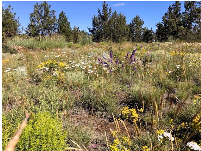
Figure 16. An 8-year-old hydroseeded native plant mix including sulphur-flower buckwheat growing at the Deschutes National Forest Ranger District Office in Bend, OR. The site is a western juniper/antelope bitterbrush/bluebunch wheatgrass potential vegetation type.

grasses) species (0.5 seedling/1 × 1.5 m plot). Establishment in year 2 was best in plots seeded with only late-seral species (~0.8 seedling/plot). Sulphur-flower buckwheat seed was collected within 1.2 miles (2 km) of the experimental plots. Seeds were broadcast and raked in at a rate of 60 filled seeds/ft 2 (646/m 2 ). The seed mix was evenly divided among the species in the mixture. Before seeding, all plots were treated with glyphosate, which reduced cheatgrass cover to 5% or less for the first year. In each year, sulphur-flower buckwheat seedlings were also present in the unseeded controls (~0.1 seedling/plot) (Rowe and Brown 2008).