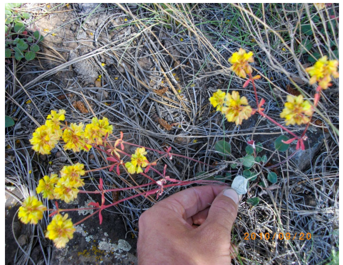
Figure 5. Sulphur-flower buckwheat leaves are fuzzy to glabrous on both or just one side.

Some of the variability in sulphur-flower buckwheat forms is partitioned among the multiple varieties (see Appendix 1). Other variation can result from changes in weather or climate. In an experimental study in Grand Teton National Park, the height of sulphur-flower buckwheat inflorescences was 3 inches (7.8 cm) greater with snow removal treatments and 3.7 inches (9.5 cm) greater with snow removal + heating treatments in 1 of 2 years. Snow removal treatments significantly reduced soil moisture ( P \leq 0.02 ). Heating increased morning temperatures and increased soil moisture early in the growing season (Sherwood et al. 2017).