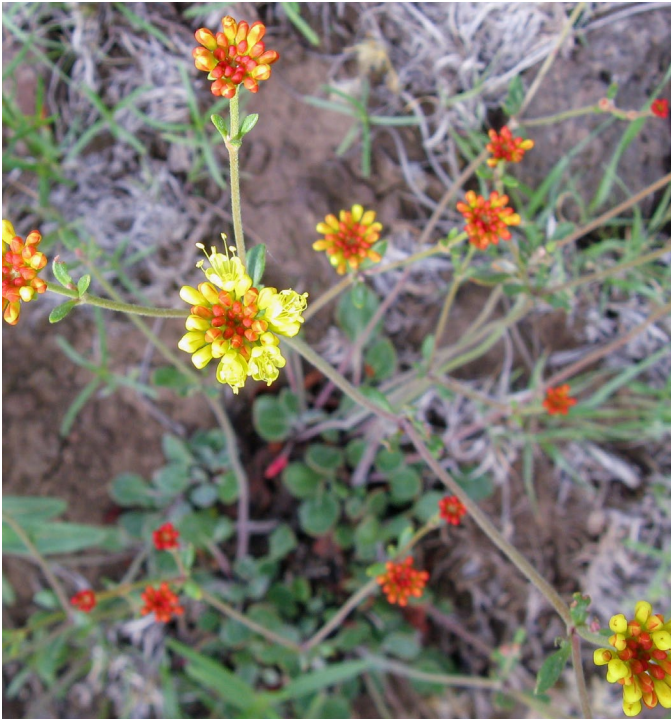
Figure 6. Sulphur-flower buckwheat inflorescences contain many small individual flowers having cream to yellow to red petals.

Pollination. Pollinator visitation increases seed production. On Arrastre Flat in the San Bernardino Mountains of southern California, plants protected from insects produced just 25% of the seed produced by freely visited plants. Regular visitors of sulphur-flower buckwheat flowers were Sphecid wasps (Sphecidae) and honey bees ( Apis mellifera ). Occasional visitors included flies, other bees, and butterflies (O'Brien 1980). Sulphur-flower buckwheat is important to and pollinated by a variety of flies, bees, wasps, and butterflies, see Insects section.