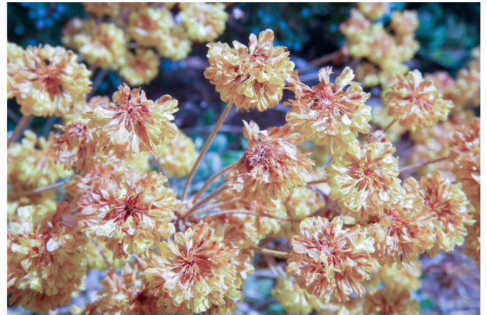
Figure 9. Papery sulphur-flower buckwheat flowers signaling mature seed is available at this site in Colorado.

Collection timing. Wildland seed is generally ready for harvest from June to September although it may be ready earlier or later depending on elevation and weather. Seed is typically mature when flower parts are dry and papery and, in some cases, have turned tan or red-orange in color (Fig. 9) (Parkinson and DeBolt 2005; Luna and Corey 2008; Blanke and Woodruff 2011; Young-Matthews 2012). Mature seeds are hard and cannot be crushed by thumbnail pressure (Young 1989). Typically seeds are retained on the plant for up to 3 weeks once mature (Young-Matthews 2012), but Parkinson and DeBolt (2005) recommend periodic checks to maximize harvests. Although Monsen et al. (2004) indicated sulphur-flower buckwheat produced good seed crops in most years, even dry years, Young (1989) reported low or no seed production in several years over a 15-year period.