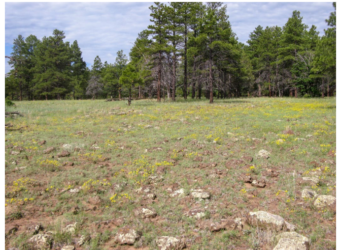
Figure 1. Sulphur-flower buckwheat growing in a forest grassland opening in Arizona.

Gravelly Range, sulphur-flower buckwheat only occurred on northeastern exposures dominated by western needlegrass ( Achnatherum occidentale subsp. occidentale ). Northeastern slopes were wetter than the southwestern slopes dominated by Idaho fescue ( Festuca idahoensis ) and bluebunch wheatgrass (Mueggler 1983). At elevations of 7,000 to 9,000 feet (2,100-2,700 m) in the Madison Range, also in southwestern Montana, sulphur-flower buckwheat occurred most often in openings when forested, non-forested, and ecotone vegetation were compared. Idaho fescue was characteristic of non-forested and ecotone sites (Patten 1963). When dry grasslands along an altitudinal gradient from 5,300-11,000 feet (1,600-3,400 m) were evaluated in Colorado's Boulder and Gilpin counties, sulphur-flower buckwheat occurred in all but the highest subalpine-elevation grasslands (Ramaley 1916).