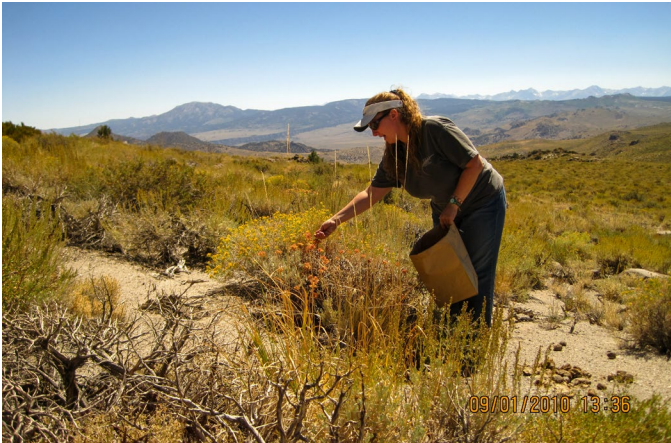
Figure 10. Hand stripping seed from E. u. var. nevadense in California.

Young 1986; Rose et al. 1998; Monsen et al. 2004; Parkinson and DeBolt 2005). Holmgren (1954) reported sulphur-flower buckwheat seeds that remained on the plant for a considerable time after ripening and were easily collected by hand stripping.