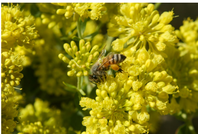
Figure 7. Honey bee visits sulphur-flower buckwheat flowers at Oregon State University's Malheur Experiment Station, Ontario, Oregon. Photo: C. Shock, June 19.

Pollinators representing the Andrenidae, Apidae, Bombyliidae, Halictidae, Hesperidae, Lycaenidae, Muscidae, Nymphalidae, Pieridae, Sphecidae, Syrphidae, and Tachinidae families were observed utilizing sulphur-flower buckwheat in at least 1 of 3 years of observations made in meadows at the Rocky Mountain Biological Laboratory, Colorado (Burkle and Irwin 2009).