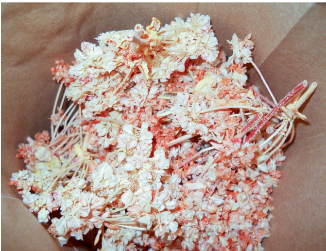
Figure 11. Seed collection gathered by clipping seed heads from E. u. var. majus in Wyoming.

Post-collection management. Sulphur-flower buckwheat flowers and stems are typically quite dry at the time of harvest, but bracts and flower material can absorb moisture at night or at other times when humidity is high. Harvested seed should be thoroughly dried and then treated to 48 hours of freezing or with an insecticide to kill insect pests prior to storing (Fig. 11) (Parkinson and DeBolt 2005).