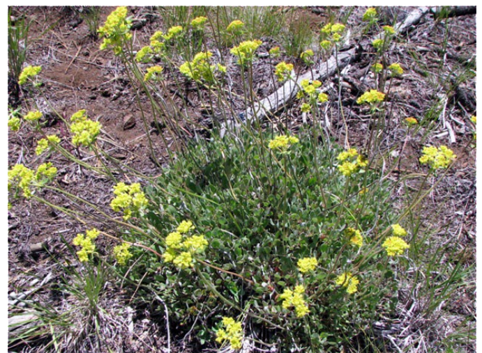
Figure 4. Sulphur-flower buckwheat plant growing in Oregon.

Sulphur-flower buckwheat is an extremely variable species, with different varieties growing as herbaceous (Fig. 4) or woody perennials from a woody branching crown (Dayton 1960; Rose et al. 1998; Lambert 2005; Reveal 2005). Plants range from small, low-growing and spreading to rather large, erect shrub forms (1-80 in [2-200 cm] tall × 2-80 in [5-200 cm] wide) (Hickman 1993; Reveal 2005; Hitchcock and Cronquist 2018). Foliage can be glabrous to densely covered in short, woolly hairs (Reveal 2005).