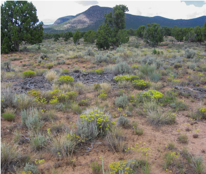
Figure 2. Sulphur-flower buckwheat growing in a juniper woodland in Utah.

( Populus tremuloides ) stands growing on leeward high-snow accumulation slopes or downslope from large snow drifts. These stands received heavy deer ( Odocoileus spp.) and cattle use (Burke et al. 1989).