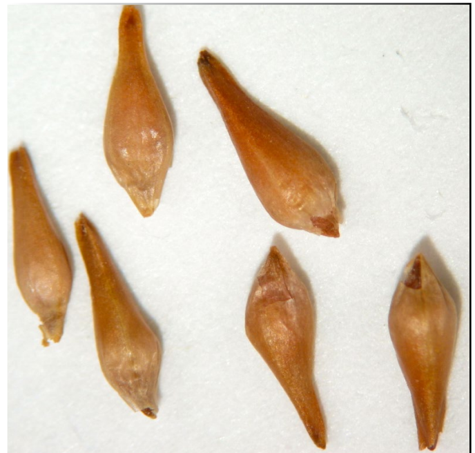
Figure 12. Clean sulphur-flower buckwheat seed processed by Bend Seed Extractory.

Seed Cleaning. Difficulty of seed cleaning varies by seed lot and collection method. Collections with a lot of plant material or large amounts of unfilled seed are more difficult to clean because unfilled seeds and flower bracts can be difficult to remove (Stevens et al. 1996; Wall and MacDonald 2009). It is common for collections to include perianths, involucre, and inflorescence branches with the seed. Because the ovule within the seed is anatropous, the radicle end is pointing outward and upward making germination possible with the perianth still attached (Meyer 2008). Depending on the amount of plant material in the collection, seed is generally cleaned satisfactorily through a hammermill, barley de-bearder, or gentle brush machine to break the seeds from the stalks and bracts followed by passing the collection through an air-screen machine to remove chaff and weed seeds (Monsen et al. 2004; Young-Matthews 2012). Material should not be handled too roughly because the radicle end of the achene is typically slender and easily damaged (Fig. 12) (Meyer 2008).