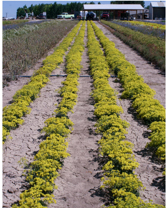
Figure 13. Sulphur-flower buckwheat seed production plot growing at OSU MES in Ontario, OR.

Seed production of sulphur-flower buckwheat has been evaluated by researchers at Oregon State University's Malheur Experiment Station (OSU MES) (Shock et al. 2017), J Herbert Stone Nursery (JHSN) (Archibald 2006), and Aberdeen Idaho Plant Materials Center (PMC) (St. John and Ogle 2011). Their management practices and relationships to successful seed production are provided in the sections below. At OSU MES (Fig. 13), sulphur-flower buckwheat produced seed the second year after seeding and crops were harvested for 11 years (Shock et al. 2017).