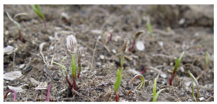
Figure 12. Nineleaf biscuitroot seedlings emerging from a southern Idaho planting.

Establishment and Growth. In its first year of growth, nineleaf biscuitroot produces few leaves and devotes energy to taproot development (Ogle et al. 2012). In the early seedling stage, nineleaf biscuitroot can be mistaken for a grass due to its linear cotyledons (Fig. 12; Pavek et al. 2012). Plants are considered established after a year and flower after 2 to 4 years of growth (Ogle et al. 2012; Shock et al. 2016). Once established, nineleaf biscuitroot is a strong perennial when protected from rodents (Shock et al. 2018). Plants green up, flower, and set seed early in the growing season (Table 6).