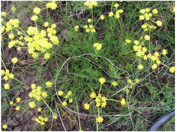
Figure 5. Nineleaf biscuitroot plant with highly dissected leaves and umbellets with small yellow flowers in compound umbels.

flowers with some male flowers, while those on shorter rays support mainly male flowers (Welsh et al. 2016; Hitchcock and Cronquist 2018). Individual flowers have five bright yellow stamens and five yellow petals, which fade to white with age (Welsh et al. 2016). Flowers produce schizocarps, which are fruits with two seeds (mericarps). Schizocarps are dry, oblong to elliptical, and 0.2 to 0.6 inch (6-15 mm) long by 0.2 to 0.4 inch wide (4-11 mm) wide (Patterson et al. 1985). Mericarps separate along their midlines when mature. Mericarps are strongly flattened, unnotched at the base and apex with 5 equal ribs on the dorsal side and thin wings along the sides (USDA FS 1937; Luna et al. 2018).