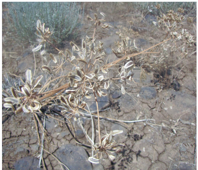
Figure 9. Nineleaf biscuitroot with mature seed dispersing.

Collection methods. Wildland seed is easily hand collected by stripping or shaking umbels over a container or by clipping the inflorescences (Fig. 10; Jorgensen and Stevens 2004; Parkinson and DeBolt 2005; Skinner 2007). Seed detaches readily from the umbellets. Collections made by shaking ripe inflorescences over a container are very clean (Ogle et al. 2012).