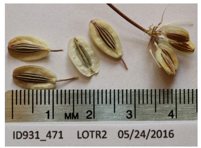
Figure 11. Nineleaf biscuitroot fruits (winged schizocarps with ribs) and a mericarp (center) with the commissure visible.

Seed Cleaning. Seed can be cleaned to high purity with minimal air screening (Ogle et al. 2012). Seeds must be handled carefully as they are fragile and brittle. Small collections can be carefully hand-rubbed to free seeds from the inflorescence then cleaned using an air column separator. Large collections require cleaning with air screen equipment (Skinner 2007).