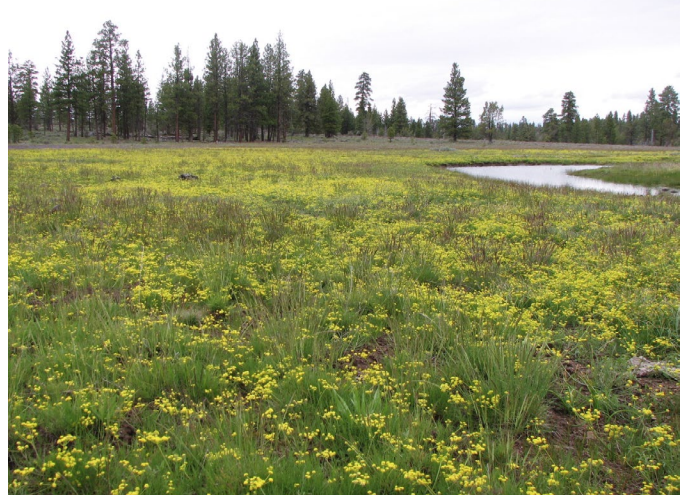
Figure 2. Nineleaf biscuitroot growing in a montane forest opening in Oregon.

woodlands where soil moisture availability was limited by layers of hard clay and duripan (Driscoll 1964; Miller et al. 2000). On pumice soils in central Oregon, nineleaf biscuitroot was most common in the driest, lowest elevation ponderosa pine/ antelope bitterbrush communities (Dyrness and Youngberg 1966). In western Montana, nineleaf biscuitroot was an indicator of xeric subalpine larch ( Larix lyallii ) stands based on the species composition of 127 stands found near timberline at cold, rocky sites (Arno and Habeck 1972).