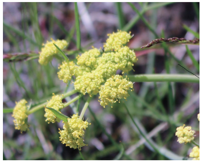
Figure 6. Nineleaf biscuitroot's compound umbel with the typical unequal ray lengths and umbellets in full bloom.

Varieties. Nineleaf biscuitroot varieties in some locations are poorly defined (Hickman 1993) and in other locations are in taxonomic flux