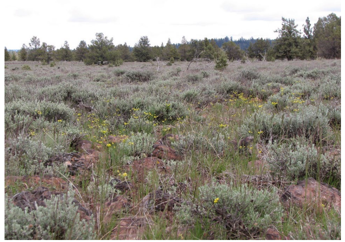
Figure 1. Nineleaf biscuitroot growing in a dry sagebrush community in Oregon.

Habitat and Plant Associations. Nineleaf biscuitroot is adapted to intense sun exposure (Fig. 1). Plants have leaves with very narrow blades that resist water loss with excessive radiation. It is common in open terrain, rocky sites, meadows, and mountain sites with high sun exposure (Daubenmire 1975a). Nineleaf biscuitroot occurs in dry to moist plains, foothills, lower and midmontane locations, and is occasional at highelevation sites averaging 90 or more frost-free days (USDA FS 1937; Lambert 2005a; Tilley et al. 2010; Pavek et al. 2012). It occurs at sites receiving 8 to 20 inches (203-508 mm) of annual precipitation that are typically moist in spring but dry by early summer (Taylor 1992; Skinner 2007).