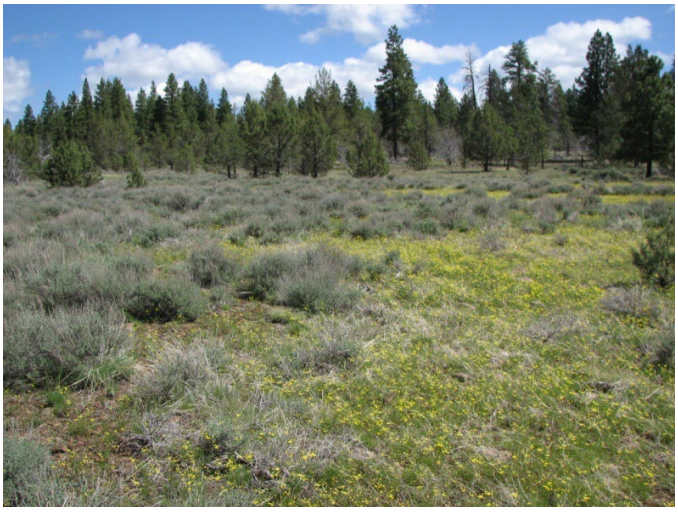
Figure 3. Nineleaf biscuitroot growing in an upper elevation sagebrush community abutting a montane forest in Oregon.

was lower in grasslands on north- (0.9 lbs/acre [1 kg/ha]; 1% freg) than south-facing slopes (7 lbs/ acre [8 kg/ha]; 32% freq) with extremely stony, silt loam soils (Shiflet 1975). Nineleaf biscuitroot was also associated with rough fescue (F. campestris)bluebunch wheatgrass and rough fescue-Idaho fescue communities in western Montana (Mueggler and Stewart 1980). In the Bitterroot Mountains, nineleaf biscuitroot was common in high-elevation grassland balds (>6000 ft [1,830 m]). The balds are considered climax vegetation and occur on south-facing slopes within the spruce-fir (Picea-Abies spp.) zone where soils are coarsely fractured and excessive summer moisture deficiencies restrict tree establishment (Root and Habeck 1972).