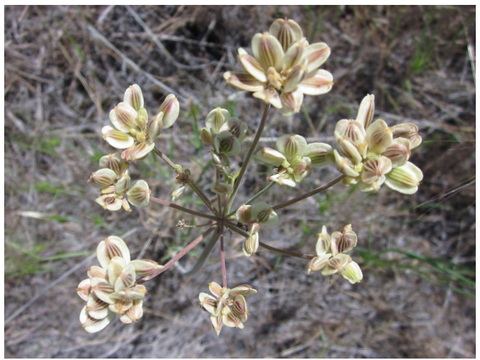
Figure 7. A single nineleaf biscuitroot compound umbel with mature fruits (schizocarps).

Above-ground seedling growth is slow, and plants produce only a few leaves in their first year because energy is devoted to taproot development (Ogle et al. 2012).