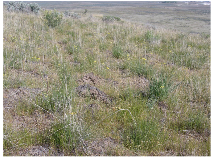
Figure 4. Nineleaf biscuitroot growing with bluebunch wheatgrass near Boise, ID.

Elevation. Nineleaf biscuitroot is most common at low and mid-elevations but also occurs at elevations up to 10,000 feet (3,000 m) (USDA FS