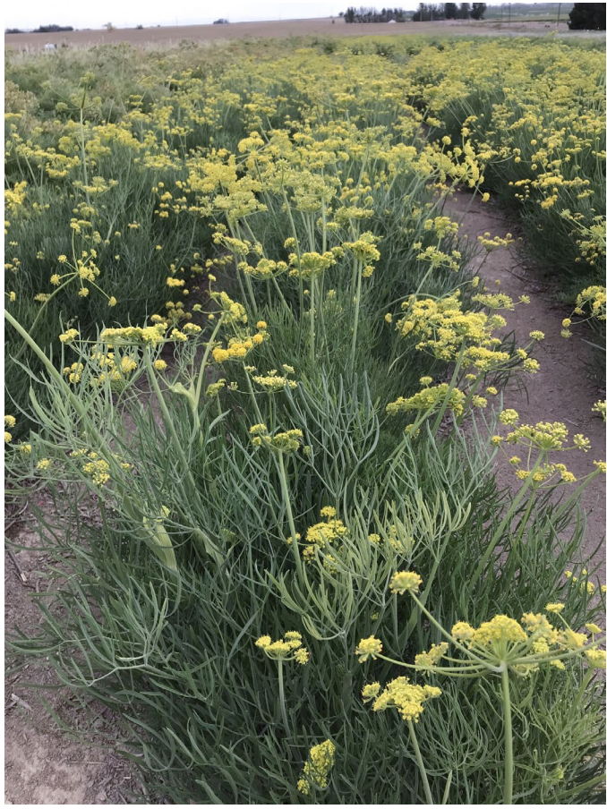
Figure 13. Nineleaf biscuitroot irrigation trial at OSU MES.

Aberdeen PMC was much more efficient than hand harvesting, and the seed required little postharvest cleaning (Tilley and Bair 2011).