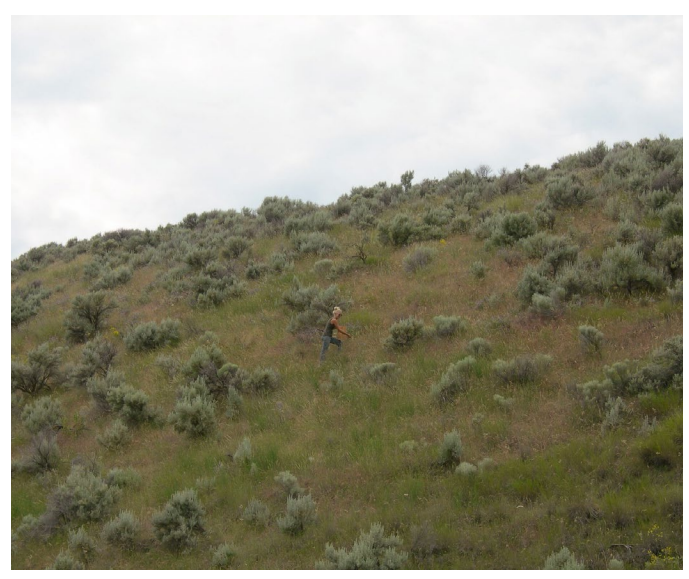
Figure 10. Collecting wildland nineleaf biscuitroot seed in a sagebrush community.

Collection methods. Wildland seed is easily hand collected by stripping or shaking umbels over a container or by clipping the inflorescences (Fig. 10; Jorgensen and Stevens 2004; Parkinson and DeBolt 2005; Skinner 2007). Seed detaches readily from the umbellets. Collections made by shaking ripe inflorescences over a container are very clean (Ogle et al. 2012).