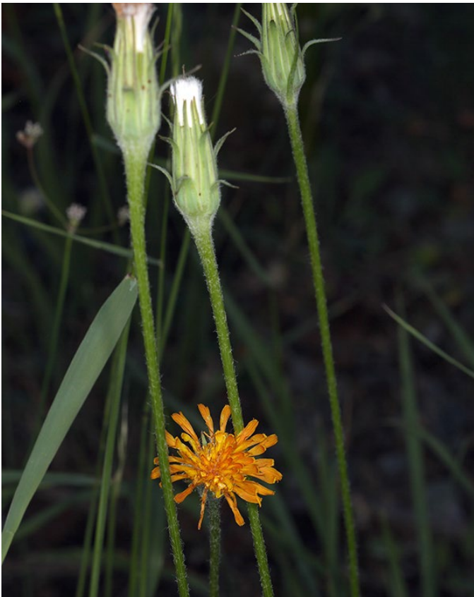
Figure 8. Orange agoseris flowering and just starting to produce seed.