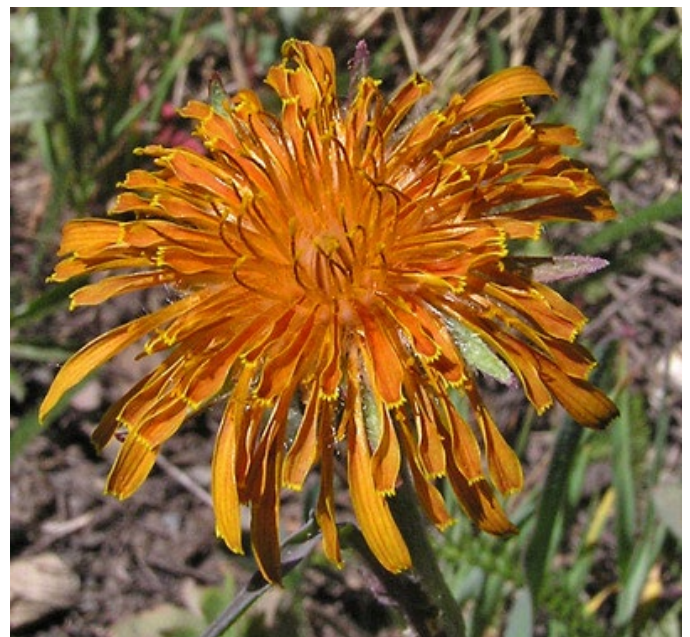
Figure 4. Orange agoseris flower head with lobed ligulate florets the inner of which being shorter than the outer.

Orange agoseris produces cylindric cypselae fruits, but these are often referred to as achenes in the literature. The cypselae have 0.4 to 0.6-inch (0.9-1.5 cm) long pappi of capillary bristles arranged in a two or three series (Baird 2006; Welsh et al. 2016). Cypselae are 10-ribbed, 4 to 9 mm long, with slender beaks. The beaks are often more than half as long as the cypselae bodies (Munz and Keck 1973; Welsh et al. 2016; Hitchcock and Cronquist 2018).