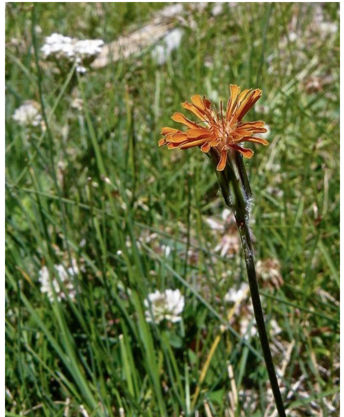
Figure 1. Orange agoseris growing in a meadow in California.

The following studies describe some of the species and plant communities associated with orange agoseris at sporadic sites throughout its range. Descriptions of plant associations from orange agoseris' southern-most range are lacking. In Alberta, orange agoseris occurs with alpine timothy ( Phleum alpinum ) and tufted hairgrass ( Deschampsia caespitosa ) in alpine meadows at the forest-tundra ecotone (Heusser 1956). Orange agoseris occurs in several subalpine meadows in the Olympic Mountains in Washington. It was most common in mesic Idaho fescue ( Festuca idahoensis ) grasslands occupying dry south- to west-facing slopes from 5,150 to 5,550 feet (1,570-1,690 m) elevations in the northeastern part of the mountain range. These grasslands occupy relatively steep slopes and are snow-free by mid-June. Orange agoseris was next most common in cushion plant communities on moderately steep to steep south- to southwest facing slopes between 5,050 to 5,250 feet (1,540-1,600 m). The cushion plant communities occupy windy sites that are snow-free by early May and experience frequent spring freezing and thawing (Kuramoto and Bliss 1970). In Mount Rainier National Park, Washington, orange agoseris occurs in Sunrise Meadows with poorly developed soils dominated by greenleaf fescue ( F. viridula ) and broadleaf lupine ( Lupinus latifolius ) (Frank and del Moral 1986).