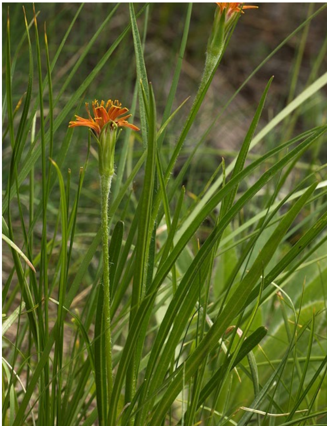
Figure 3. Orange agoseris plant in flower growing in Blaine County, Idaho.

Orange agoseris is a perennial scapose herb (Fig. 3) from a simple to branched caudex and strong, deep taproot (USFS 1937; Munz and Keck 1973; Welsh et al. 2016). Herbage is glabrous to villous and exudes a milky juice when damaged (Spellenberg 2001; Welsh et al. 2016). Leaves are entirely basal, erect to decumbent with leaf blades 1.4 to 15 inches (3.5-38 cm) long and 0.1 to 1.2 inches (0.3-3 cm) wide (Baird 2006). Leaf blades are narrow, linear to oblanceolate, and broadest at the middle (Spellenberg 2001). Leaf margins range from entire or with several teeth or lobes occurring in 2 to 4 pairs (Baird 2006). Flowers are produced individually at the ends of upright leafless stalks (Spellenberg 2001).