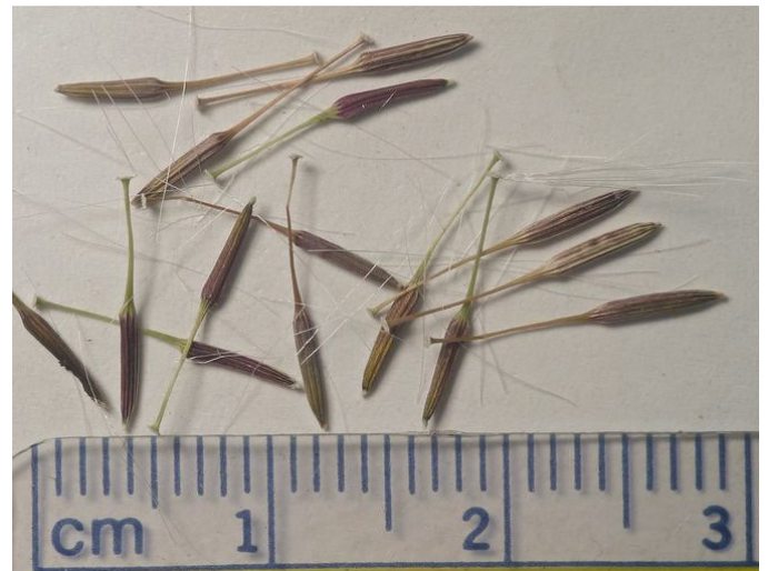
Figure 10. Individual orange agoseris seeds with visible ribs and stigma and style still attached.

Post-collection management. Jensen (2007) recommends storing seed (Fig. 10) in breathable bags in cool, dry, rodent-free conditions until it can be cleaned.