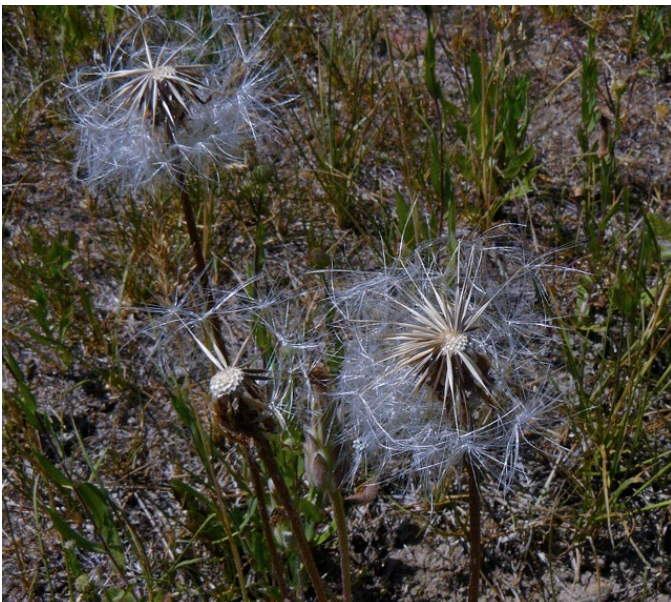
Figure 9. Mature orange agoseris seed heads dispersing seed.

Collection methods. Because orange agoseris plants typically occur in low densities, wildland seed is hand collected. Seeds are hand stripped by clasp the base of the seed head between two fingers and pulling upward while keeping the hand closed to reduce losing mature seeds (Jensen 2007).