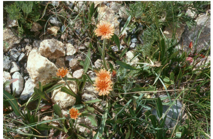
Figure 2. Orange agoseris growing at a rocky site in California. Photo: G.A. Monroe, CalPhotos, 1987.

shallow limestone sands (Merkle 1962). Both orange agoseris varieties occur in high-altitude meadows in Boulder Park, northern Colorado, which are concentrated on moist, gravelly soils. These high-altitude meadows are well supplied with moisture, but the climate is severe, and frosts occur nearly every week (Reed 1917). In Oregon's Cascade Range, orange agoseris grows in meadow openings of montane conifer forests where soils are deep (>5.6 feet [1.7 m]), very fine sandy loams (Halpern et al. 2014). In the Crested Butte area of west-central Colorado (10,500–11,500 ft [3,200–3,500 m]), orange agoseris averaged 0.5% cover on 60-year-old burn scars on heavy clay-textured soils (Langenheim 1962). On Deer Ridge in Olympic National Park, Washington (5,250–5,580 ft [1,600–1,700 m]), orange agoseris occurs in meadows with weakly developed, sandy soils. Moisture content of these soils ranged from 8.5 to 25.4% between mid-June to early September (del Moral 1983a).