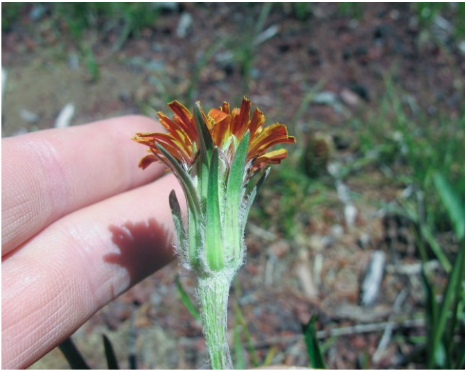
Figure 5. Tomentose orange agoseris involucre enclosing the flower head.

Varieties. The Flora of North America suggests that varieties are best distinguished by the involucre bracts and the beaks and ribs of cypselae (Baird 2006).