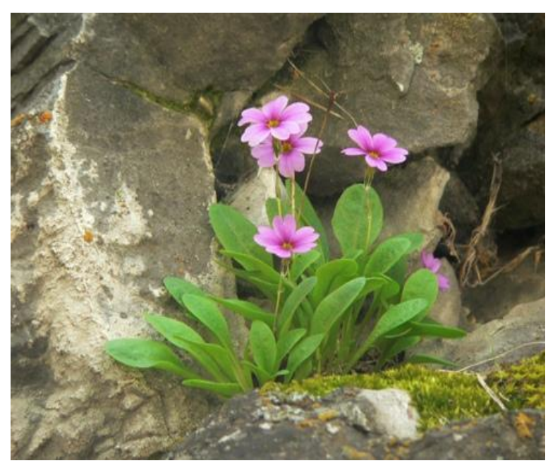
Figure 1. Primula maguirei in its dolomite cliff habitat