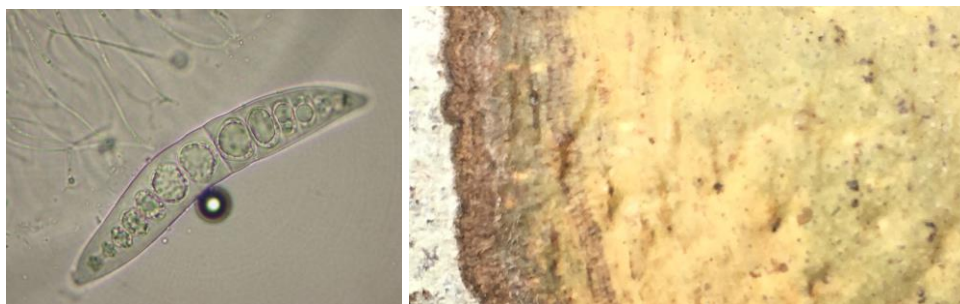
Fig. 2. Astrothelium pseudodermatodes , holotype. Left: ascospore; right: habitus. Width of left picture 200 µm, right picture 20 mm.

Ecology and distribution. On tree bark in Várzea forest; only known from Brazil.