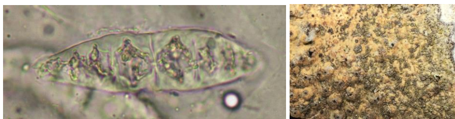
Fig. 1. Astrothelium fernandae , holotype. Left: ascospore; right: habitus. Width of left picture 100 μm, right picture 25 mm.

Ecology and distribution. On tree bark in Várzea forest; only known from Brazil.