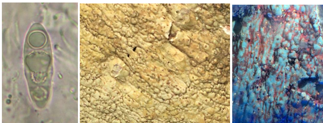
Fig. 4. Astrothelium xanthopseudocyphellatum , holotype. Left: ascospore; middle: habitus; right: thallus under UV. Width of left picture 30 \mu\text{m} , middle picture 0 mm, right picture 7 mm.

Ecology and distribution. On tree bark in Várzea forest; only known from Brazil.