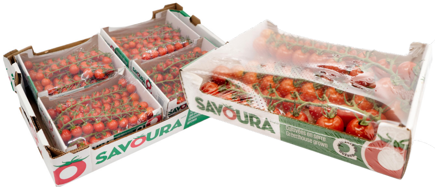
231339 - CV Tomatoes Cherry On-the-Vine "Cerizo" 8/1.5 lb Savoura Family-Pack box UPC: 8 11594 00004 4