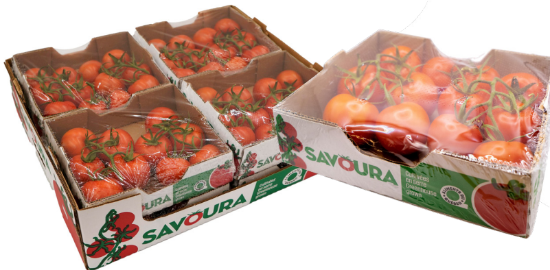
229867 - CV Tomatoes Cluster 8/4 lb Savoura Family-Pack box UPC: 8 11594 00037 2