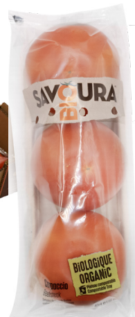
227745 - OG Tomatoes Beefsteak 12/1 lb Savoura Bio Tray Pack UPC: 8 59812 00018 6