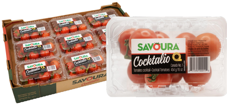
235654 - CV Tomatoes Cocktail On-the-Vine "Cocktalia" 9/1 lb Savoura clamshell UPC: 8 11594 10115 4