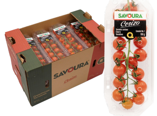
235655 - CV Tomatoes Cherry On-the-Vine "Cerizo" 20/5.3 oz Savoura clamshell UPC: 8 11594 10115 4