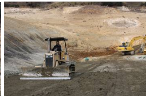
Crush and Compact