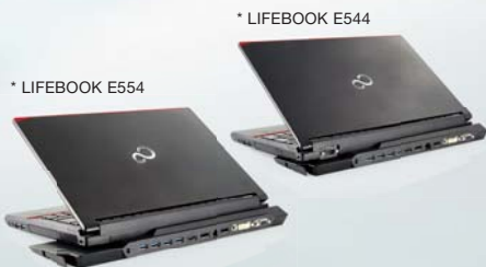
* LIFEBOOK E544