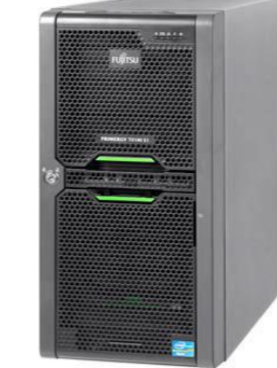
PRIMERGY TX140 S1p