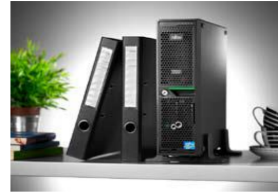
PRIMERGY TX120 S3p

For small environments with high demands