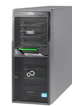
PRIMERGY TX150 S8

The one-processor tower server - maximized!