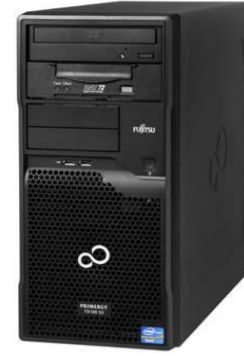
PRIMERGY TX100 S3p