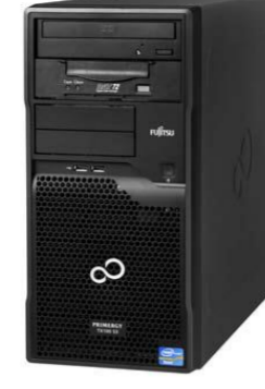
PRIMERGY TX100 S3p