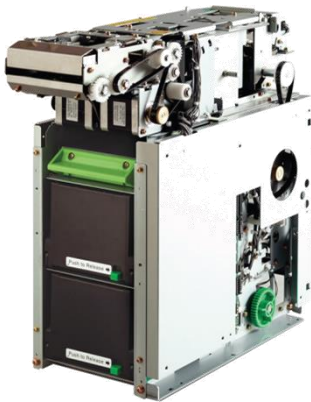
F56Bill Dispensing Unit

High Performance Multi Cassette Bill Dispensing Unit