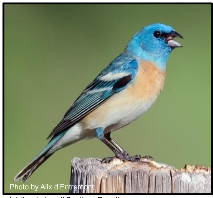
Adult male Lazuli Bunting - Breeding; https://www.allaboutbirds.org/quide/Lazuli Bunting/overview