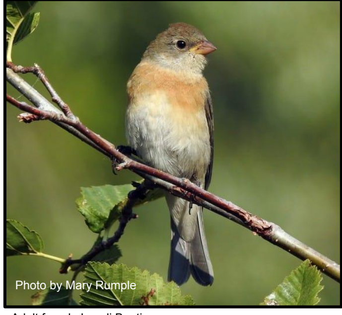
Adult female Lazuli Bunting; https://www.allaboutbirds.org/quide/Lazuli Bunting/overview