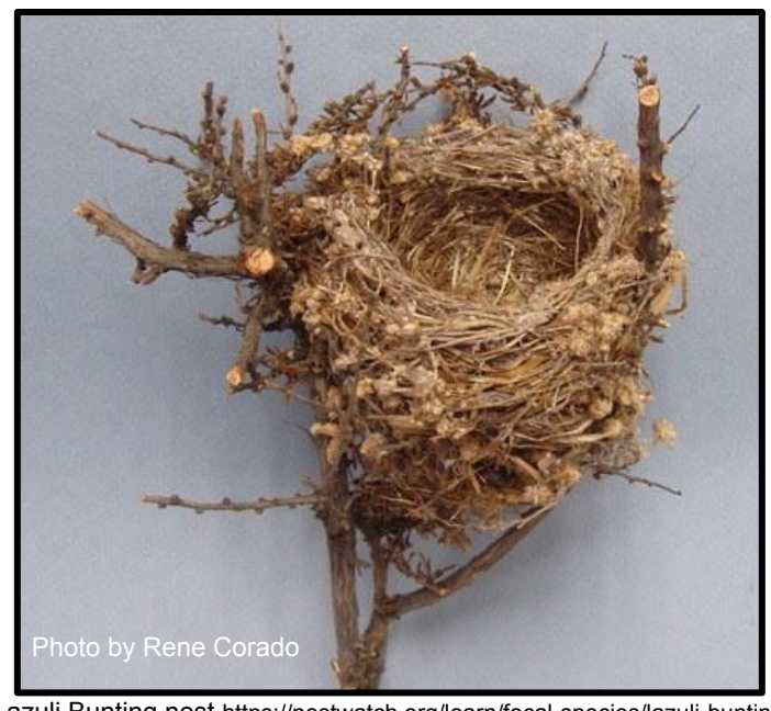
Lazuli Bunting nest https://nestwatch.org/learn/focal-species/lazuli-bunting