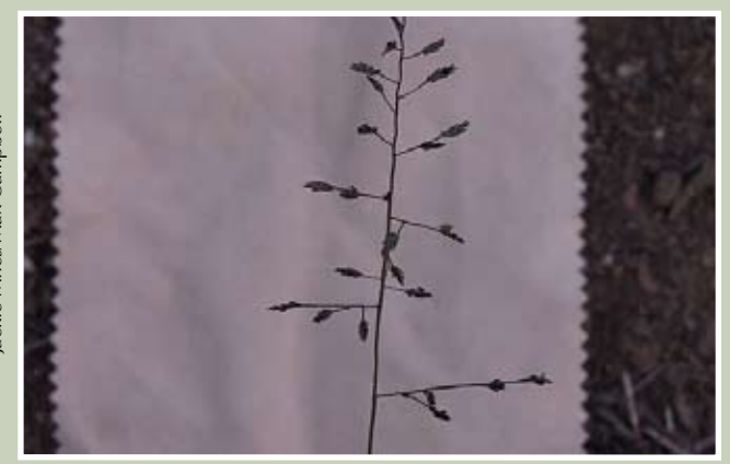
Native: paddock lovegrass

There are many native lovegrasses, some of which look a little similar. One such species is Eragrostis parviflora . It has long nodding seed heads that are more delicate but are also black or leaden grey in colour. It is usually a smaller plant. Paddock lovegrass ( Eragrostis leptostachya ) is a very common pasture plant that has a similar low-growing habit, with blue-green leaves, but the seed heads have short branches which stand out at right angles or even point backwards slightly from the main stem.