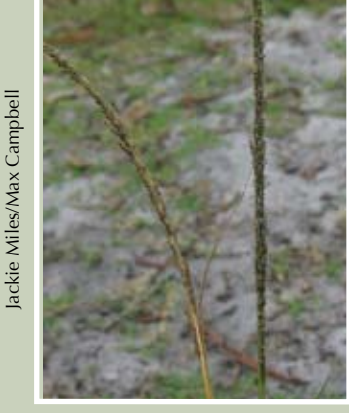
Weed: Parramatta grass

There are many native lovegrasses, some of which look a little similar. One such species is Eragrostis parviflora . It has long nodding seed heads that are more delicate but are also black or leaden grey in colour. It is usually a smaller plant. Paddock lovegrass ( Eragrostis leptostachya ) is a very common pasture plant that has a similar low-growing habit, with blue-green leaves, but the seed heads have short branches which stand out at right angles or even point backwards slightly from the main stem.