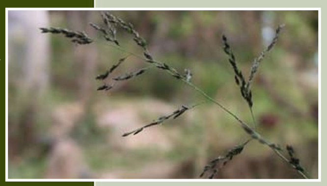
Weed: African lovegrass