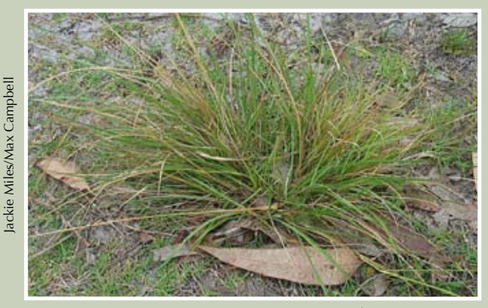
Weed: Parramatta grass

The weedy Parramatta grass ( Sporobolus africanus ) looks similar to the open, low-growing form. It has similar blue-green, hairless glossy leaves, a spreading growth habit, and the seed heads are black or grey in colour. However, they are a narrow spike, without spreading branches.