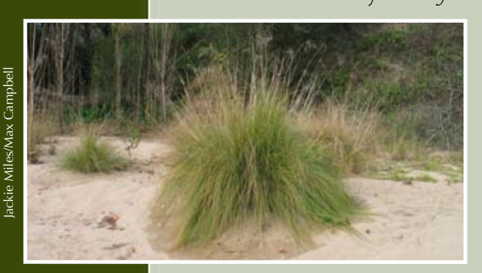
Weed: African lovegrass