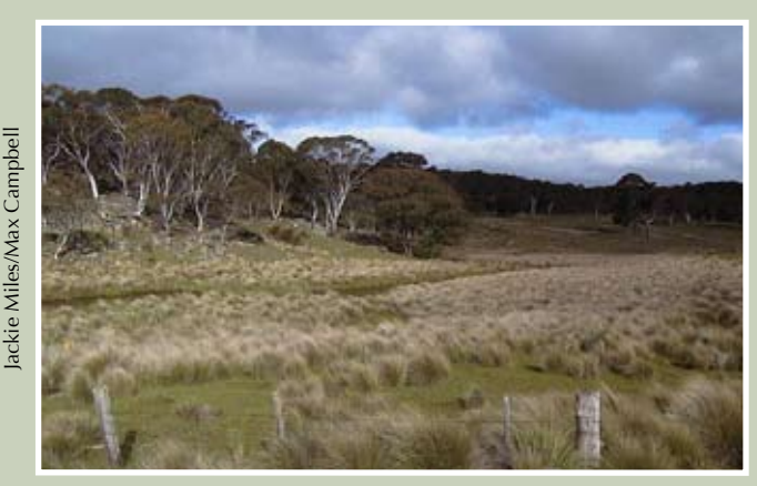
Jackie Miles/Max Campbell

The most similar grasses to the robust tussock form of African lovegrass are 'river' or 'silver' tussock (Poa labillardieri), the broader leaved Poa ensiformis and 'snowgrass' or poa 'tussock' (Poa sieberiana), which all differ in having the young seed heads purple tinged.