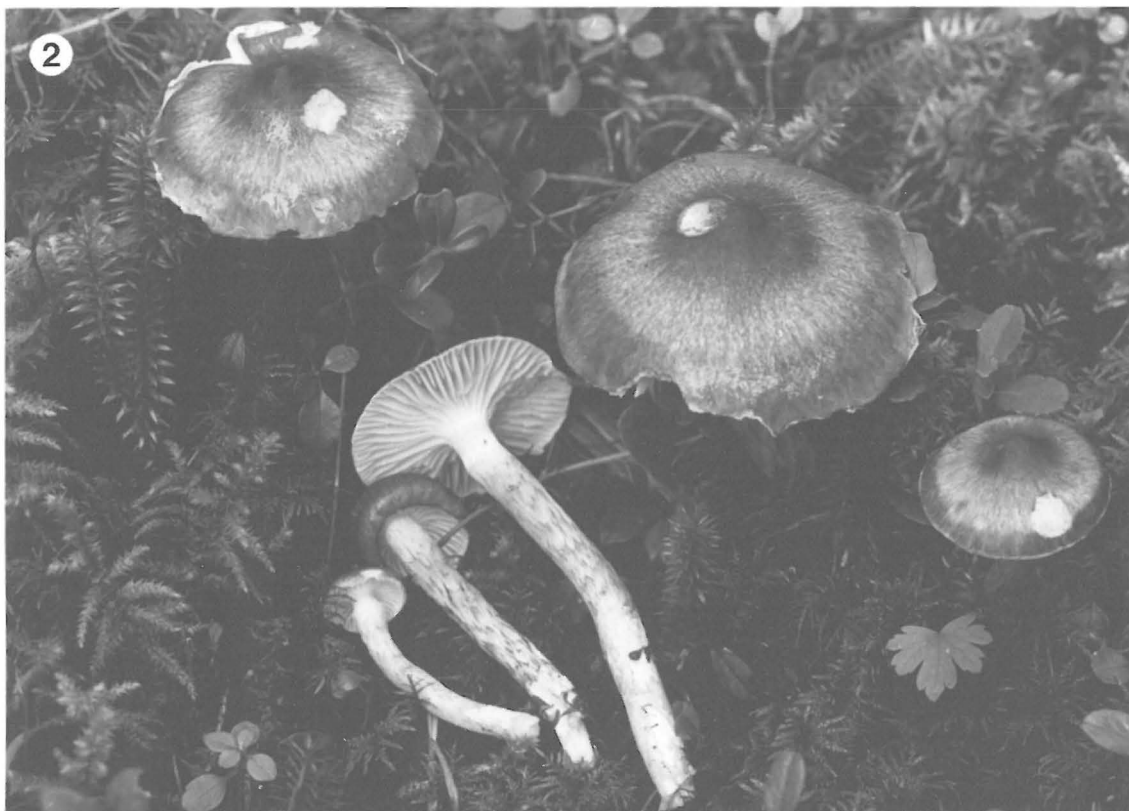
Fig. 2. Hygrophorus korhonenii fresh in situ, \times 0.8 (type).

brownish, fibrils of dry fibrillose inner velum and very narrow dark teeth of the broken slimy outer velum present at ring zone (the fibrils also present further down where the slime has worn off), these fibrils and teeth wearing off in time. Lamellae , odour , taste and context about as in H. olivaceoalbus . Spores 10.0–14.0 \times 5.2–7.5 \mu\text{m} , most fairly narrowly ellipsoid and oblong, the remainder (rarely the majority) obovoid, sometimes also a few lacrymoid spores present; wall hyaline, smooth, inamyloid. Basidia up to ca. 65 \times 10 \mu\text{m} , 4-spored. Cystidia none. Cortex of pileus an ixocutis, fairly gradually delimited from the context, hyphae ca. 2.5–7.0 \mu\text{m} in diam, subparallel to somewhat interwoven, only vacuolar pigment present, appearing as medium brown to dark brown granules; extracellular granules absent. Pubescence at stipe apex composed of hyphae in loose bundles, 5–10(–14) \mu\text{m} in diam, equal or very slightly narrowed or enlarged toward their apices. Clamps common in context and cutis. Ecology . Usually in mesotrophic and meso-eutrophic woods, including paludified ones, at times on oligotrophic ground, always associated with spruce ( Picea abies in Fennoscandia); from the middle of August to late October. Distribution . Hemiboreal to northern boreal, from sea level up to at least 630 m; not uncommon in Finland from the south coast to Kuusamo in the north.