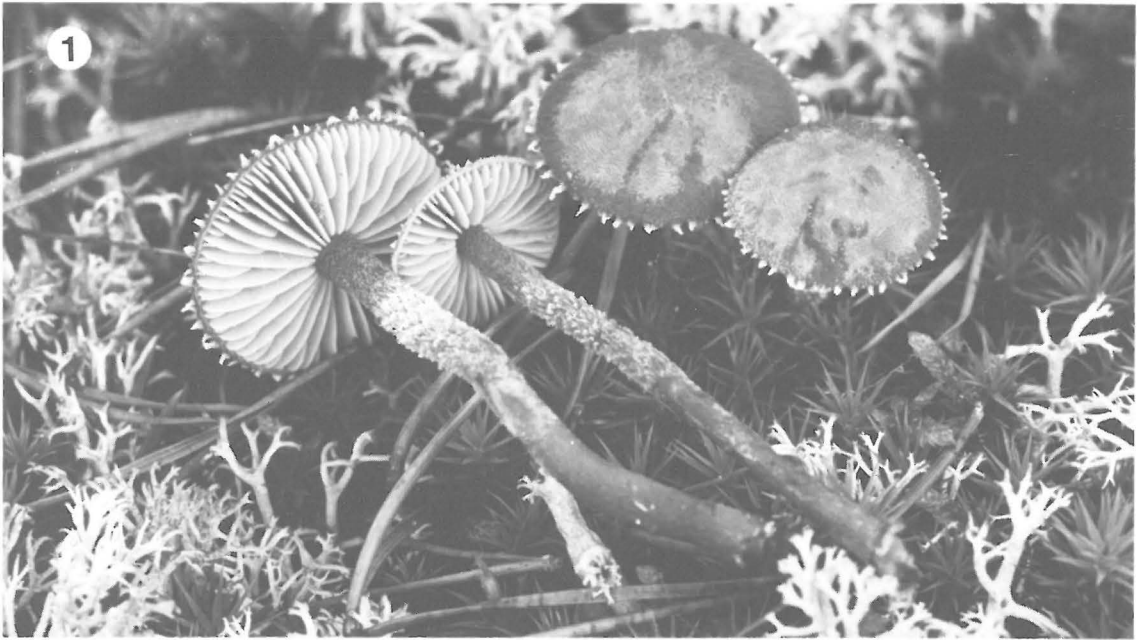
Fig. 1. Cystoderma saarenoksae fresh in situ, \times 1.5 (Finland, Uusimaa, Espoo, Espoonkartano, Grid 27°E: 6679:367, 20.X.1979 Korhonen 3059; H).

Typus: Finland, Uusimaa: Espoo, Tapiola, Suvikumpu, alt. 20 m, acid, siliceous, \pm distinctly man-influenced rock outcrops, on or among mosses such as Dicranum scoparium and Polytrichum juniperinum , associated with e.g. Betula sp., Pinus sylvestris , Cantharellula umbonata , Cystoderma jasonis , C. lilacipes , C. saarenoksae , Laccaria cf. proxima , Grid 27°E: 6677:377, 14.XI.1981 Harri Harmaja (H).