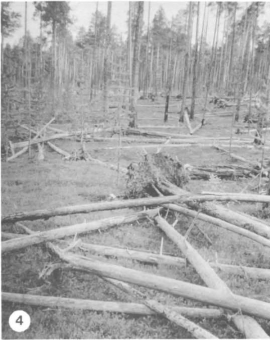
Figs. 4–5. Fallen trunks of the Scots Pine. — 4: Decorticated, mostly old windfalls in Värriö. August 1988. — 5: The area of the river Jaurujoki is characterized by extensive fresh windfalls of a storm in 1985. September 1988.