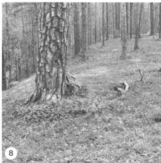
Fig. 7–8. Dry pine forests. — 7: The Uliginosum–Vaccinium–Empetrum type in Värriö. The field layer is low-growing and poor in species. August 1989. — 8: The Empetrum–Myrtillus type in Värriö. In the field layer Vaccinium myrtillus is fairly abundant. August 1989.

cally modified by the formerly frequent forest fires. In this respect biologists working in western Europe are unable to obtain information that is still available to their colleagues today in many sparsely inhabited areas of the Canadian North, Alaska and northern Asia, where forest fires are allowed to proceed freely, provided they do not threaten settlements or merchantable timber.