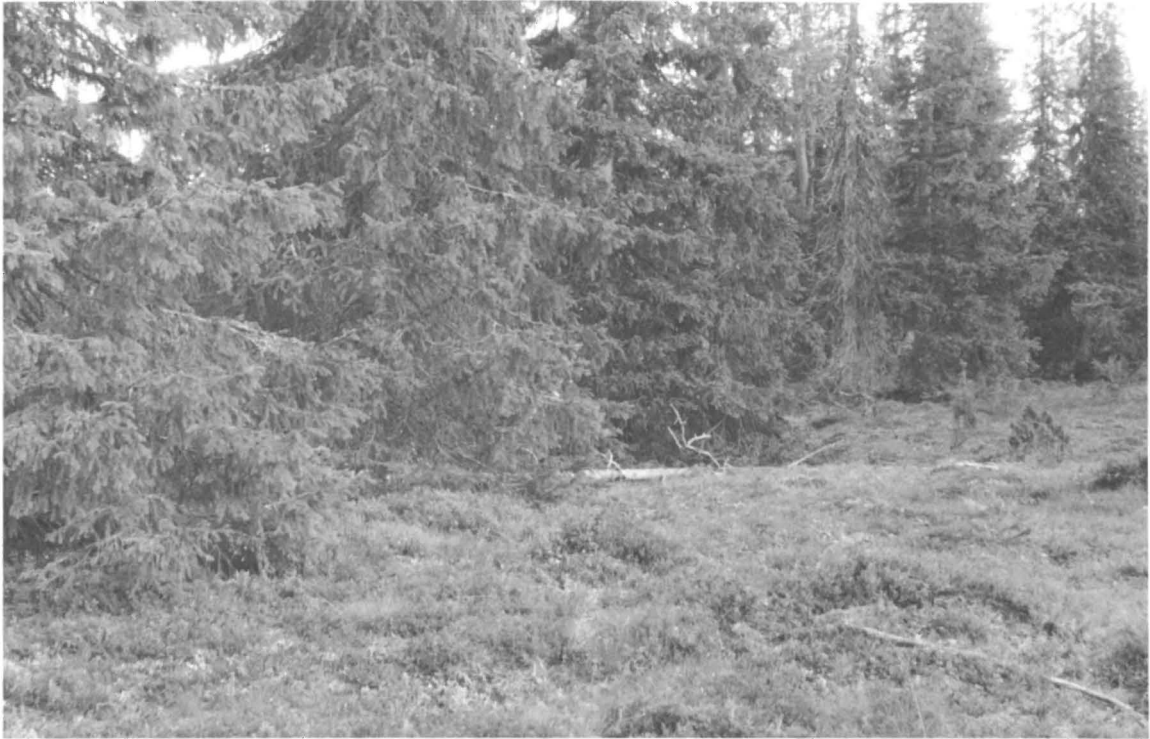
Fig. 9. Mesic spruce forest of the Hylocomium-Myrtillus type in the Värriö Strict Nature Reserve. August 1989.

la 1973). The field layer is very poor in species, low-growing and scanty, being formed by the dwarf shrubs Empetrum nigrum s. lat., Vaccinium vitis-idaea , V. myrtillus , V. uliginosum and Calluna vulgaris . Lichens, especially Cladina mitis , C. arbuscula , C. rangiferina and C. stellaris , predominate in the ground layer, intermixed with the mosses Dicranum fuscescens , D. scoparium , Pleurozium schreberi and Polytrichum juniperinum .