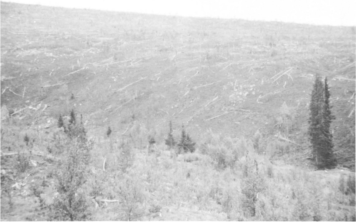
Fig. 6. The spruce forests of Tuntsa burned down in a natural fire in 1960. Thirty years after the fire, the landscape is still open and almost treeless. August 1988.

area is mostly situated over 300 m above sea level. Treeless heaths are common and fairly extensive on the fjeld tops.