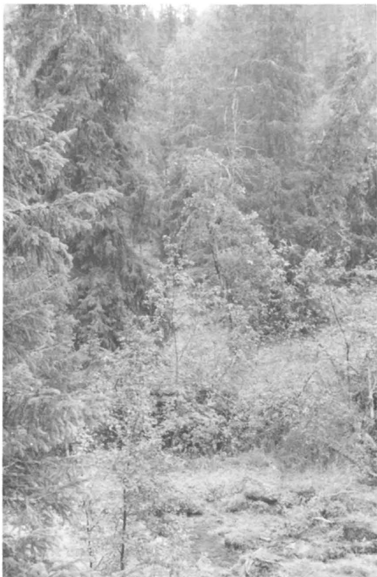
Fig. 10. Brookside forest in the Värriö Strict Nature Reserve. Betula pubescens , Sorbus aucuparia , Ribes spicatum , Salix species and Picea abies ssp. obovata . August 1989.

Empetrum nigrum , Ledum palustre ( Rhododendron tomentosum (Stokes) Harmaja, Harmaja 1990) and Vaccinium uliginosum . The herbs Deschampsia flexuosa , Luzula pilosa , Melampyrum pratense , Solidago virgaurea and Trientalis europaea are also very abundant.