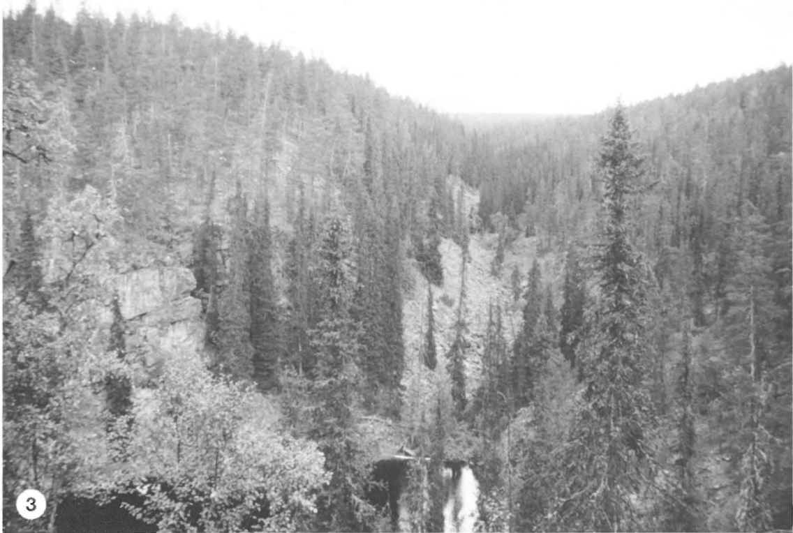
Figs. 1–3. The research area. — 1: The location of the area in northwestern Europe. — 2: A detailed map, showing nature reserves, parishes and some other names mentioned in the text. — 3: View over the Värriö Strict Nature Reserve, one of the last extensive virgin forests at the timberline in Finland. August 1989.