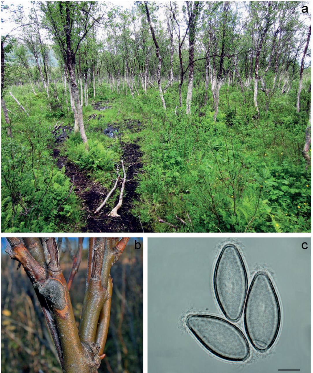
Fig. 1. Cryptomyces maximus . a = habitat of the species in Tromsø, Grønnlibruna N. b = mature stroma (Tromsø, Grønnlibruna N, 9.X.2016 A., U., H. & T. Rämä 2016-05 (TROM)). c = spores (Granmo AG4/08 (TROM)). Scale = 10 \mu m.