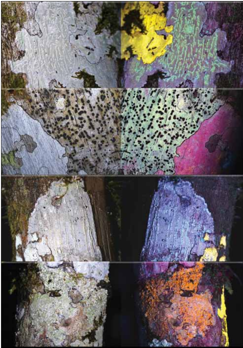
Figure 3. Bark-dwelling crustose lichens at Las Cruces Biological Station in Costa Rica, photographed at night under normal light (left) and under 354 nm long-wave UV light (right, mirrored). First row: Diorygma confluens (UV yellow thallus) and D. poitaei (UV green fruiting bodies). Second row: Pyrenula sp. (UV pale green) and unknown crust (UV pink-red). Third row: Cryptothecia sp. (UV light blue thallus). Fourth row: Pertusaria sp. (UV orange thallus).

and 400 nm, and is called so because it is just beyond the visible light recognized by the human eye as violet. Because of its high energy level, UV radiation can cause permanent damage to organic molecules and structures, including in humans.