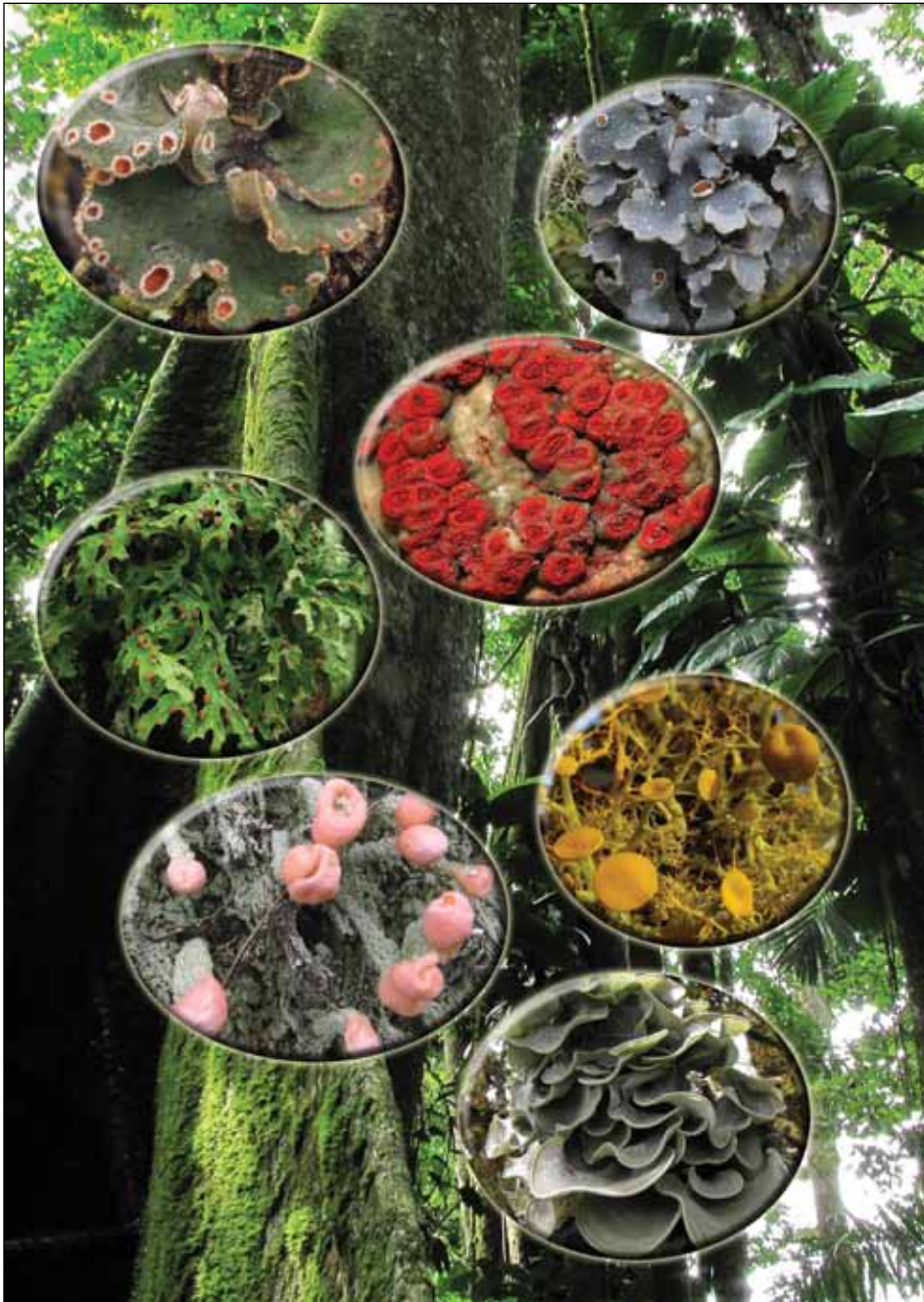
Figure 1. Tropical ecosystems harbor a high diversity of lichens. In the picture: Sticta gyalocarpa, Lobariella sipmanii, Marcelaria purpurina, Sticta laciniata, Teloschistes exilis, Dibaeis columbiana, and Cora aspera.