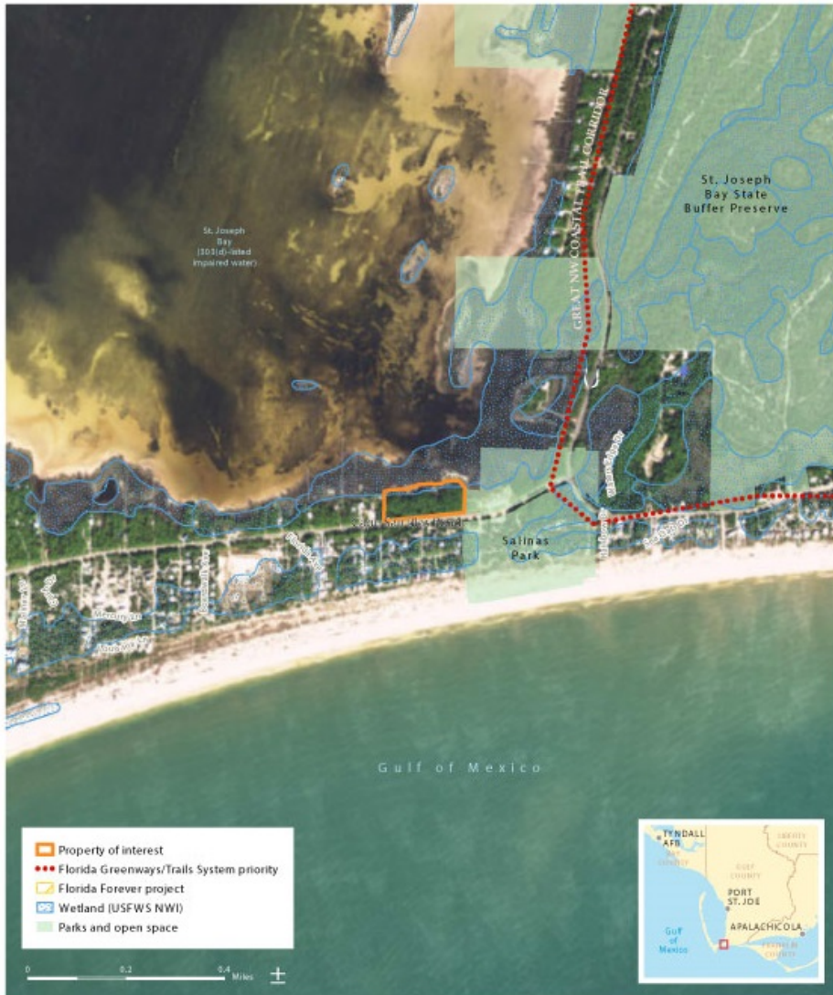
Figure 1: Salinas Park Addition Map