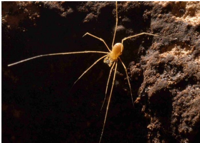
Figure 9. Texella tuberculata showing general Texella morphology