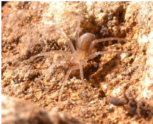
Figure 3. Cicurina madla from a cave in Government Canyon State Natural Area