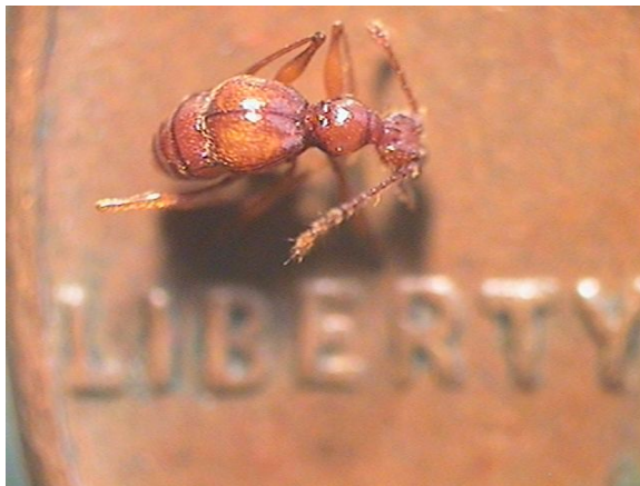
Figure 1. Batrisodes texanus