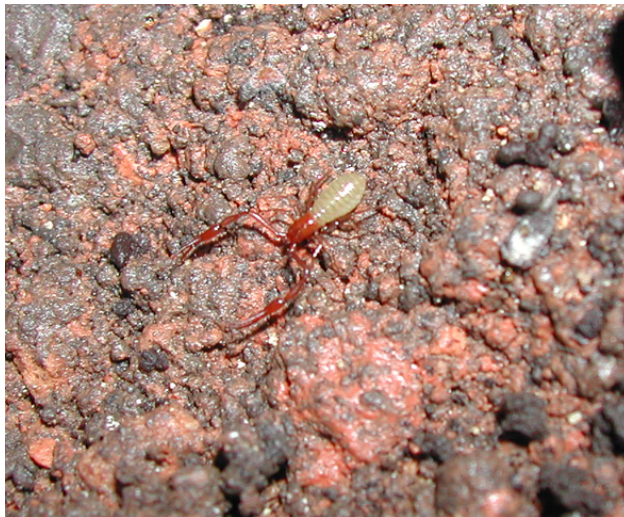
Figure 8. Tartarocreagris attenuata