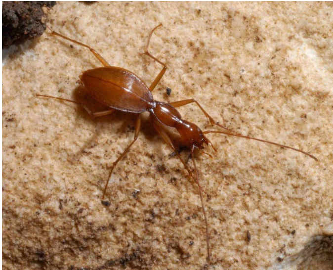
Figure 7. Rhadine persephone

Distribution: Travis and Williamson Counties