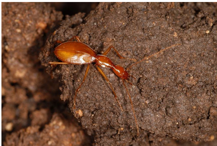
Figure 6. Rhadine infernalis