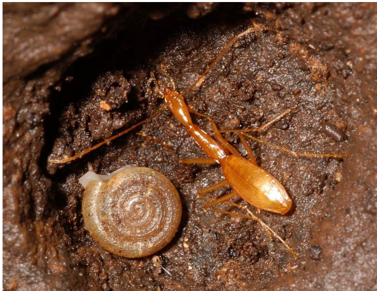
Figure 5. Rhadine exilis (on right)