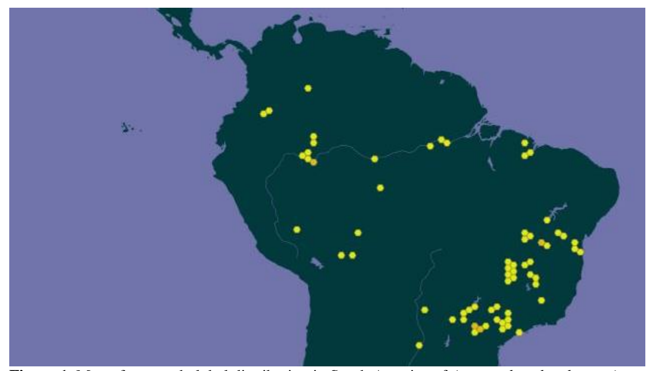
Figure 1. Map of reported global distribution in South America of Acestrorhynchus lacustris . Map from GBIF Secretariat (2017). No verbal descriptions of the established range included the Amazon River basin; these occurrences (in northern Brazil, northwestern Bolivia, Colombia, and Peru) were not included in the climate matching analysis due to uncertainty about their validity. Additionally, the location from Paraguay was excluded from the climate matching analysis because it is outside the established range of the species.