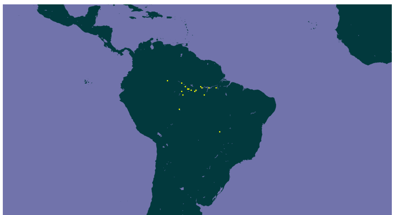
Figure 1. Known global distribution of Ancistrus dolichopterus . Locations are in Brazil. Map from GBIF Secretariat (2017).