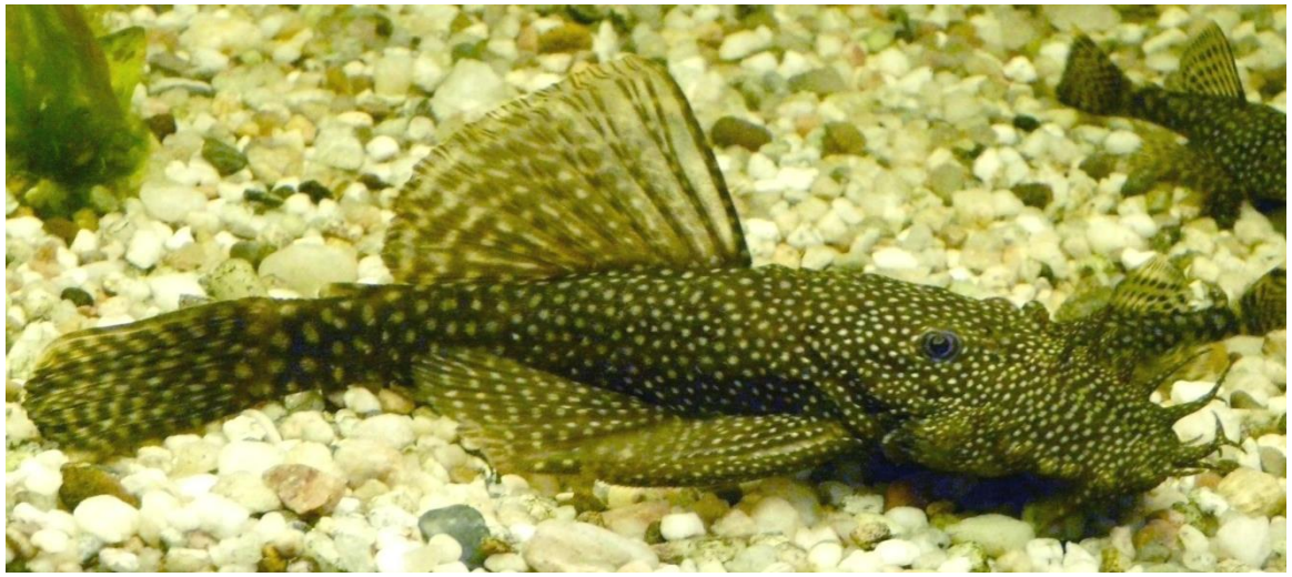
Photo: Billyhill. Licensed under Creative Commons BY-SA 3.0 Unported.

U.S. Fish and Wildlife Service, web version – 3/30/2018