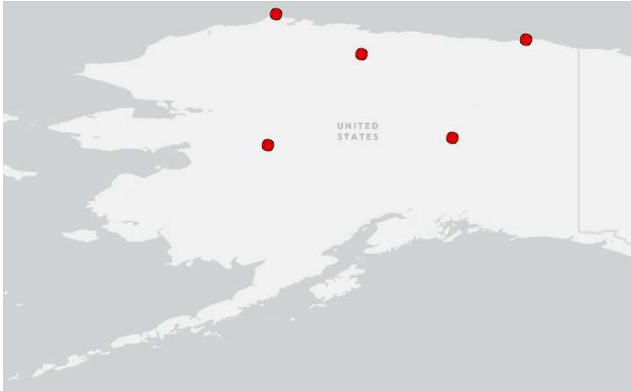
Figure 3. Known distribution of Cyclops strenuus sibiricus in Alaska. Map from Esri (2022) based on locations provided by Hołyńska and Wyngaard (2019).