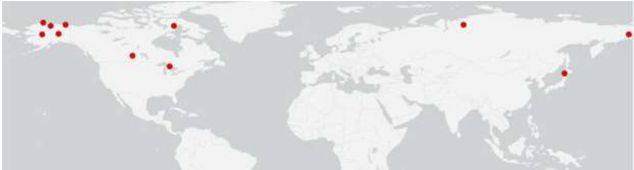
Figure 1. Known global distribution of Cyclops strenuus sibiricus . Observations are reported from northern North America, northern Russia, and northern Japan. Map from Esri (2022) based on locations provided by Makino et al. (2003), Hołyńska and Wyngaard (2019), GBIF Secretariat (2022), and Connolly et al. (2022).