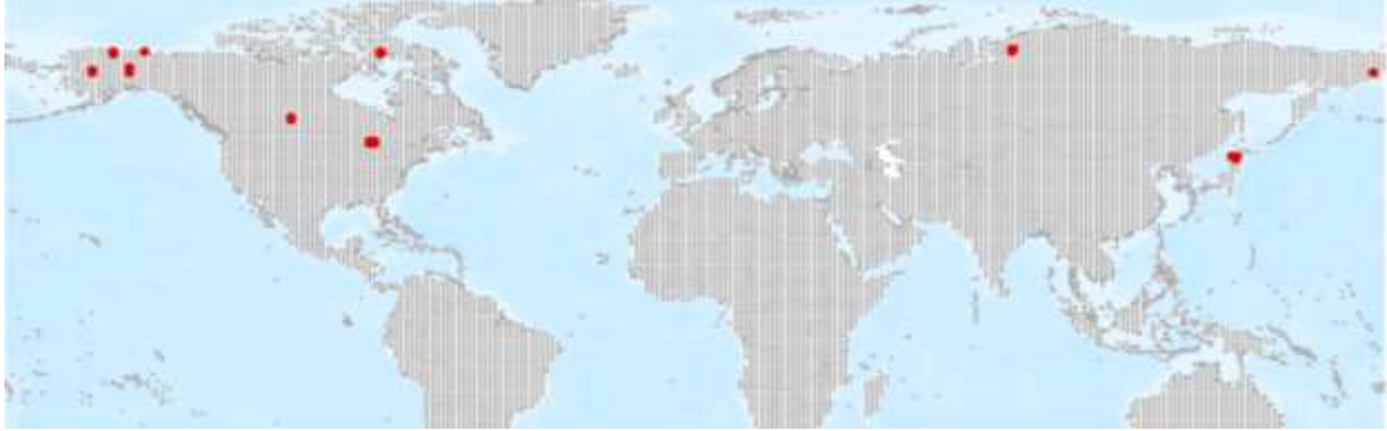
Figure 4. RAMP (Sanders et al. 2021) source map showing weather stations in North America, Russia, and Japan selected as source locations (red; Japan, Russia, Canada, and the United States) and non-source locations (gray) for Cyclops strenuus sibiricus climate matching. Source locations from GBIF Secretariat (2022), Makino et al. (2003), Hołyńska and Wyngaard (2019), and Connolly et al. (2022). Selected source locations are within 100 km of one or more species occurrences, and do not necessarily represent the locations of occurrences themselves.