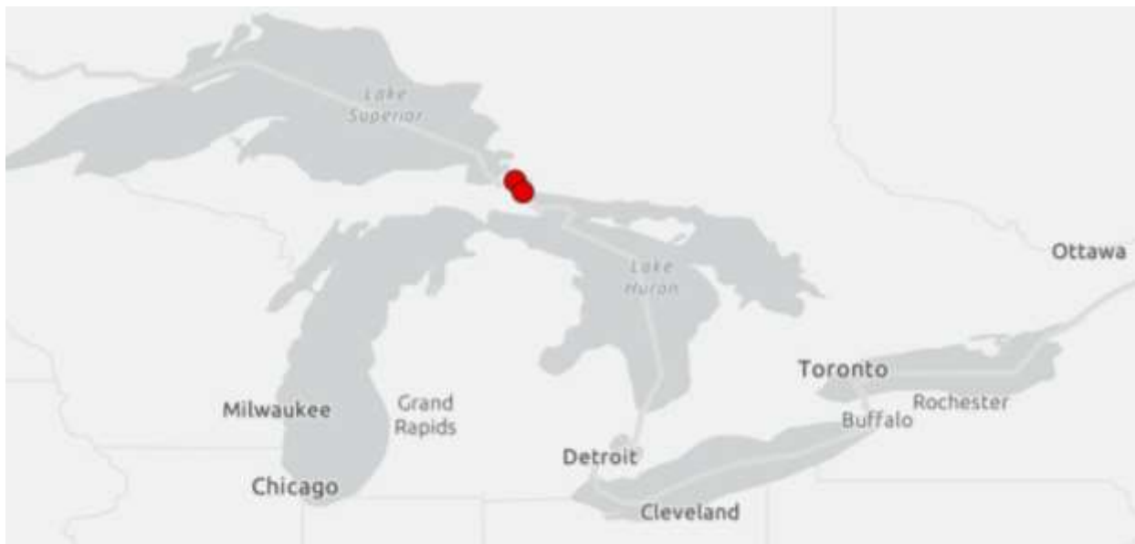
Figure 2. Known distribution of Cyclops strenuus sibiricus in the contiguous United States. Map from Esri (2022) based on locations reported by Connolly et al. (2022).