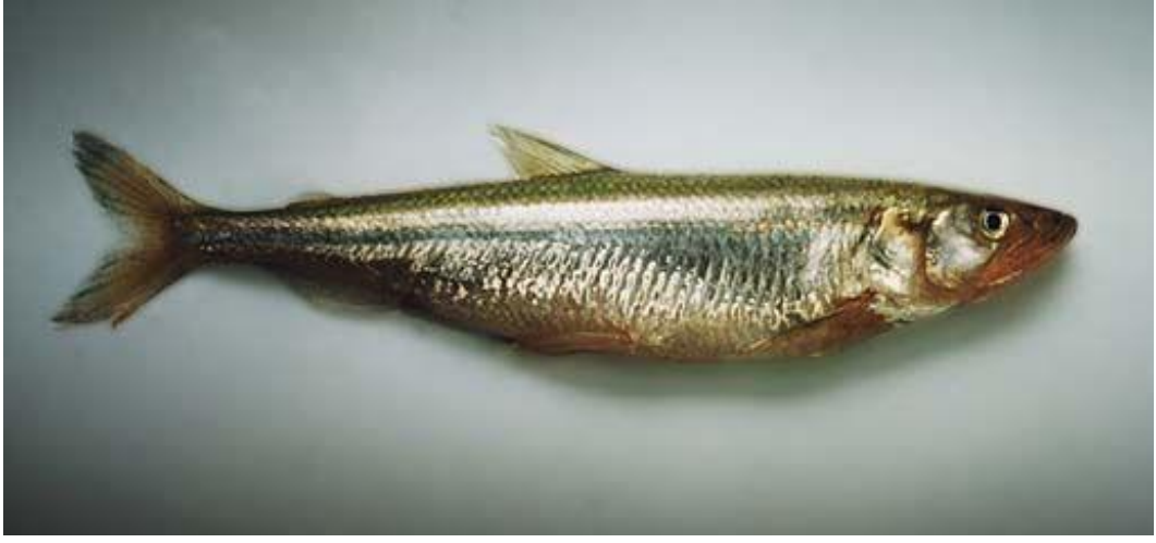
Photo: Nederlands Visserijbureau. Licensed under CC BY-NC. Available: http://eol.org/data_objects/23204628. (January 2017).

U.S. Fish and Wildlife Service, March 2015 Revised, January 2017 Web Version, 09/14/2017