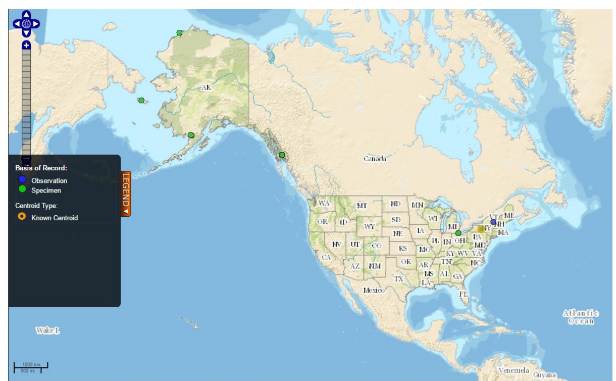
Figure 2. Known occurrences of Osmerus eperlanus . Map from USGS (2016). None of the points represent confirmed established populations (see Status in the United States, above) and they were not included in climate matching.