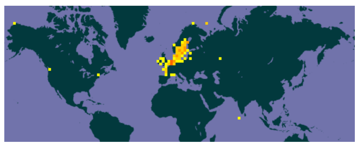
Figure 1. Known global established locations of Osmerus eperlanus . Map from GBIF (2016). Locations in the Indian Ocean, North America, the Barents and Mediterranean Seas, and on the north coast of Norway do not represent established populations (see Status in the United States, and Distribution Outside the United States, above) and were not included in climate matching.