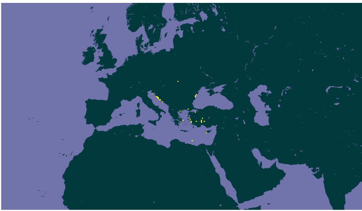
Figure 1. Known global distribution of Knipowitschia caucasica.