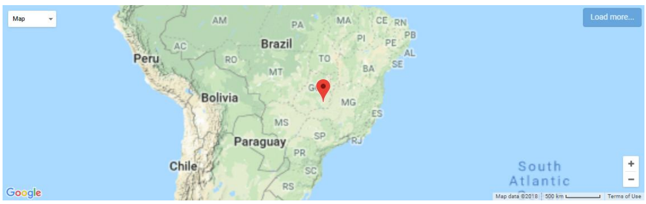
Figure 1 . Known global distribution of Hypostomus denticulatus . Location is in Brazil.