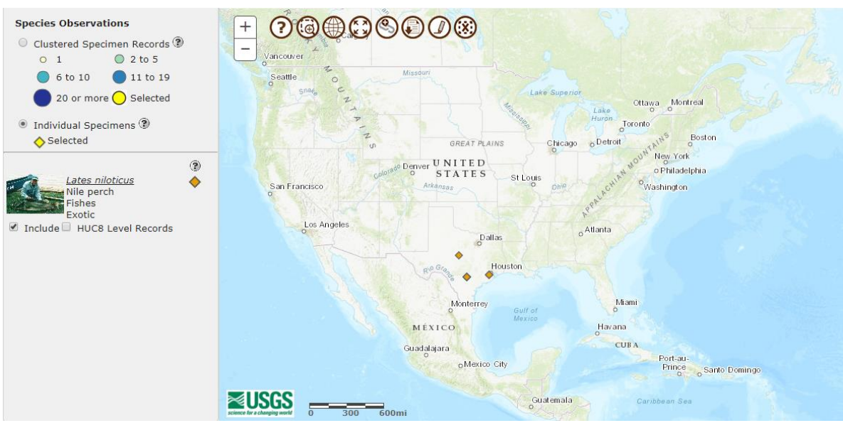
Figure 2. Collection locations of Lates niloticus in the United States. All locations represent either failed or extirpated populations, so none of the collection locations were used as source locations for climate matching. Map from Schofield (2018).