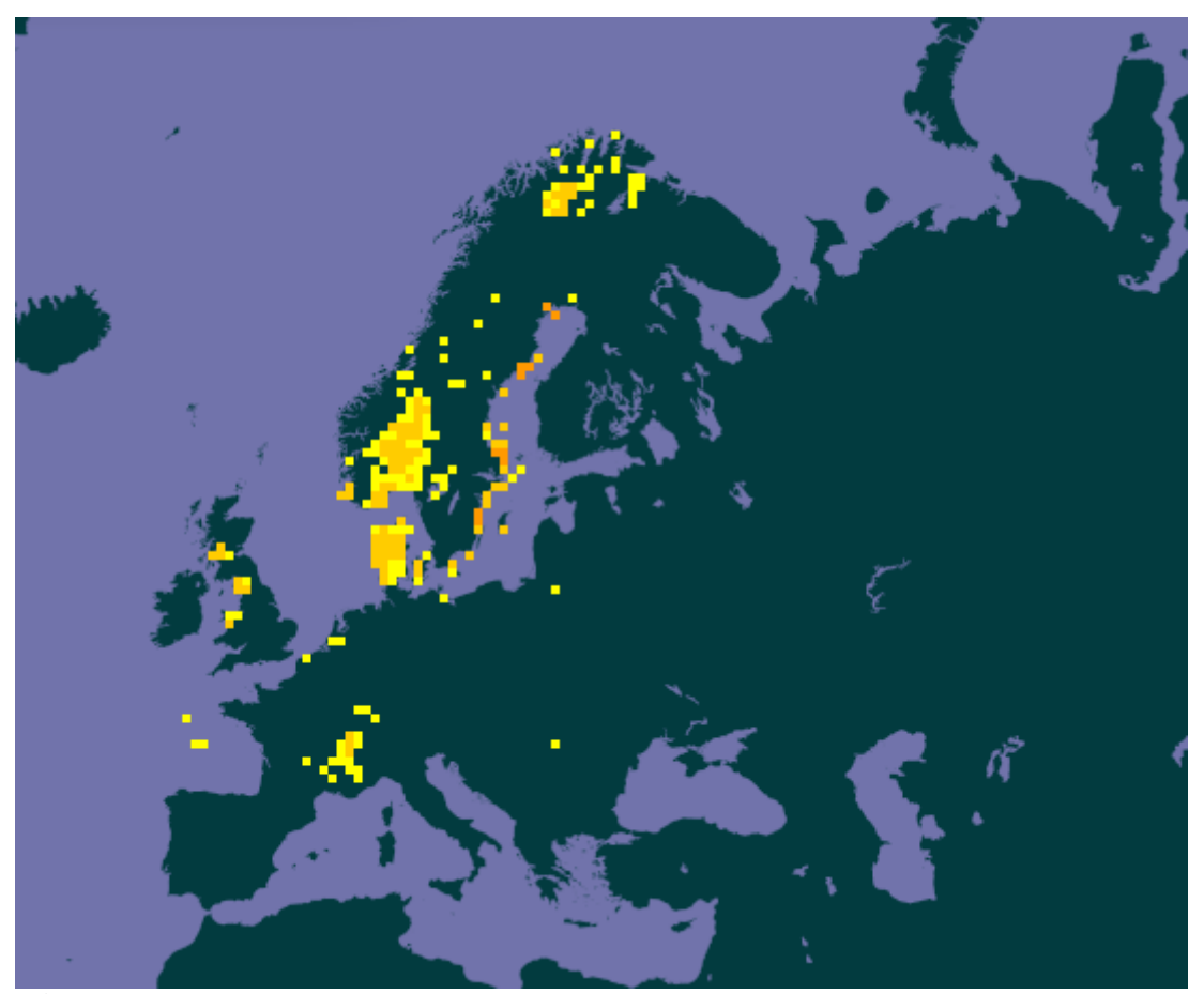
Figure 1. Map of known global distribution of Coregonus lavaretus . Map from GBIF (2014). Location in the Philippine Sea was not included because it was incorrectly located.