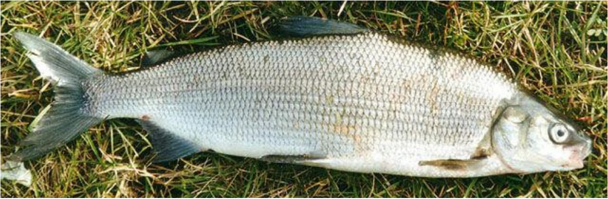
Photo: © T. Østergaard. Licensed under CC BY-NC 3.0. Available: http://creativecommons.org/licenses/by-nc/3.0/.

U.S. Fish and Wildlife Service, August 2012 Revised, September 2014 and July 2015