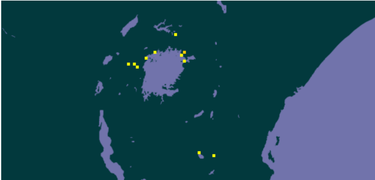
Figure 1. Known global established locations of O. esculentus around Lake Victoria on the border of Uganda, Kenya, and Tanzania. Map from GBIF (2016).