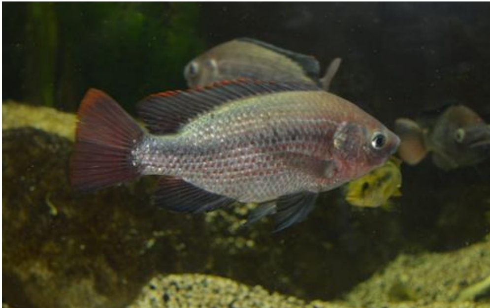
Photo: Frank M. Greco. Licensed under Creative Commons (CC-BY). Available: http://www.fishbase.se/photos/UploadedBy.php?autoctr=20452&win=uploaded . (May 2017).