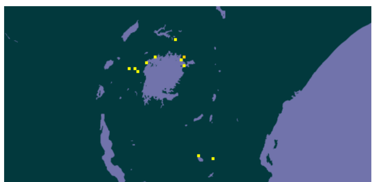
Figure 1. Known global established locations of O. esculentus around Lake Victoria on the border of Uganda, Kenya, and Tanzania. Map from GBIF (2016).