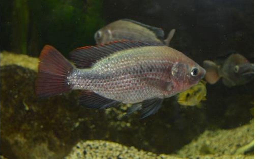
Photo: Frank M. Greco. Licensed under Creative Commons (CC-BY). Available: http://www.fishbase.se/photos/UploadedBy.php?autoctr=20452&win=uploaded. (May 2017).

U.S. Fish & Wildlife Service, January 2012 Revised, May 2017 Web Version, 3/27/2018