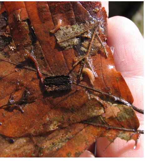
Colorless, without eyes, and about the size of the tip of your pinky fingernail. While these amphipods aren't cute or cuddly, they are helpful warnings for water quality issues and are food for other animals like salamanders.

The size of an adult Kenk's amphipod is about the width of a pinky fingernail (1/8 to 1/4 inch). Since it lives primarily underground, it is colorless and has no eyes. While much of the life history of the species remains a mystery, biologists believe it may eat bacteria and fungi found on dead and decaying leaves. Its underground habitat makes it very difficult to study until it is present in the spring outflows on the surface.