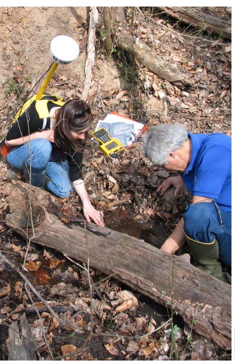
Biologists search for Kenk's amphipods by overturning leaves and carefully digging in the fine soil of spring seepages.

The Army has established buffers around the springs in which no land disturbing activities can occur without coordination with the Service. These buffers will prevent water quality impairment in the future and maintain